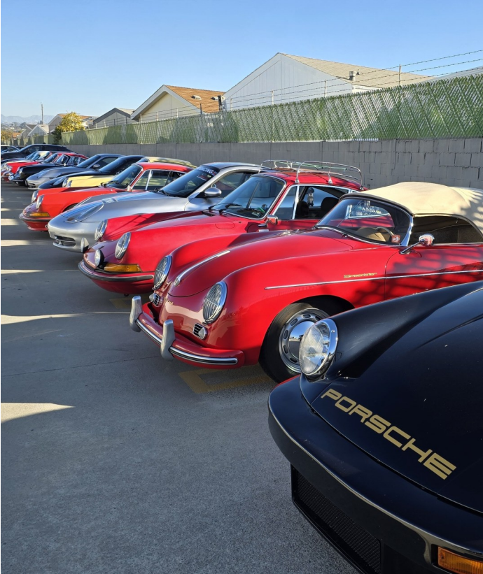
The 356 Club Swap Meet in Fullerton California car display.