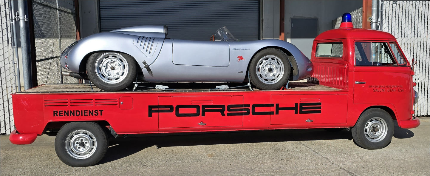
Vintage Porsche Car Hauler and Porsche 550 Spyder clone at Car week in LA for the 356 Club Swap Meet and Car show

Artwork: .jpg Send your ad to the newsletter editor with your name, business name, address, phone number and email. An invoice will be sent to you by our Treasurer. Email to: sstamnes@netnet.net or clpa439@gmail.com The Fox Valley Region, Porsche Club of America, neither endorses any advertiser nor warrants any product or service. Do you have a product or service that our members might use or need? This monthly newsletter (published 12 x per year) is emailed to the region’s members and is also posted on our region website for viewing by hundreds more.