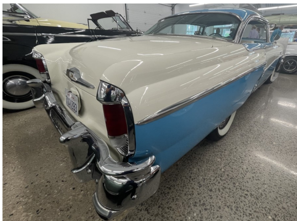
Photo left: The bygone era of substantial bumpers.