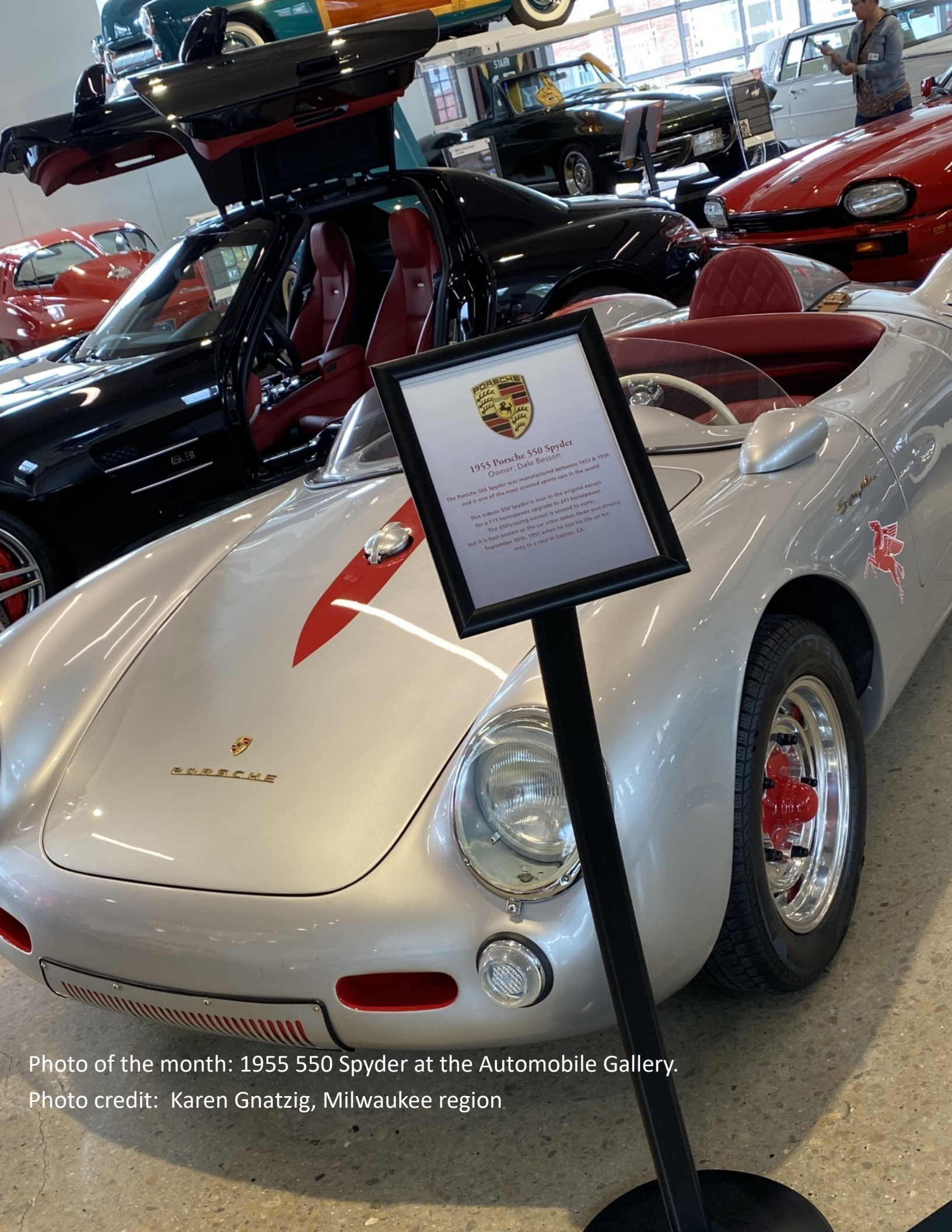
Photo of the month: 1955 550 Spyder at the Automobile Gallery.