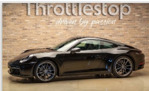
2021 Porsche 911 Carrera Coupe