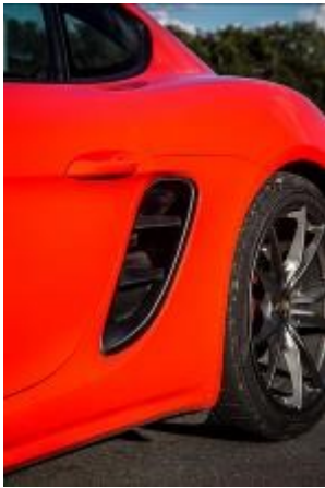
These are vertically oriented photos.