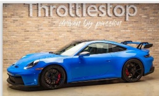
2022 Porsche GT3