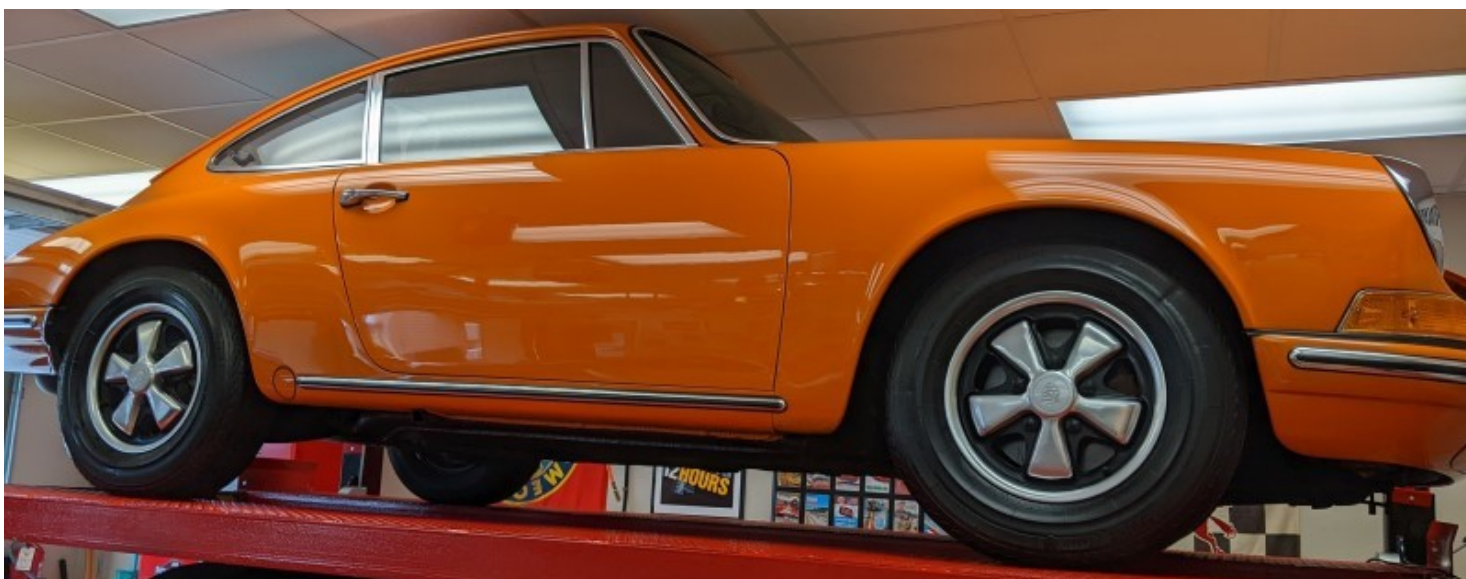
All-original 1970 911T.