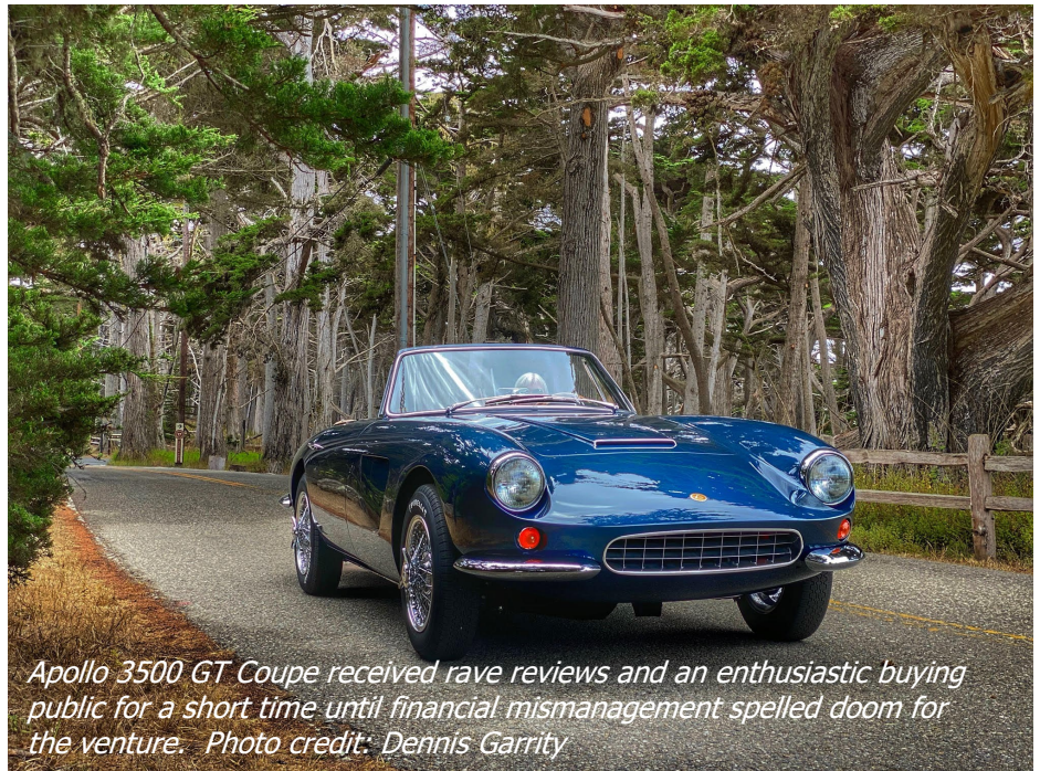
Apollo 3500 GT Coupe received rave reviews and an enthusiastic buying public for a short time until financial mismanagement spelled doom for the venture.