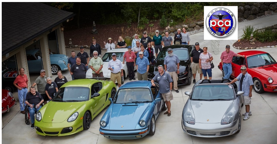
Featured story: The report of the region's visit to the Throttlestop begins on page 10.