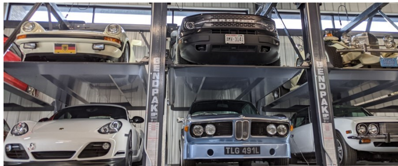
The Throttlestop features a collection of motorcycles as well as consignment cars. Below, region members visited long-time Porsche collector Tom Grunnah.