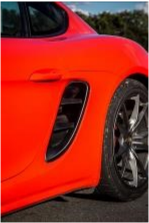
These are vertically oriented photos.