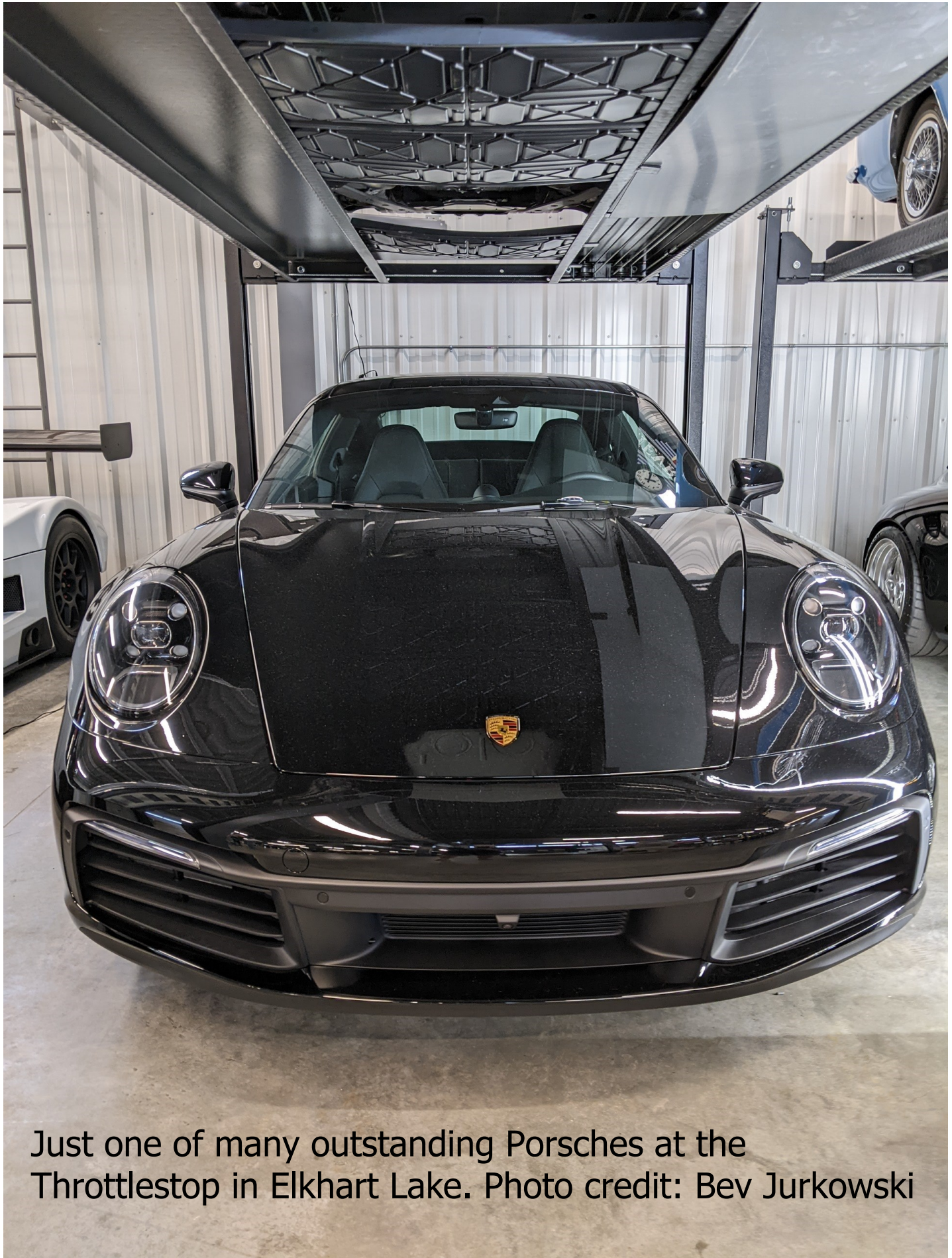
Just one of many outstanding Porsches at the Throttlestop in Elkhart Lake.