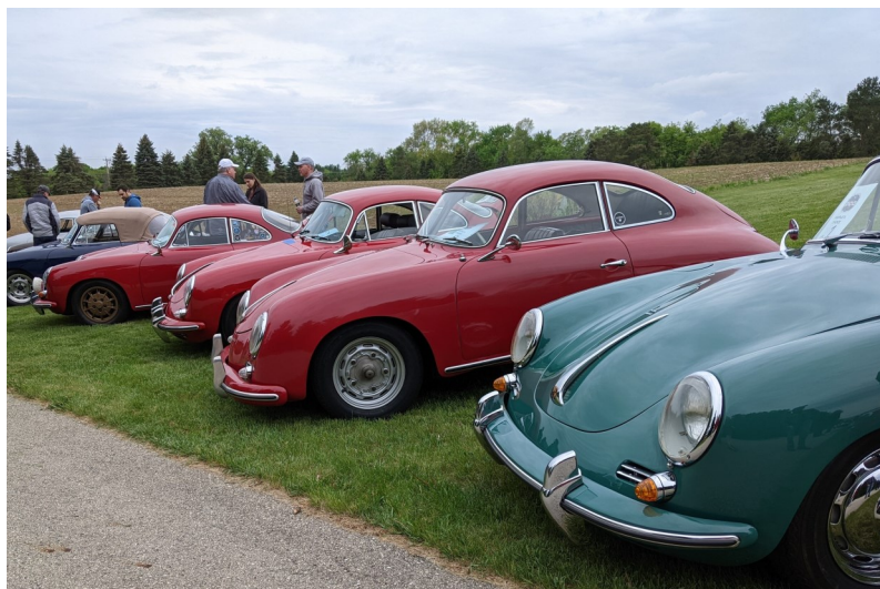
356s were celebrated at the BBQ.