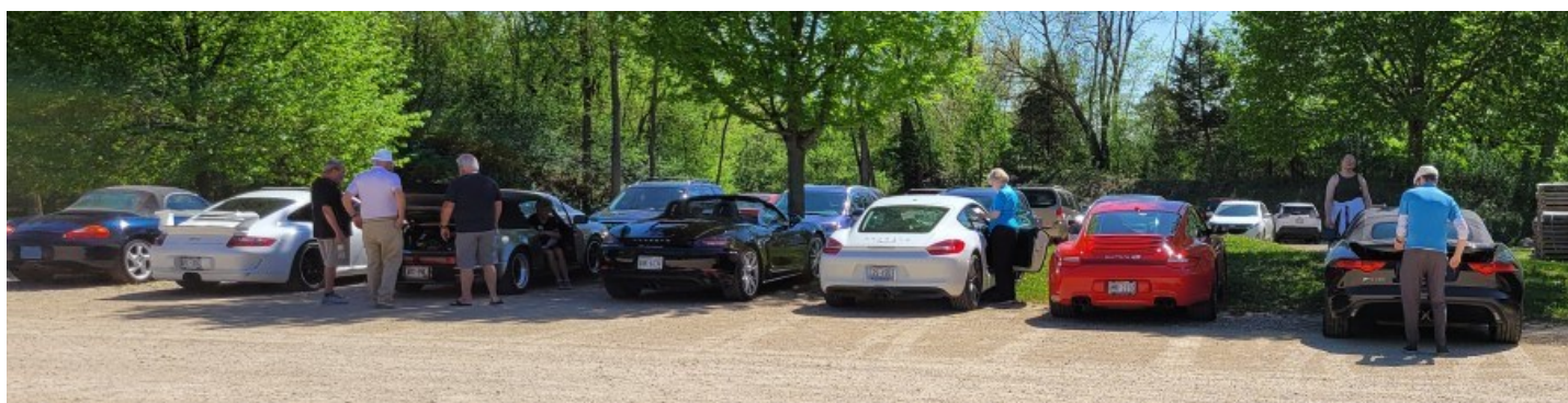
PORSCHE PARKED AT A REST STOP.... Region members and their Porsches at a rest stop during the Driftless Distillery tour. See pages 10-12 for more details.

https://pcafoxvalley.shutterfly.com/pictures/184