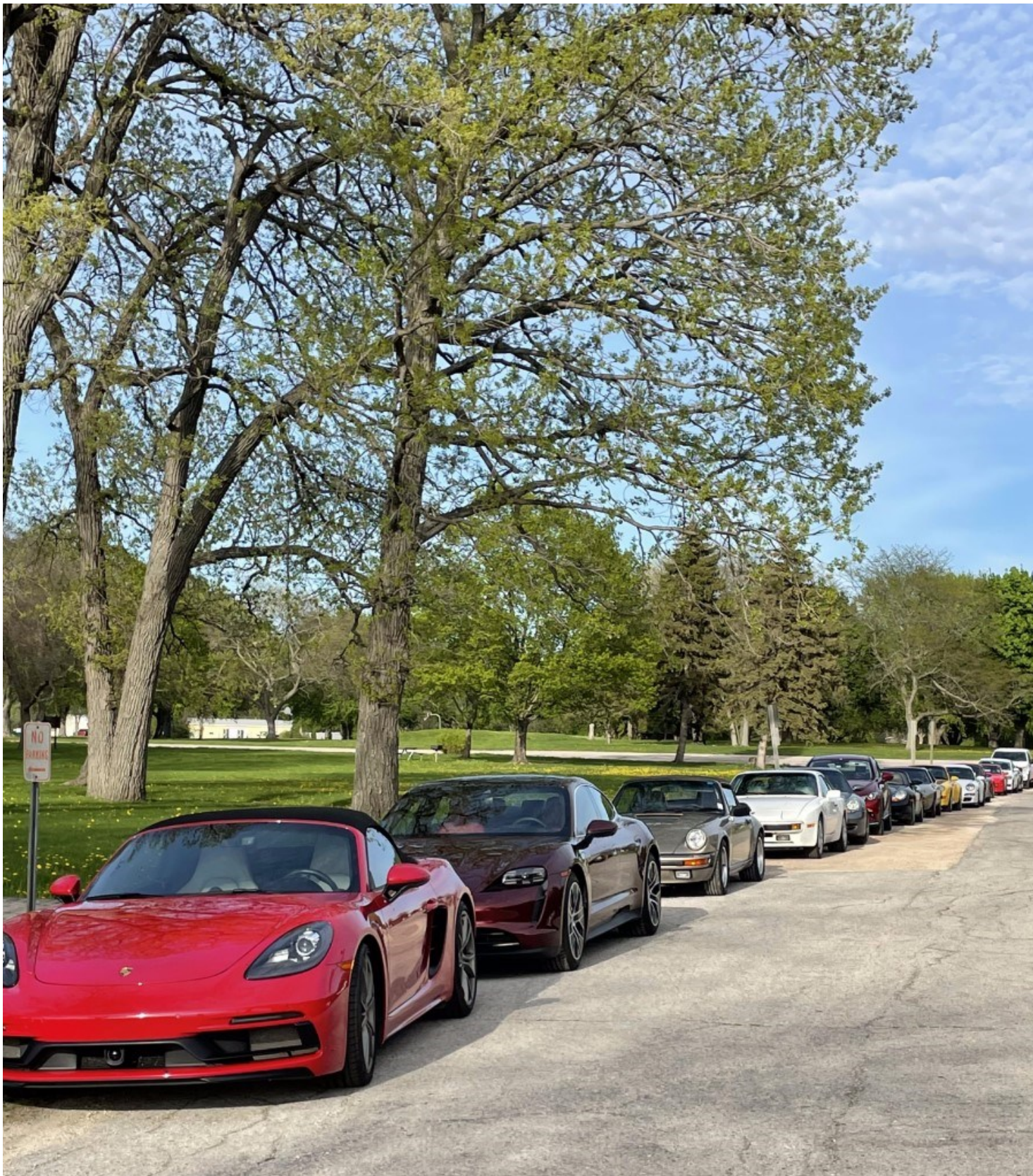
Spring Opener brings out 39 members. Porsches line the drive to Jim and Linda's in Pipe, Wis.