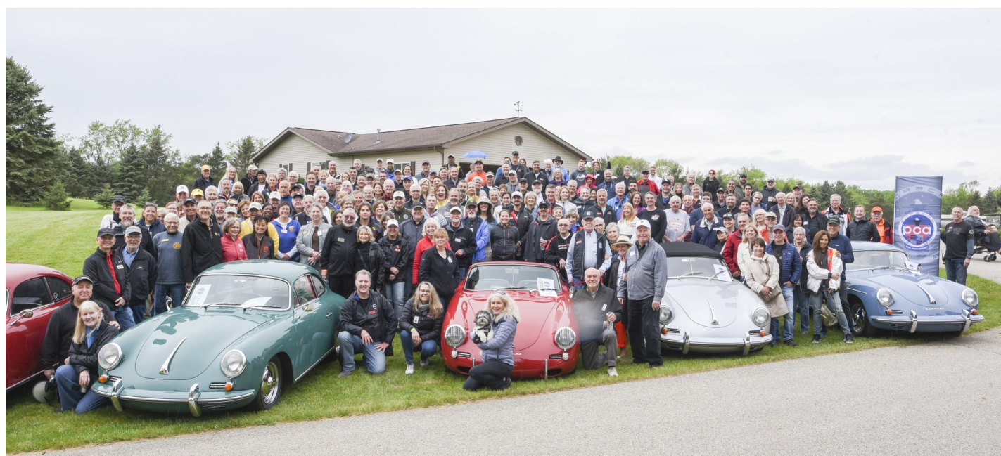
The gang's all here at the May 21 BBQ in Elkhorn, Wis.

More photos: https://pcamilwaukee.shutterstock.com/pictures/19034