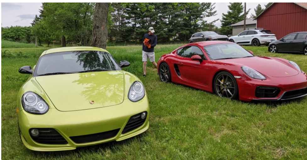
Cayman cousins at the BBQ. A Cayman R, left, and 2015 Cayman GT5.