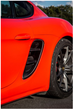
These are vertically oriented photos.