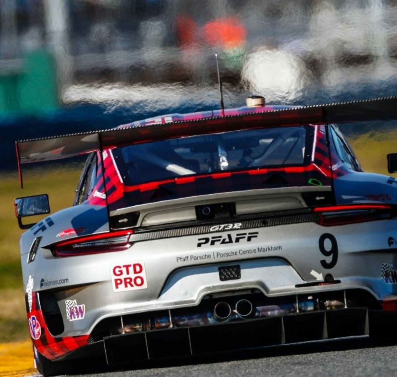
Porsche teams at the qualifying runs for the 24 Hours at Daytona.