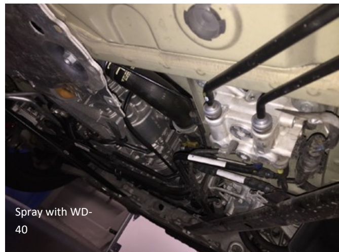
Spray with WD-40