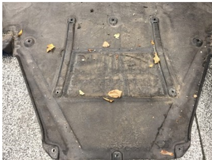
Above and below: Half of the debris that didn't pour down on my face.

Editor's note: Whaletales welcomes all do-it-yourselfers to document and explain some of the work they do to keep their Porsches running well.