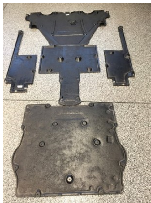
Voila! Good as new