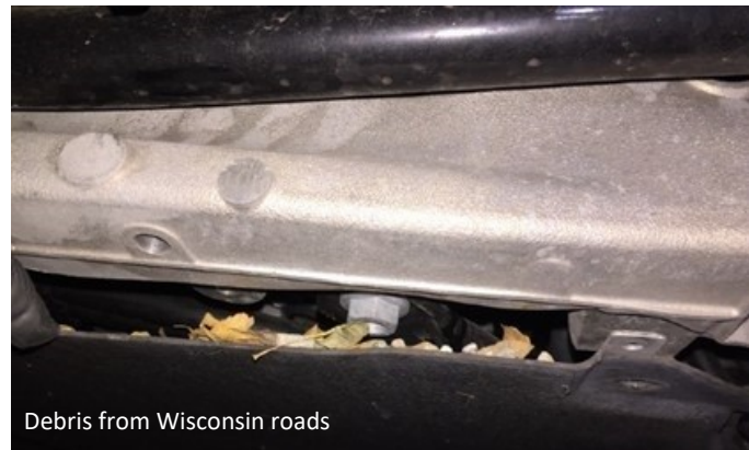
Debris from Wisconsin roads