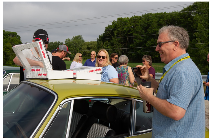
Fuel for the people before the drive.