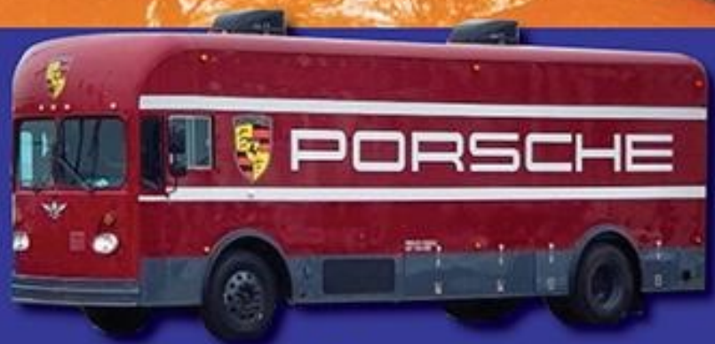
Vintage Race Transporter