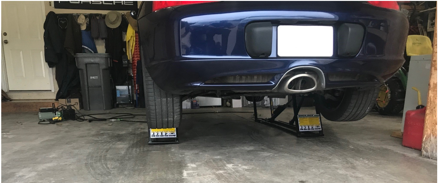
The Boxster is ready for lift off.

each unit under the vehicle perpendicular and use the front lift under each front lift point and the rear lift under each rear lift point. The lift itself is smooth and even between the two lifting platforms. To lift the Boxster from flat to full lift height took less than 30 seconds. The lifting platforms have two safety locks, one halfway to full height and another at the full lifting height. At either point you can stop the lift and lower it down to the safety lock and the lift will remain there until you release to the locks. Once locked in place you can disconnect the hydraulic lines and the vehicle will remain elevated until you disengage the safety locks. Some commentators online even state that they store their vehicles for the winter on the Quick Jack but it is generally not recommended to do this but it goes to show that they are safe to leave up for extended periods of time.