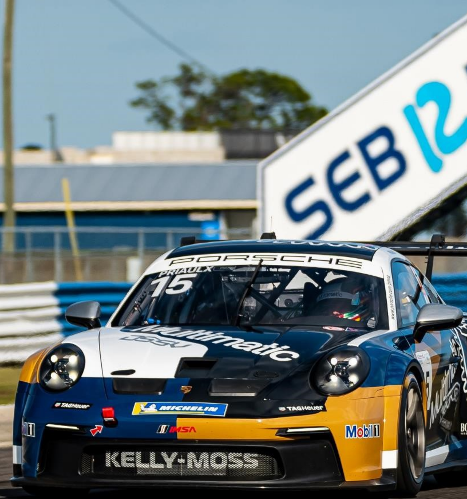
Number 15 Kelly-Moss Road & Race 911 GT3 Cup, Sebastian Priaulx (Great Britain) 2021, PCNA