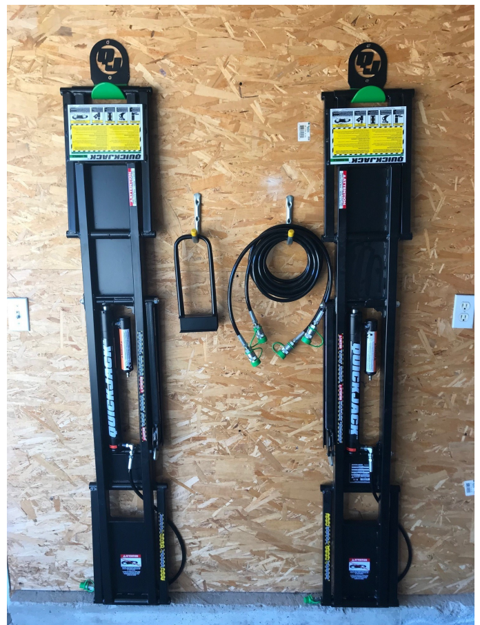
Wall hanging units

So if you are looking for an affordable option, (the total kit was less than $1,500 on sale thru Costco), to lift your vehicle to work on it or to do longer term projects and you want to avoid the jack and jack stands, the Quick Jack might be just what you've been looking for.