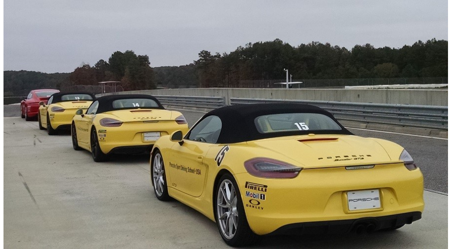
Participants in the Porsche Sport Driving school drove these cars.