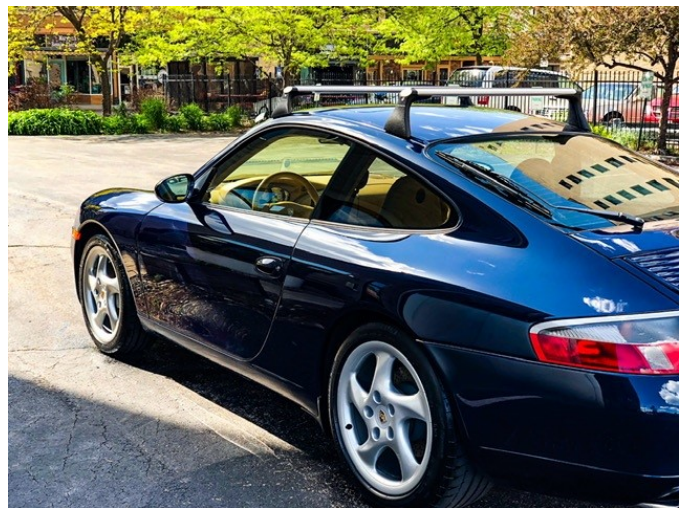
The Larson 911 Carrera 4 above and Macan below.