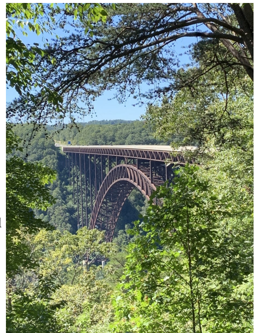
NEW RIVER GORGE