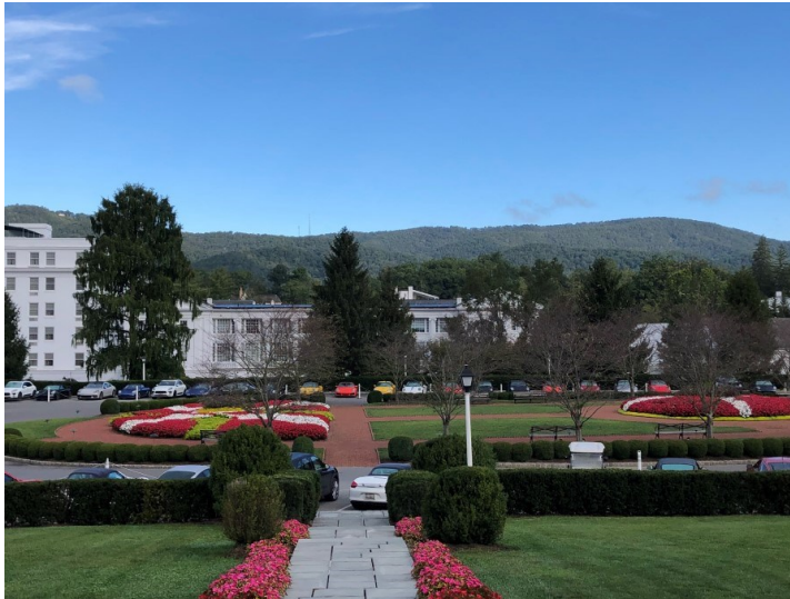
CIRCLE OF PORSCHEs AT THE GREENBRIER