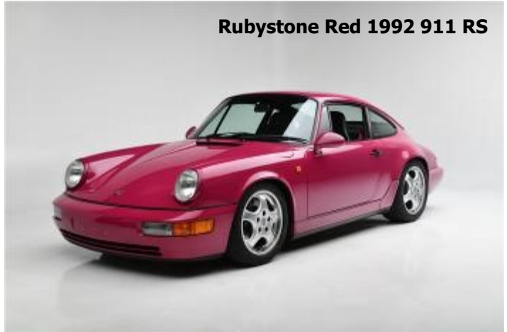
Rubystone Red 1992 911 RS

Did any region members own a 1992 911 RS like this? It was sold at the Barrett-Jackson Auction in Scottsdale in 2019 for $324,500.