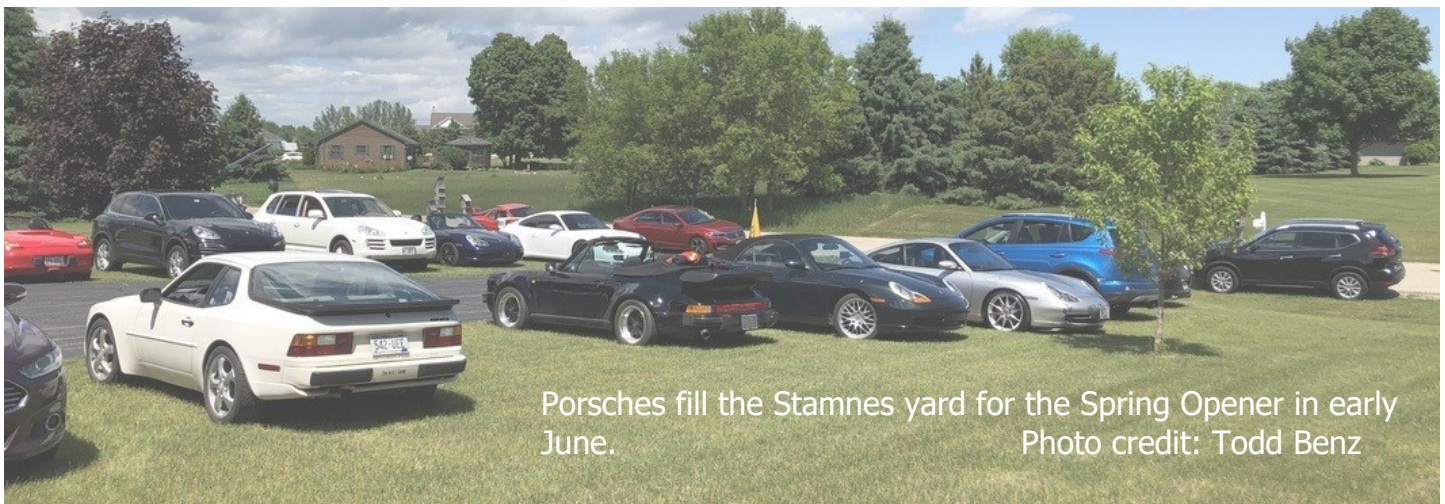
Porsches fill the Stamnes yard for the Spring Opener in early June.