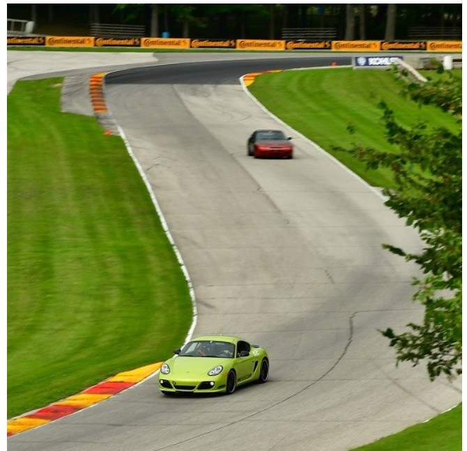
Porsches on that track for a DE at Road America.