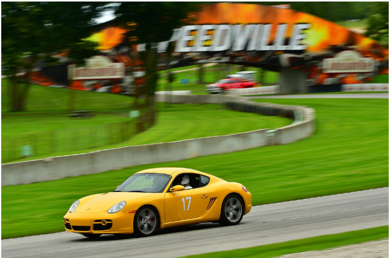
A Speed Yellow Cayman participates in DE at Road America.

Register for any or all of these events here: https://www.motorsportreg.com/events/pca-milwaukee-de-2020-road-america-884783