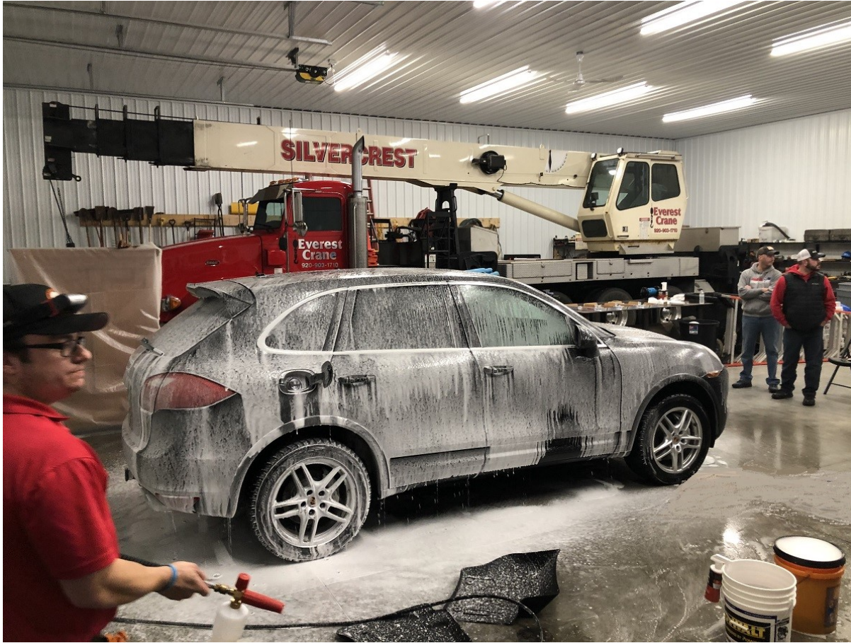
A Cayenne gets special treatment during the tech session hosted by Total Package Detailing in Little Chute. See next page for the report.