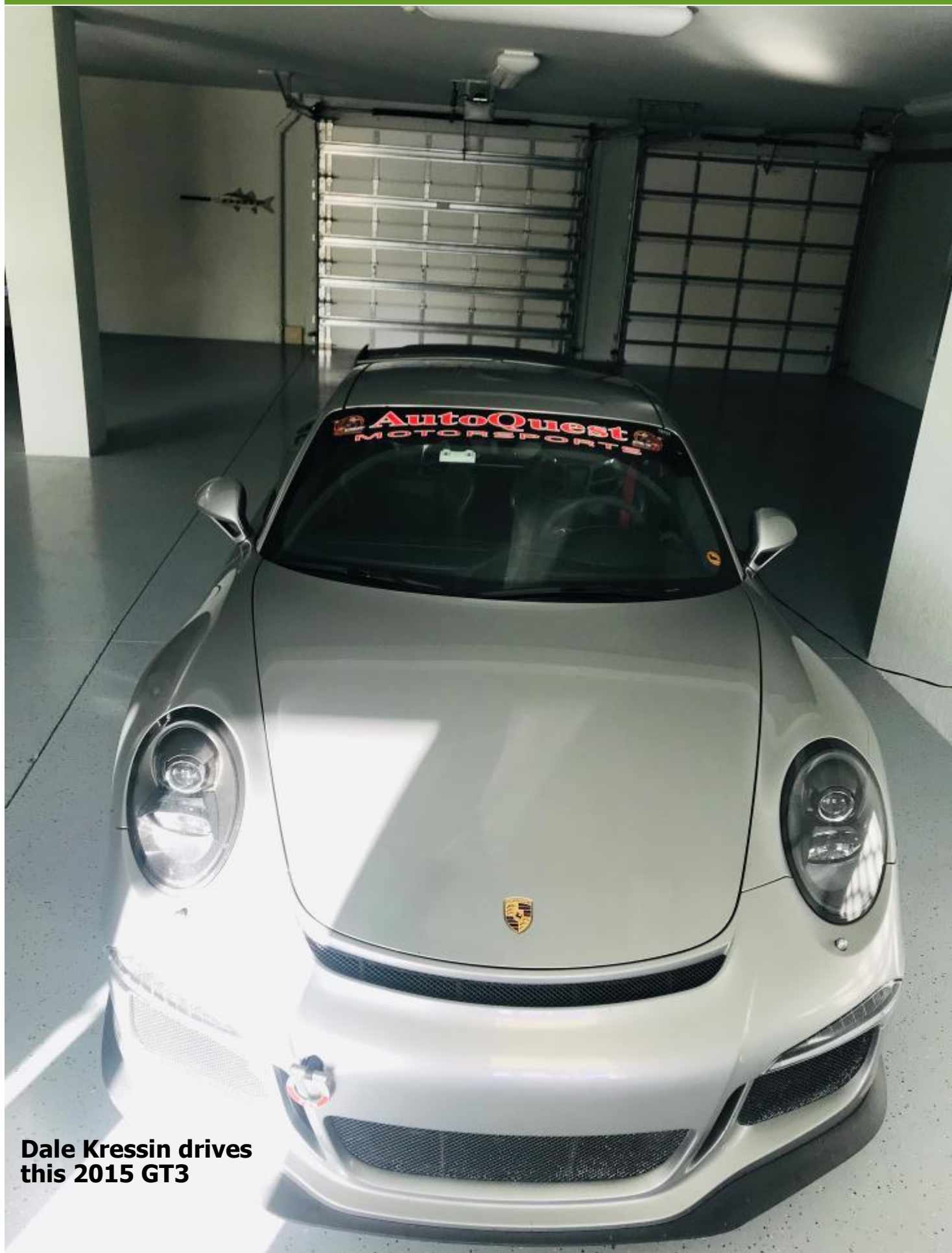
Dale Kressin drives this 2015 GT3