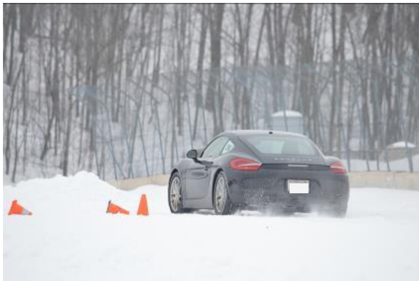
Winter autocross at Road America in 2019.