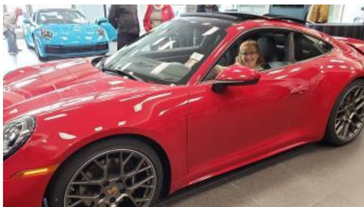
See more photos on pages 19-20.