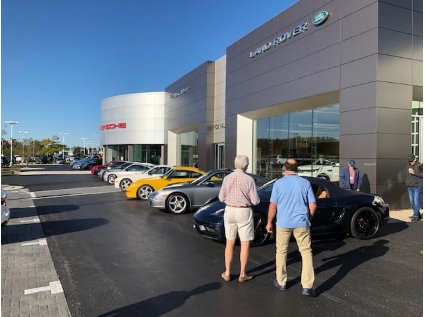
Photo above: Region members' Porsches line up at Porsche of the Fox Valley during the dealer's Cars & Coffee the morning of Sept. 14.