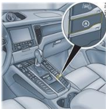
The auto start/stop bypass on the Macan.

A few brands have installed bypass function pushbuttons (like my 2018 Porsche Macan), but you GM folks have found out that brand has quietly removed the bypass button in the 2019s. (like our new 2019 GMC Terrain Denali)...and promise ALL their vehicles will migrate to this technology in the future. The claim is saved gasoline and fewer emissions.