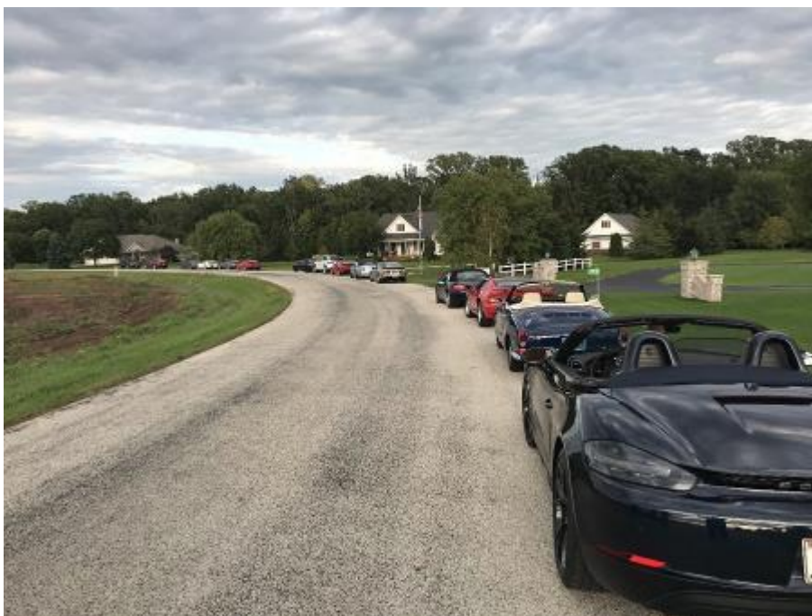
Photo left: Porsches line the road near the Benz residence during the Chili and bonfire event the afternoon of Sept. 14.