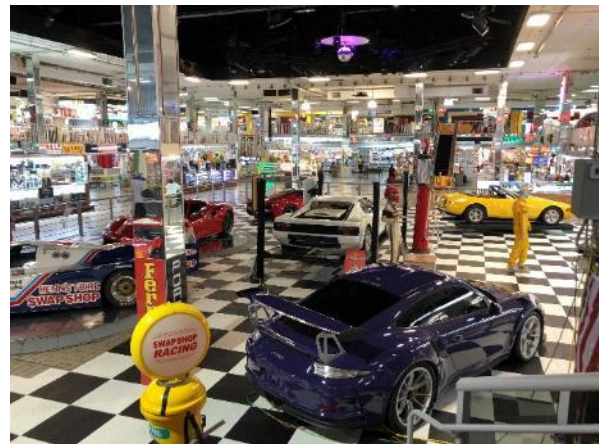
Flea Market. Who knew?