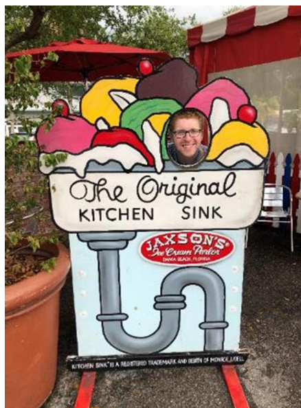
Delicious ice cream