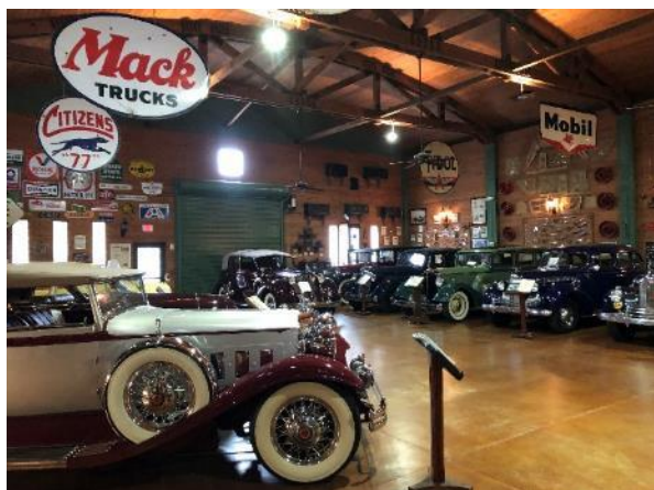
Packard Museum. Awesome.