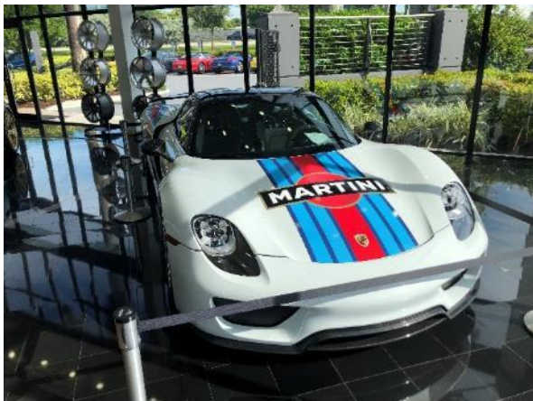
Champion Porsche 918 Spyder For Sale