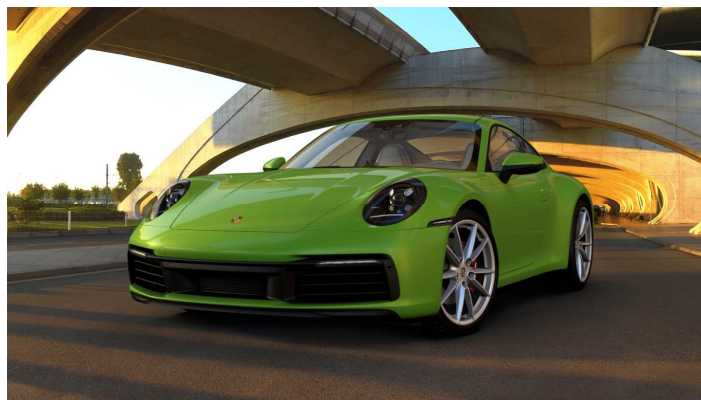
2020 911 Carrera S in Lizard Green (special color option)