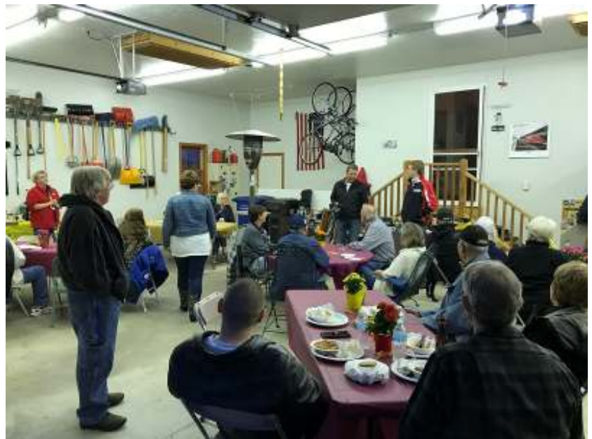
The garage kept attendees warm and dry as they enjoyed chili and camaraderie.

Next year's event may be moved to a weekend in September. Maybe then we can have a real "Benz" Bonfire (if the weather's not too hot).