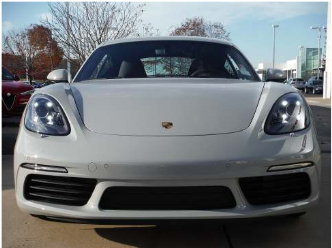
Tame that reptile — the headlights and front grill of the 718 Cayman resemble a caiman, a large aquatic reptile found in the swamps and tropical rivers that cover Central and South America.

check out the PSIs of the turbo, coolant and oil temperature with the oil pressure as well. In the not too distant past, one would have to be driving a 911 to have that kind