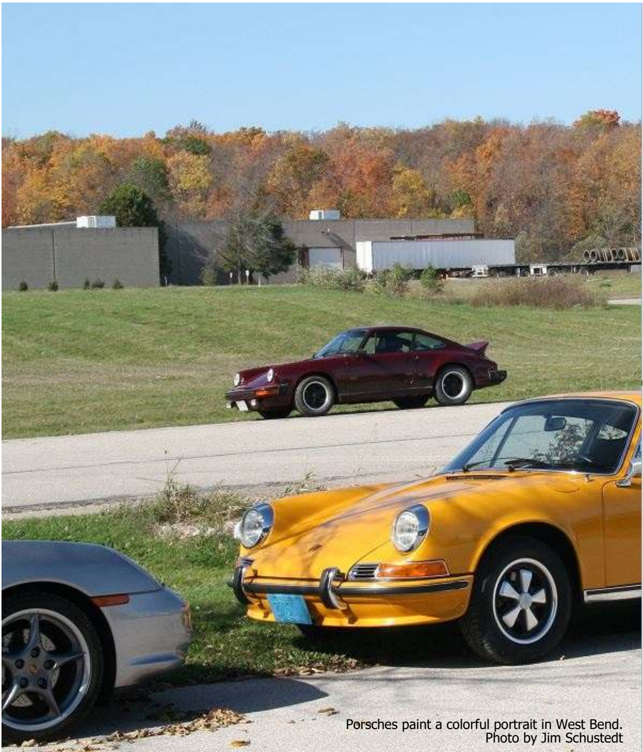
Porsches paint a colorful portrait in West Bend.

Newsletter for members & friends of Fox Valley Region November 2017