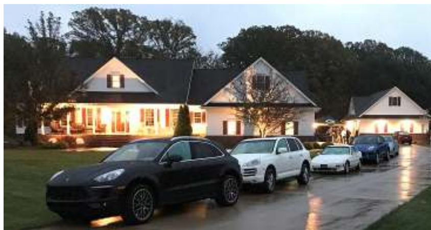
Porsches line the wet road outside the Benz home for the 2017 Fall Social.