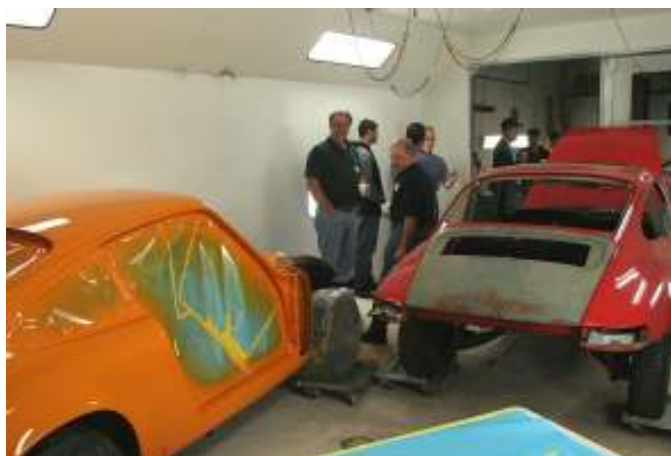
Inside the paint booth at Paintwerks.