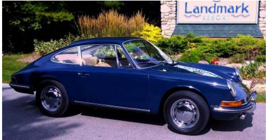
The beautiful 1967 912 at the region's 25th anniversary celebration.

The car has 38,000 miles on it and has never seen a snow flake. We have taken it on many car rallies with the PCA, Wisconsin Sports Car Club, Fox Valley Sports Car Club and SCCA.