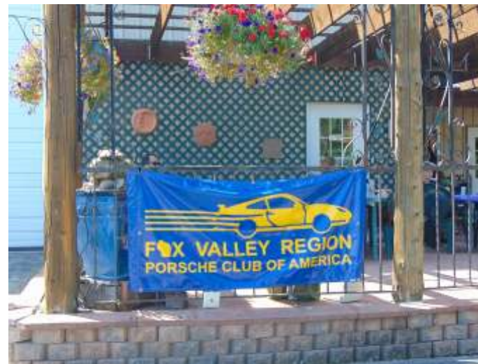
The region flag held a prominent spot at the gathering.