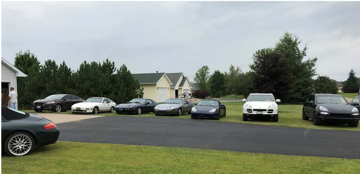
Eight Porsches roamed the roads of the Fox Valley on Aug. 26 during the region's Scavenger Hunt, hosted by Shaun and Dee Stamnes.

Dec. 9 – Holiday Party. Save the date. New venue in 2017 for the Fox Valley Porsche Club Holiday Party! It will be held on Saturday, Dec. 9, at the Radisson Hotel in Green Bay. A block of rooms is available – please call 800/333-3333 or direct at 920-494-7300 to receive the group rate of $109 for the night. To receive the group rate, please request a room in the Fox Valley Porsche Club block. More info to come.