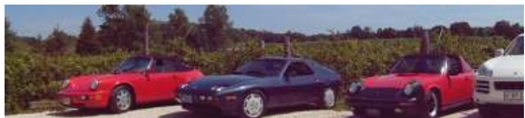
Just a few of the more than two dozen Porsches that brought region members to the potluck social.