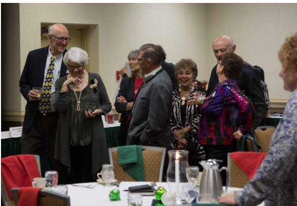
Members and guests enjoy the social time.