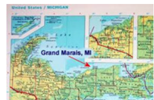
Eastern most point of tour, Grand Marais