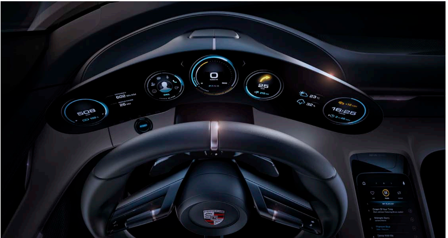
Porsche Project E cockpit