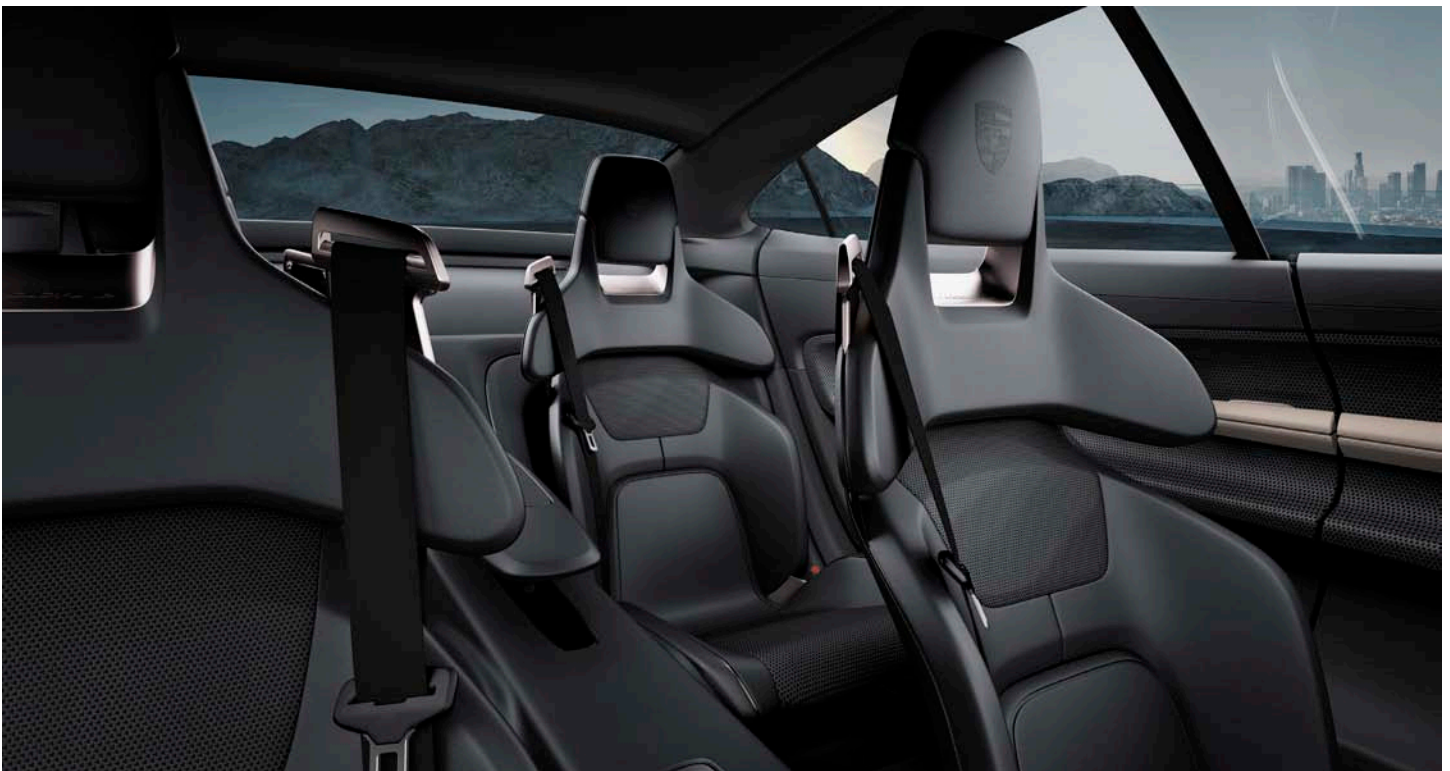
Porsche Project E interior accommodations (Porsche AG Press Database)