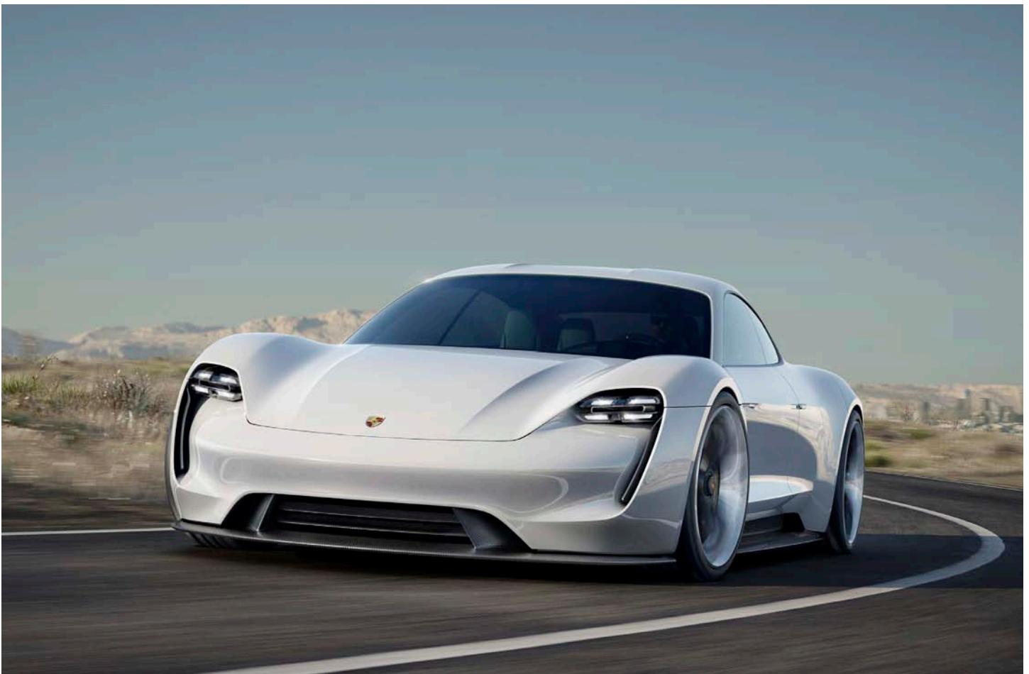
Porsche Project E