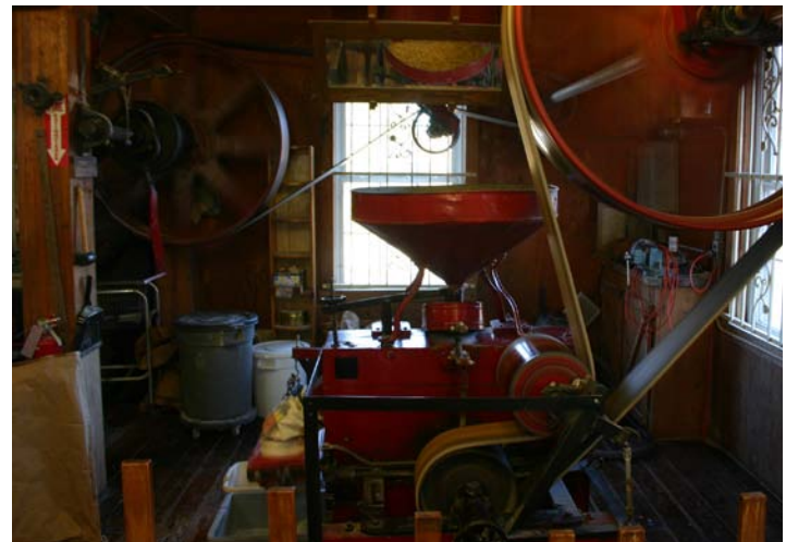
War Eagle Mill in Rogers, AK