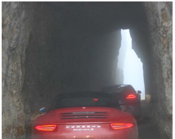
Tour bus anyone?