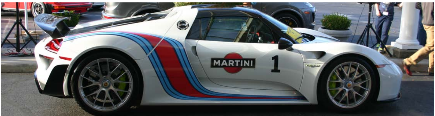
Not something you often see, now is it? Driven in by a first time Porsche owner from Dallas, TX