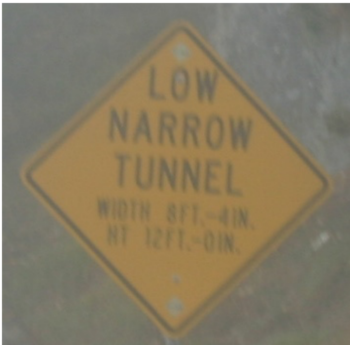
+/- a few inches