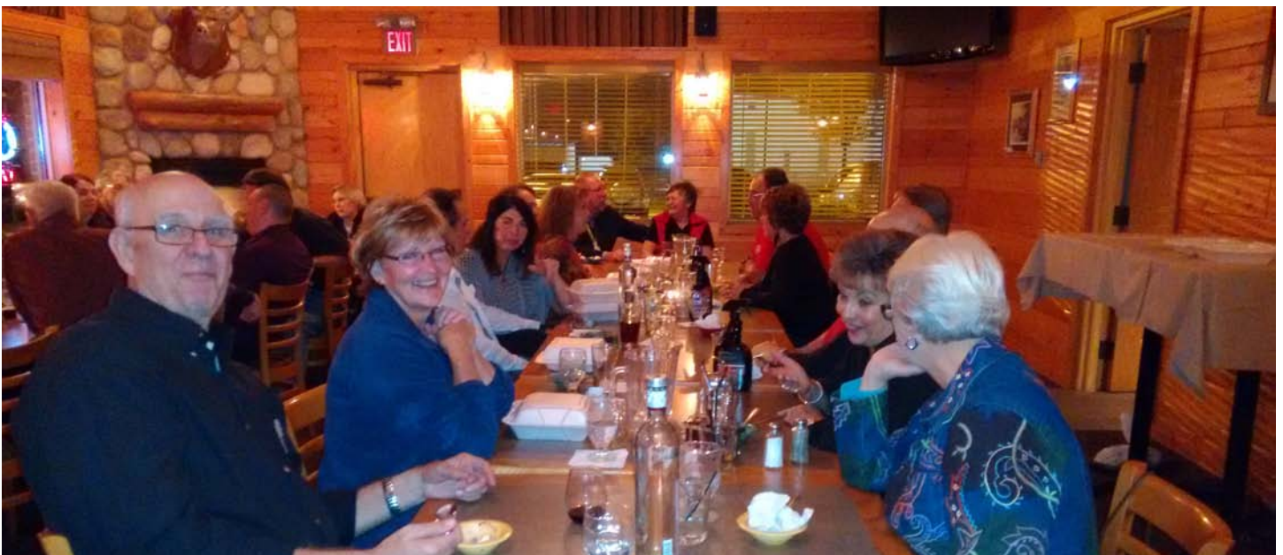
The evening passed by very quickly, with a lively and enthusiastic group