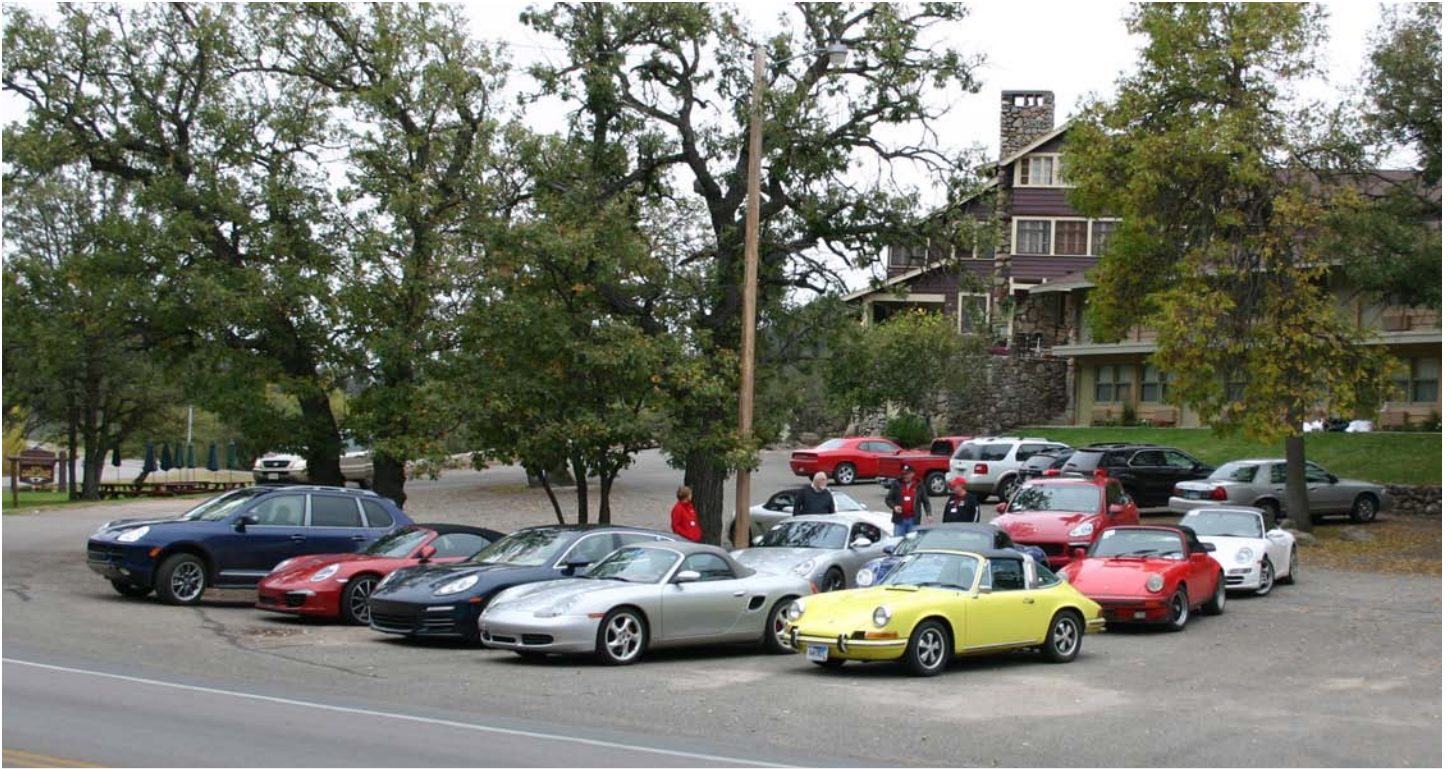
A visit to Custer State Park Game Lodge, Custer, SD during a 2015 PCA Escape tour