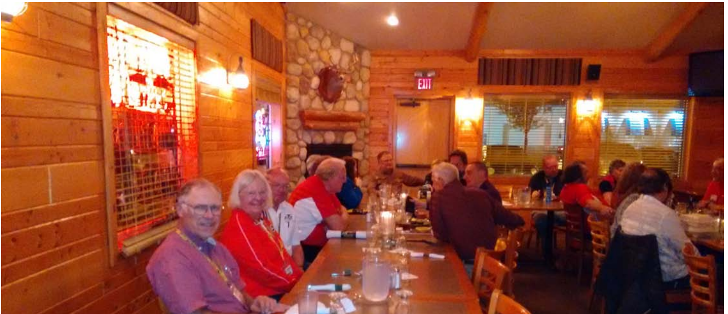
Socializing in a relaxing atmosphere