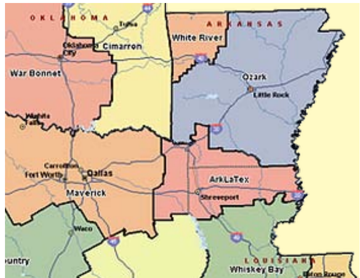
OK, TX, AK, & LA (PCA Zone 5 map)