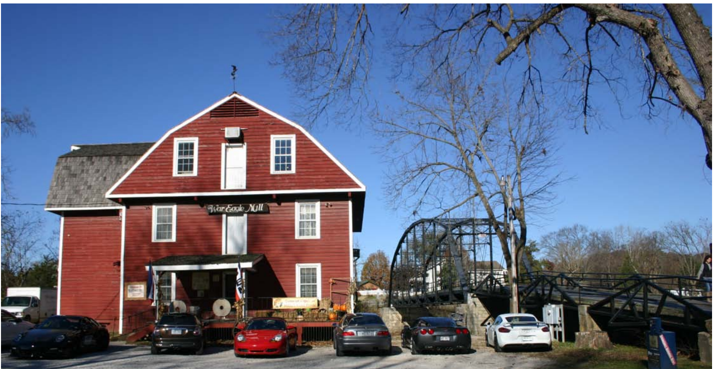
War Eagle Mill near Rogers AK, visited during PCA Palooza 2015