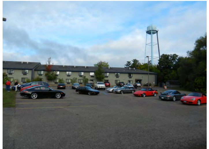
Reserved Porsche parking...