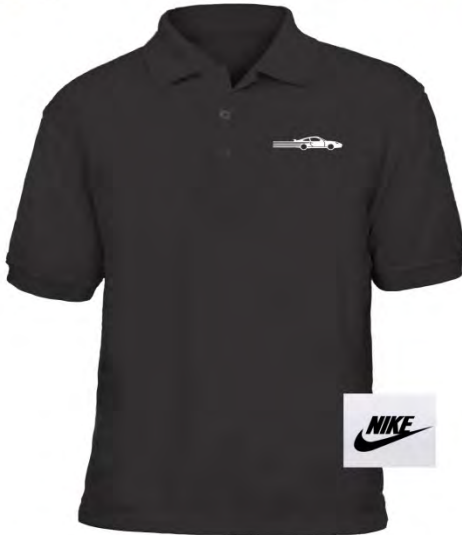
4 SIZES: S-3XL