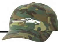
6/7 CAPS $25 EACH