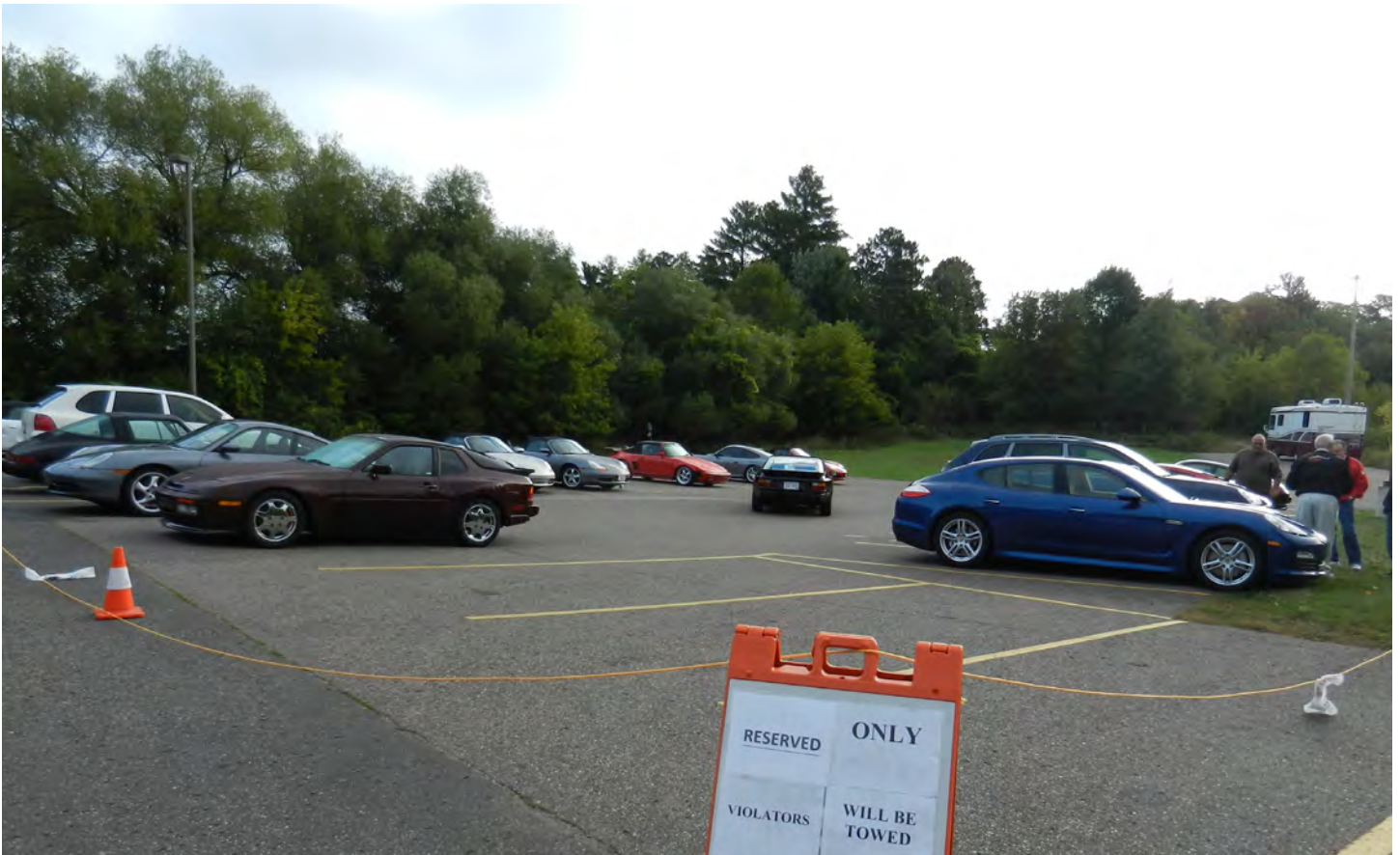
No violators dared defy the order!!!