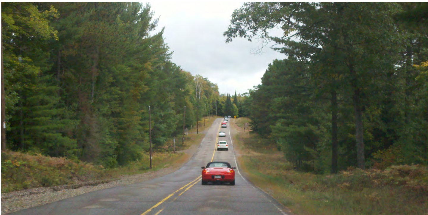
Saturday tour in "The Northwoods"