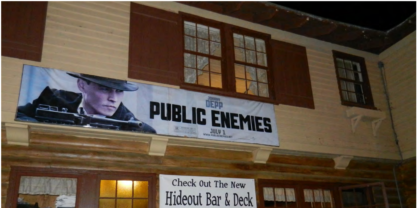
Friday night dinner was at Little Bohemia, location of the 1934 FBI raid on John Dillenger's gang.