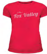
2 FITTED RHINESTONE TEE RED • S-XL • $30