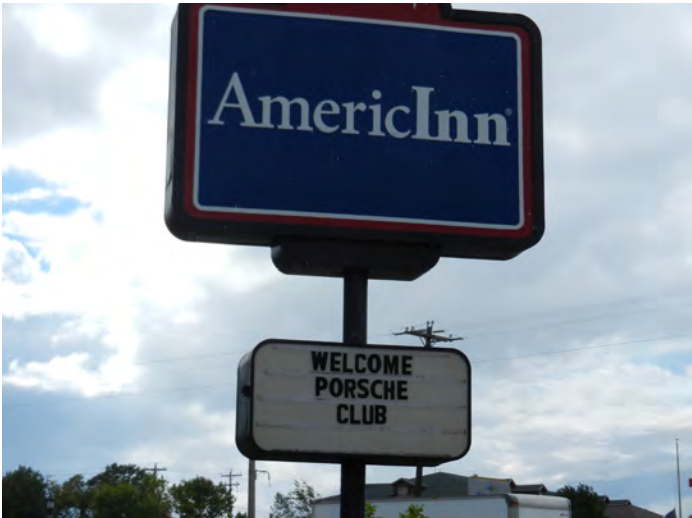
Minoqua's AmericInn was home for the weekend

Images from the 2013 Fall Tour in the Minoqua area