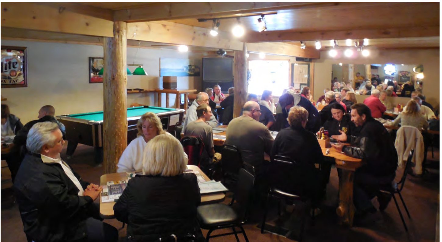
FVR members enjoying conversation with lunch at JJ's Pub & Grub in Boulder Junction