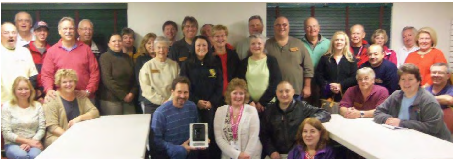
Ok, and here we even include the people with less common names, all 2013 Fall Tour participants