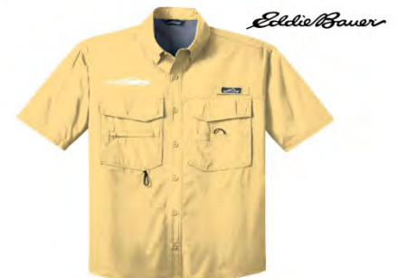
8 SIZES: S-3XL