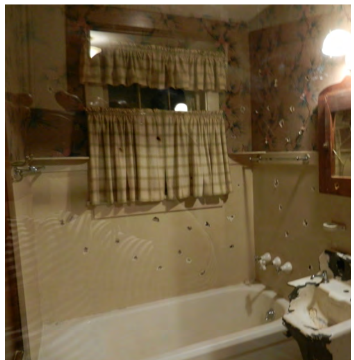
Upstairs remains as it was after the shootout.