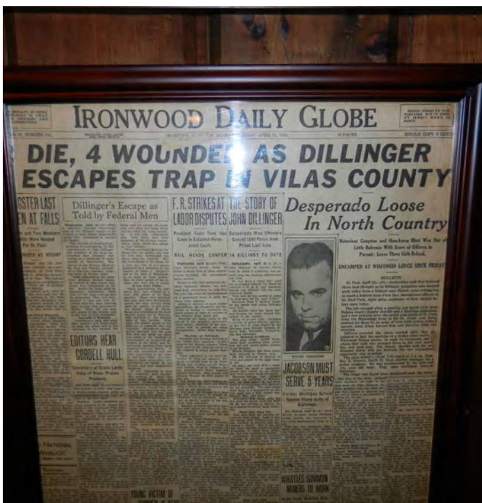
Newspapers of the day in Little Bohemia's museum.