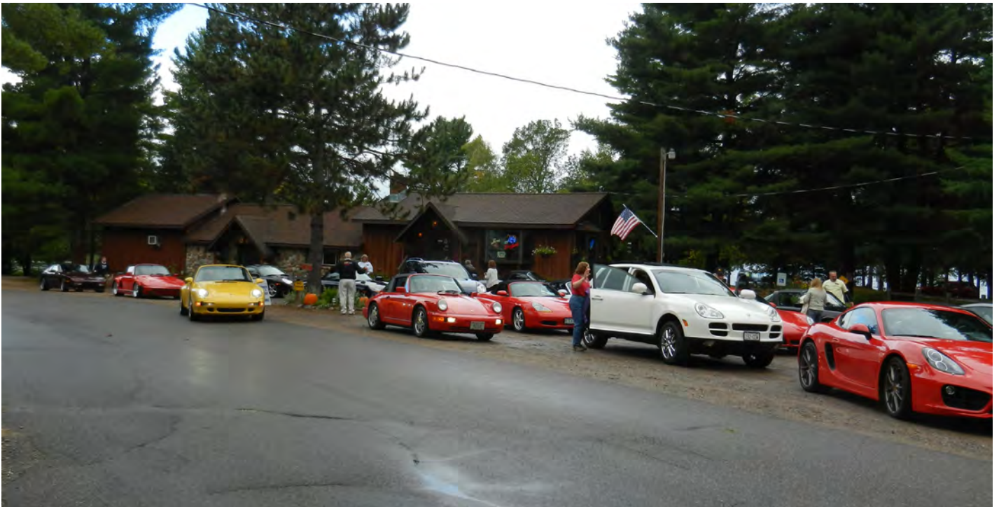
Another brief stop at Bauer's Dam Resort on Buckatbon Road