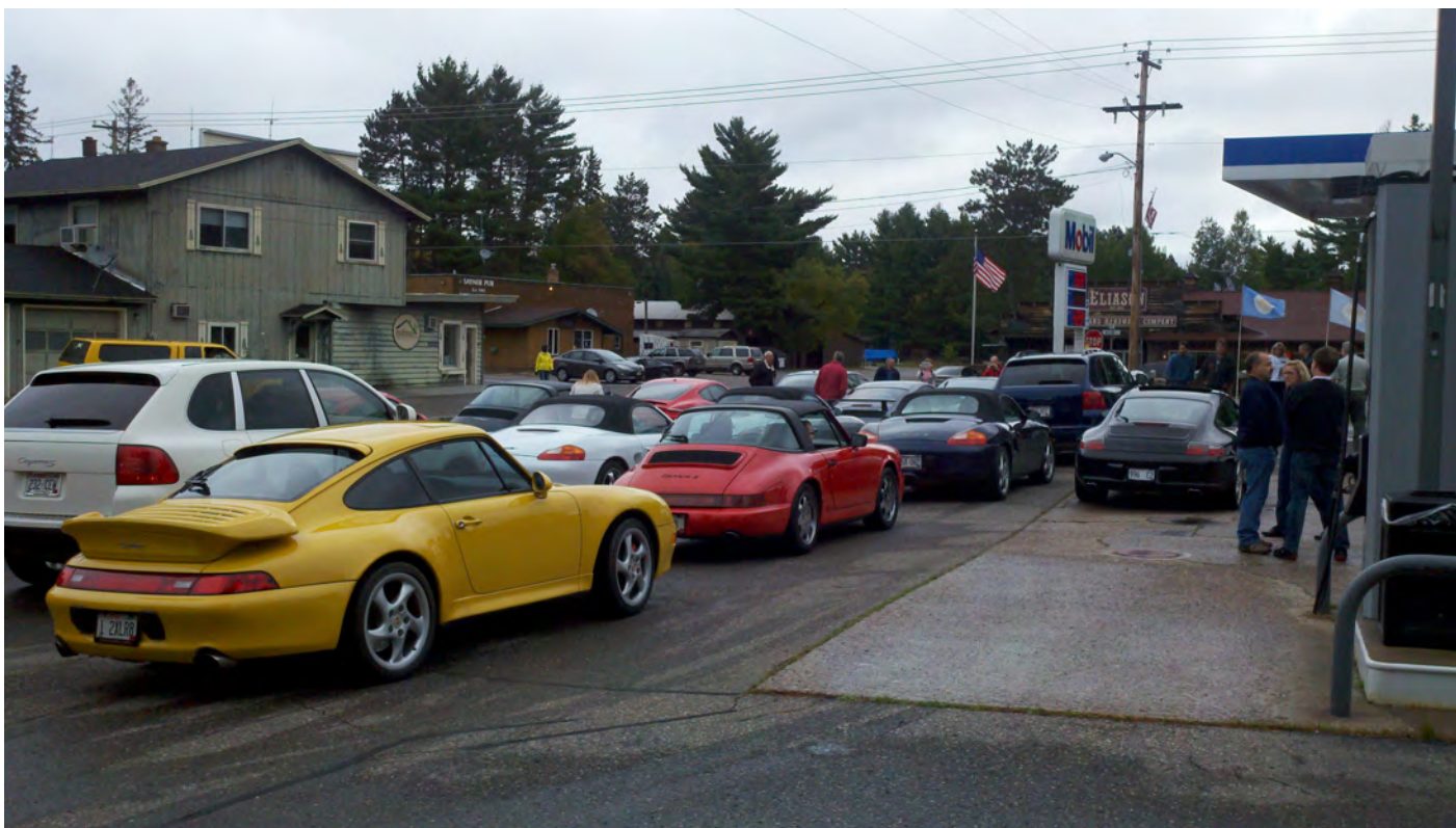
A brief pit stop at Sayner