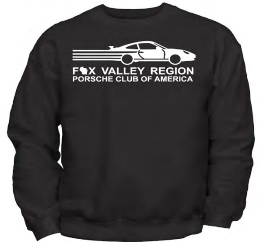
3 SIZES: S-3XL