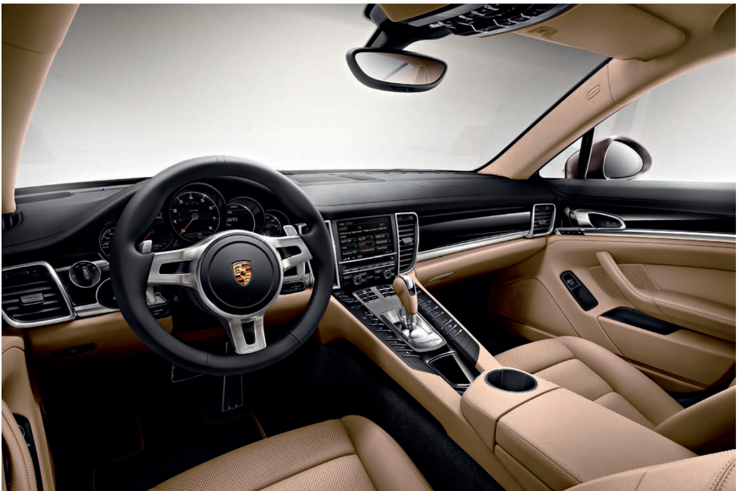
Panamera Platinum Edition

In addition, Power Steering Plus as well as front seat heating come as standard. The standard Porsche Communication Management (PCM) with navigation module keeps Platinum Edition drivers on track. With a high-resolution 7-inch TFT touchscreen and eleven loudspeakers with a combined output of 235 watts, the Porsche Communication Management with built-in navigation unit not only gives assistance with dynamic route guidance, but also ensures optimal audio sound in the vehicle.