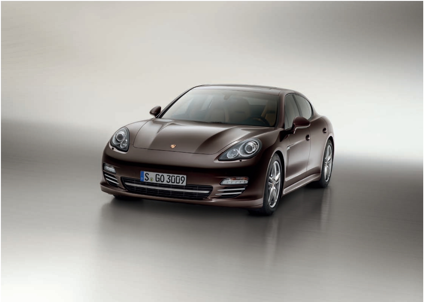
Panamera Platinum Edition

The lower half of the side view mirrors, the air-inlet grille lamellas, the air vent grille on the side designed specifically for the turbo model, the trim on the trunk lid and the rear diffuser are all in platinum silver metallic. The interplay with one of the Edition's five exterior finish colours results in an especially harmonious and elegant appearance. Solid exterior colours are offered in black or white as well as the options of metallic basalt black, metallic carbon grey and metallic mahogany lacquer finishes. The black glossy finish used for the side window strips creates a convincing overall exterior appearance.