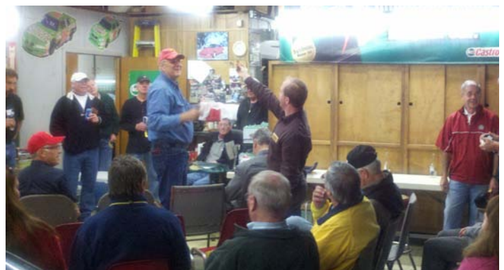
Tech Session attendees search for the winning number