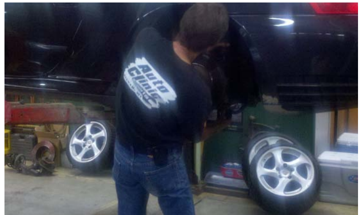
Reassembly of the suspension components