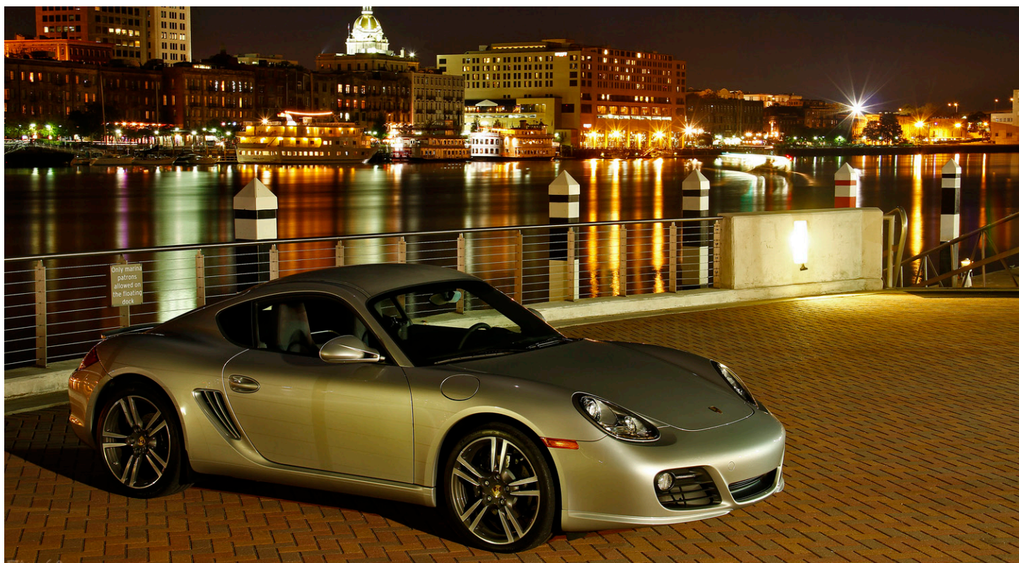
Savannah Riverfront

Won't you join us for a spectacular Parade, the highlight of our PCA experience this year? Anyone that has attended a Parade can tell you this is not just a normal multi-event weekend, this is the highlight of what PCA has to offer, full of exciting things to do and see with literally thousands of Porsche owners in attendance. Everything has been planned out and is ready for you; all you need to do is bring yourself, your family and your Porsche for a vacation experience that you won't soon forget! Check http://parade2011.pca.org for more information and be ready to register on March 8th...see you there!