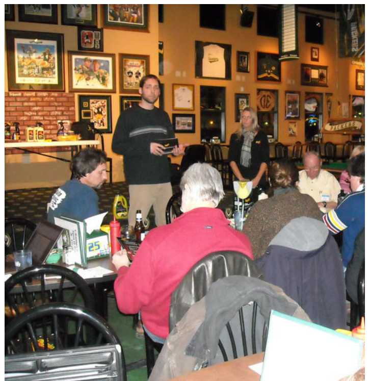
New members recognized