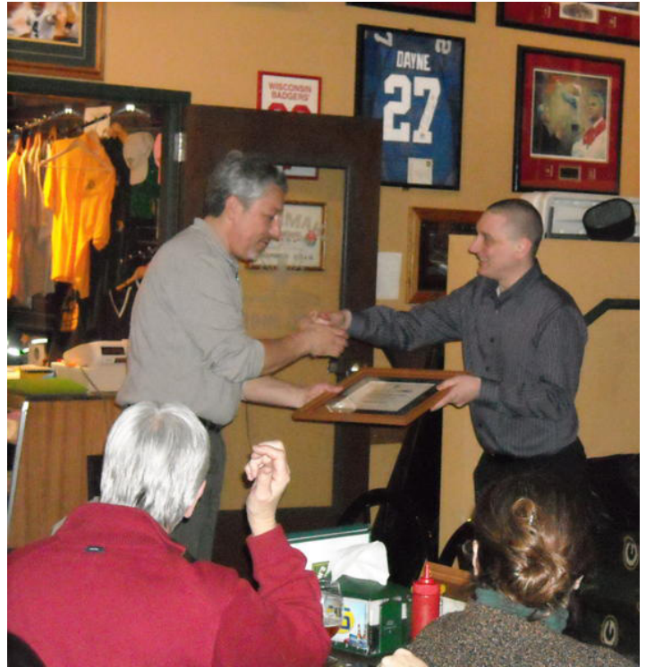
Presentation of certificate of appreciation