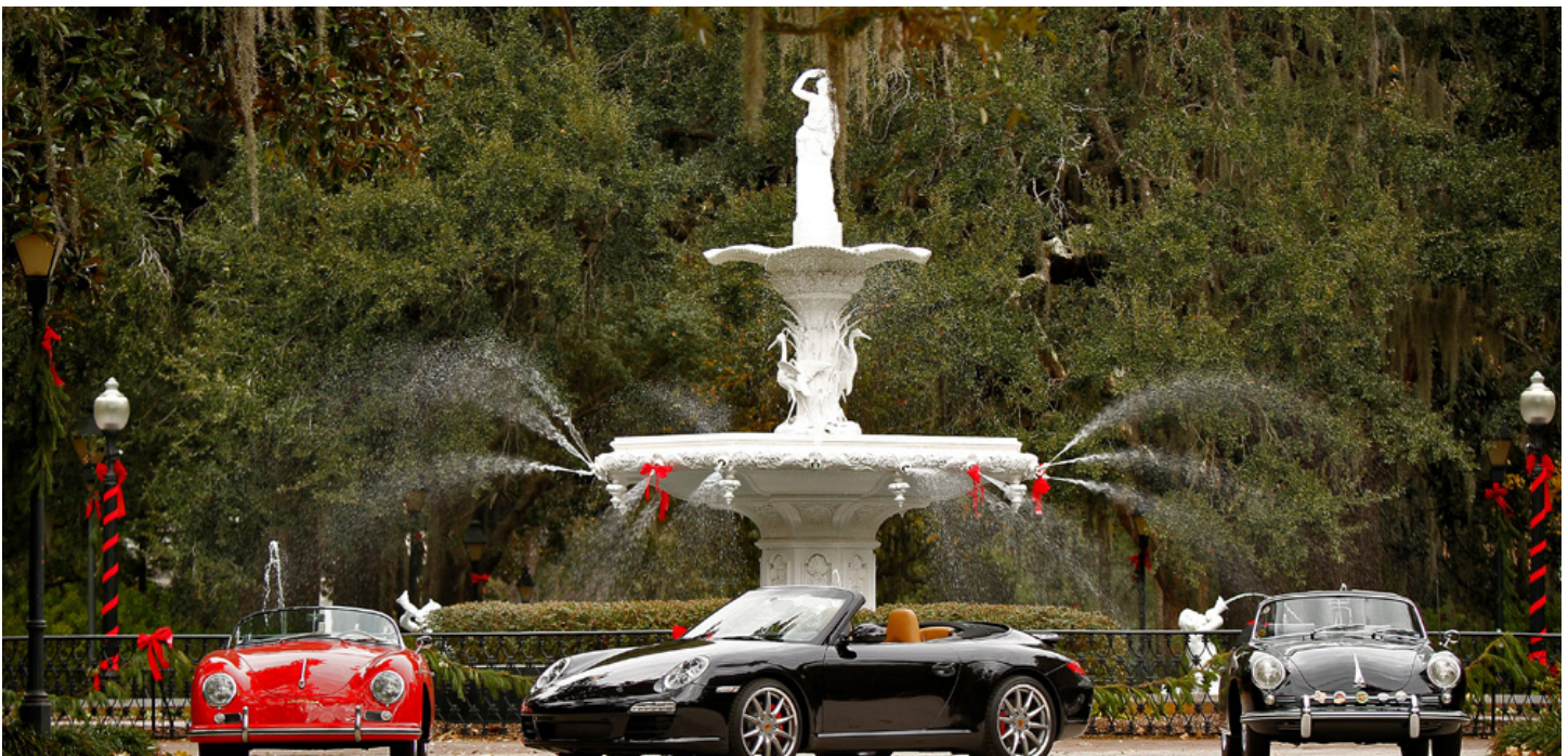
Savannah Forsyth Park

Location, location, location is the focus of Parade 2011. Parade headquarters is the Convention Center which is located on picturesque Hutchinson Island. The view of downtown Savannah across the river is unforgettable. The Convention Center is surrounded by Parade activity sites. The autocross will be held adjacent to headquarters, as for the first time in recent memory sufficient asphalt exists for a good size course within walking distance! But if you still need to get your track fix the local region will hold a Driver's Education event at nearby Roebling Road Raceway the last weekend of the Parade. With the Concours event held at downtown's Forsyth park and the Rally featuring lovely local roads, the main attractions of this year's Parade are all in the same neighborhood!