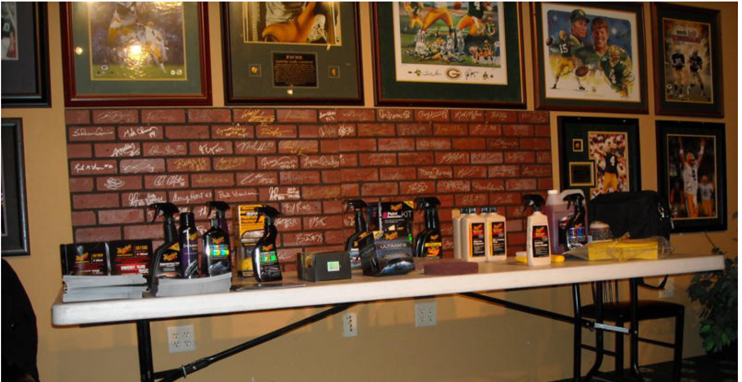
Door prizes for this special event were in abundance thanks to contributions from Meguiar's, and Champions Sports Bar.