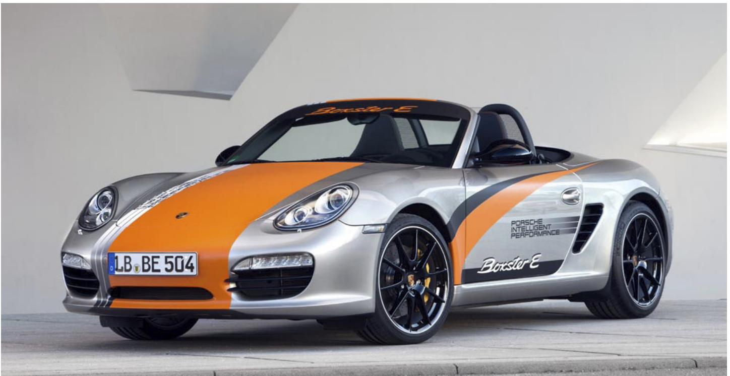
Porsche Boxster E electric vehicle

The Porsche Boxster, with its mid-engine concept is the ideal vehicle basis for the practice-oriented testing of the electric drive: The open two-seater is very light and allows the new components, electric motor, battery and high voltage technology, and crash safely to be accommodated in the vehicle. At the same time, the performance level of a Boxster S is maintained. The Boxster E is driven depending on the configuration, with up to two electric motors totaling 242 horsepower. An energy storage battery is used with a capacity of 29 kilowatt hours.