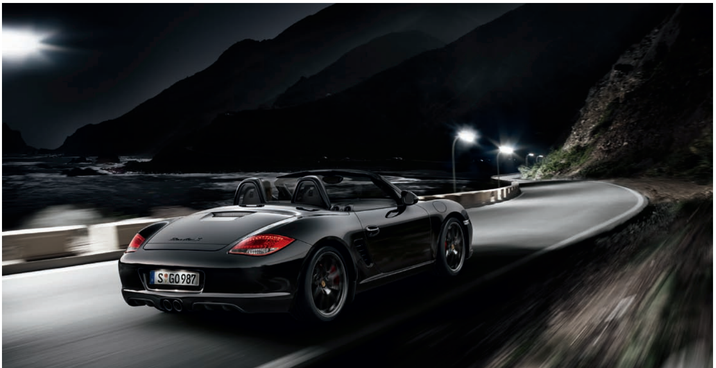
Boxster S Black Edition

As a standard, the Boxster S Black Edition features the otherwise optional "Comfort", "Infotainment", and "Design" equipment packages, and therefore comes at a more favourable price than a series model with comparable equipment options. The wind deflector is on board right from the factory as are the anti-dazzle interior and exterior mirrors with integrated rain sensor, cruise control and a climate control system. The Porsche Communication Management (PCM) including navigation module are also standard. In addition, the universal audio interface and