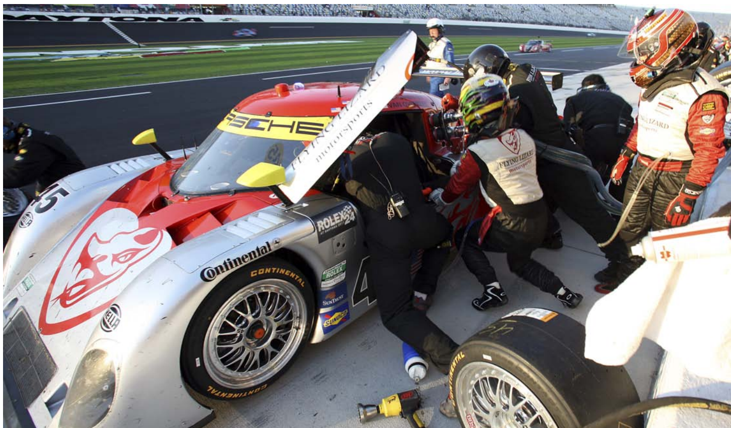
Flying Lizard Motorsports in for a pit stop at Daytona