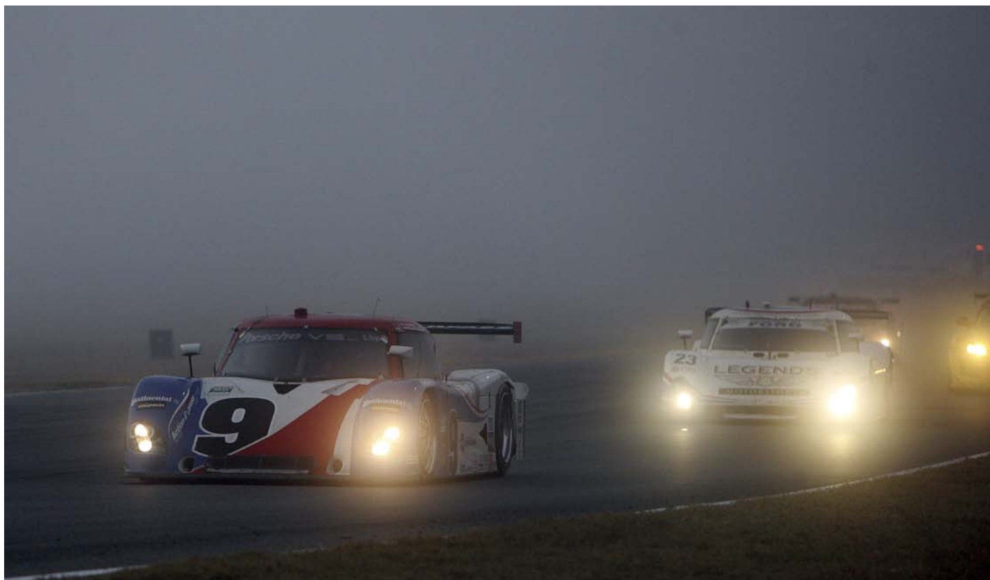
Action Express Racing # 9 Porsche Riley powers through the Daytona fog