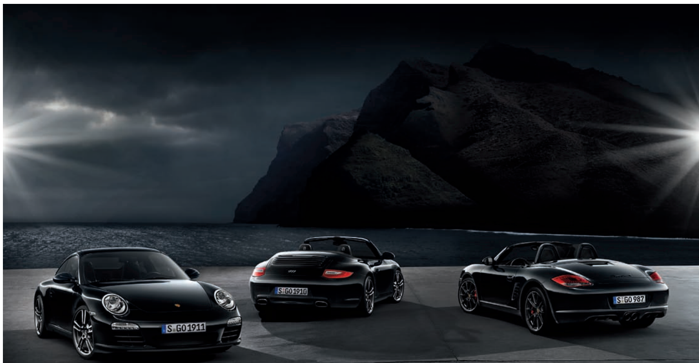
The 911 Black Edition Coupé and 911 Black Edition Cabriolet compliment the new Boxster S Black Edition

To raise dynamics and efficiency even further, the Boxster S Black Edition may alternatively also be fitted with the seven-speed Doppelkupplungsgetriebe (PDK). This will shorten acceleration times from zero to 100 km/h (62 mph) to 5.1 seconds, the top speed with PDK is 274 km/h (170.3 mph). In comparison with a manual transmission, an additional speed and an intelligent shifting strategy lower fuel consumption to 9.4 litres per 100 kilometres during the NEDC complete cycle.