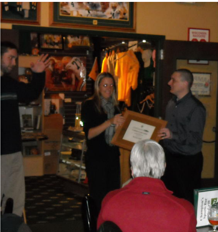
Presentation of certificate of appreciation