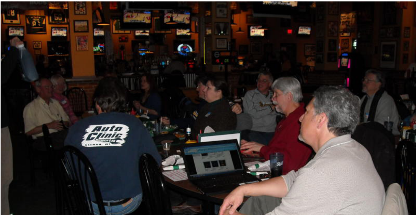
The casual, informative, and entertaining atmosphere of FVR meetings