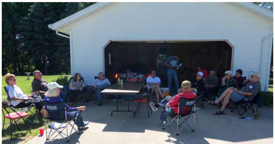
FVR Board meeting, June 8, 2014