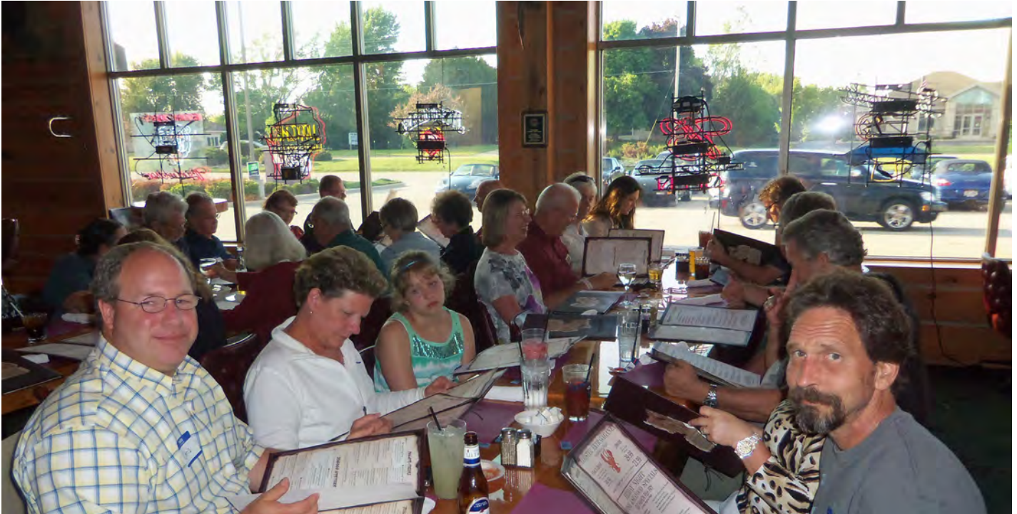
More than 30 members attended the car show/dinner/social at Kodiak Jack's