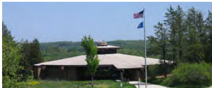
Ice Age Visitor Center in the Kettle Moraine State Forest