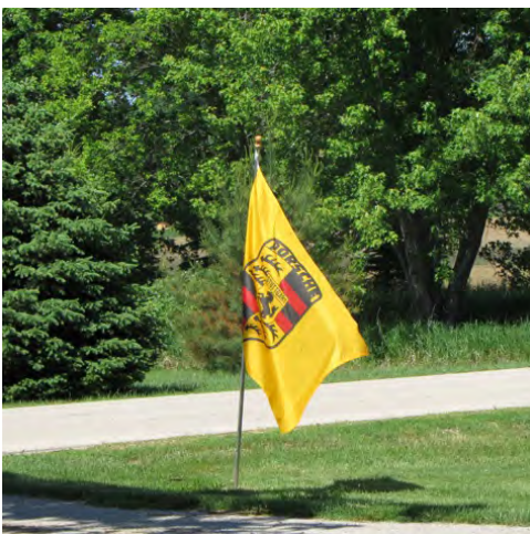
The PCA flag guided attendees