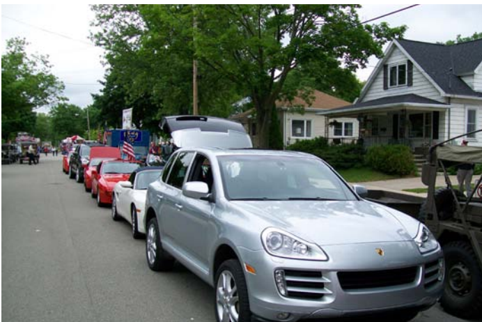
Lining up for the Flag Day Parade