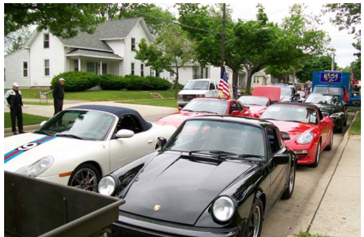
Staging area for Flag Day parade