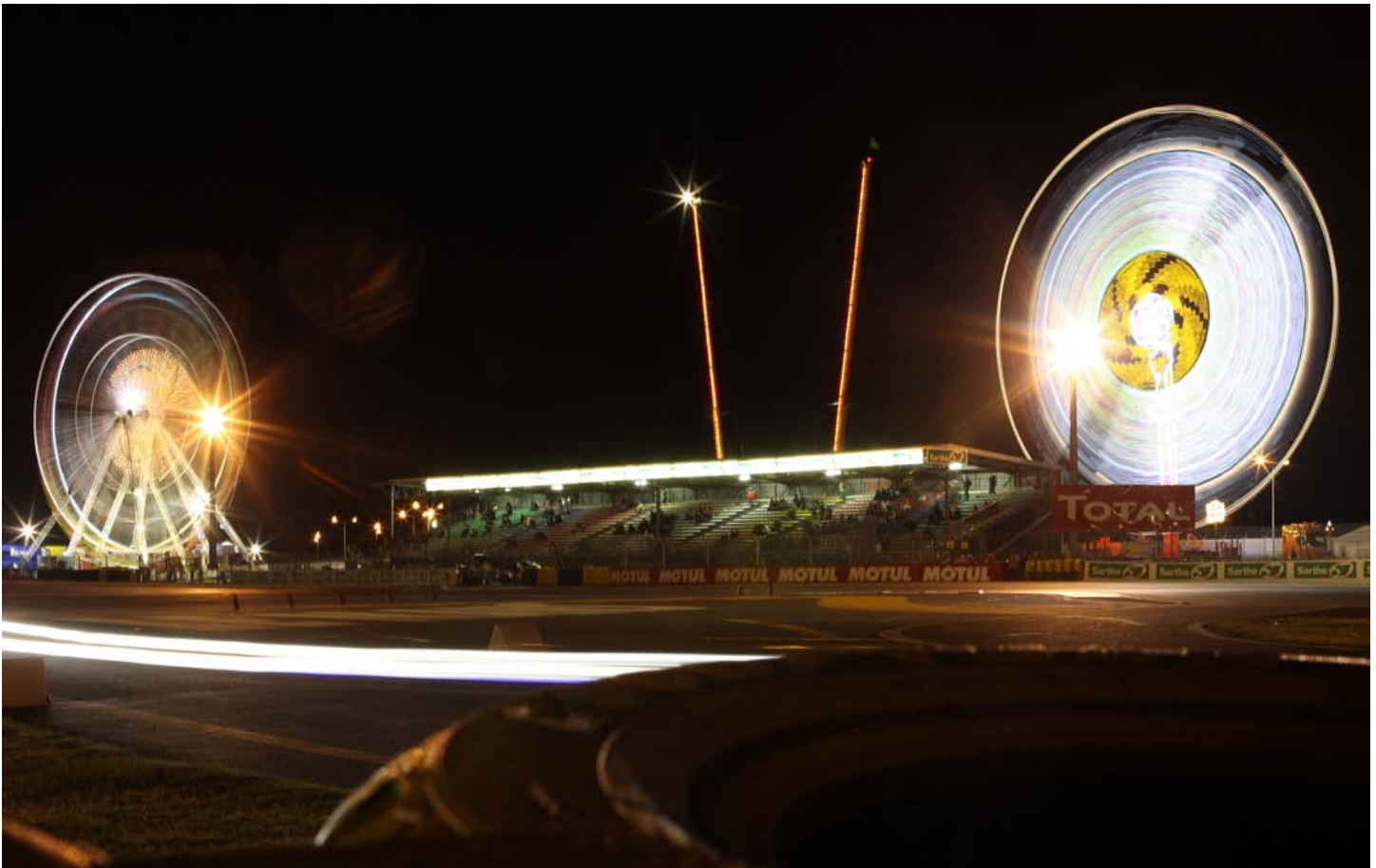
24 Hours of Le Mans