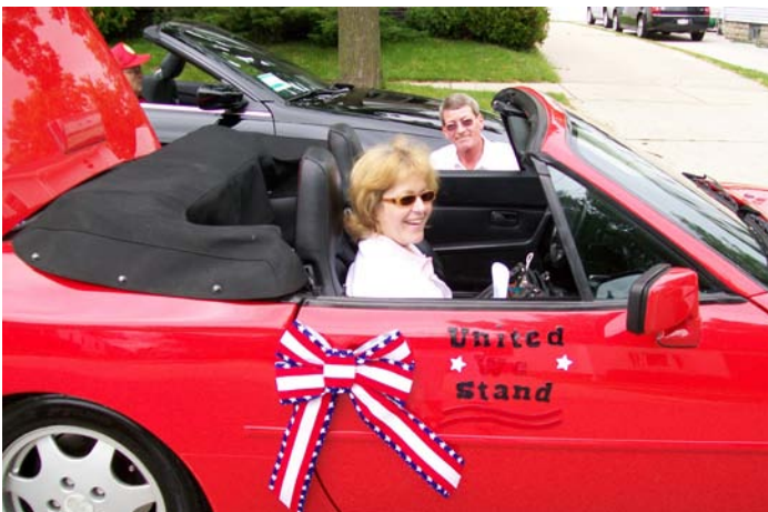
The Reich's show their patriotic spirit