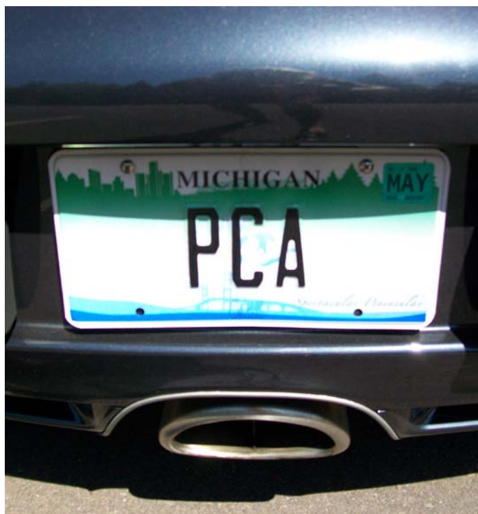
Al Curran's license plate