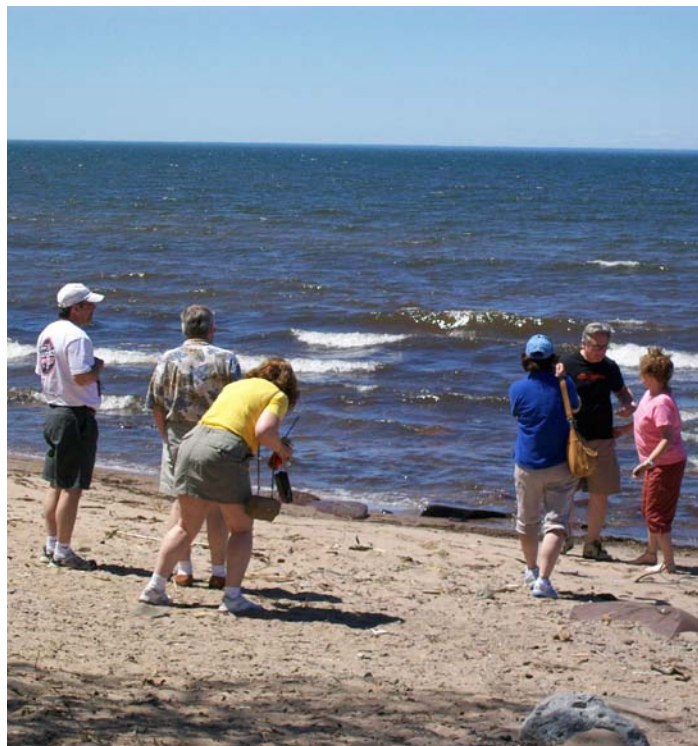
Having fun on the beach of Lake Superior