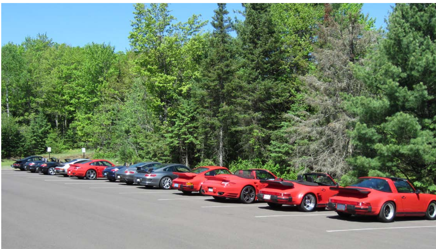
Bond Falls parking lot - all 13 cars (all 911-type or Boxsters!)

Saturday's weather was absolutely picture perfect; clear, azure blue sunny skies and warm temperatures with a slight breeze. As per usual FVR tour behavior, several