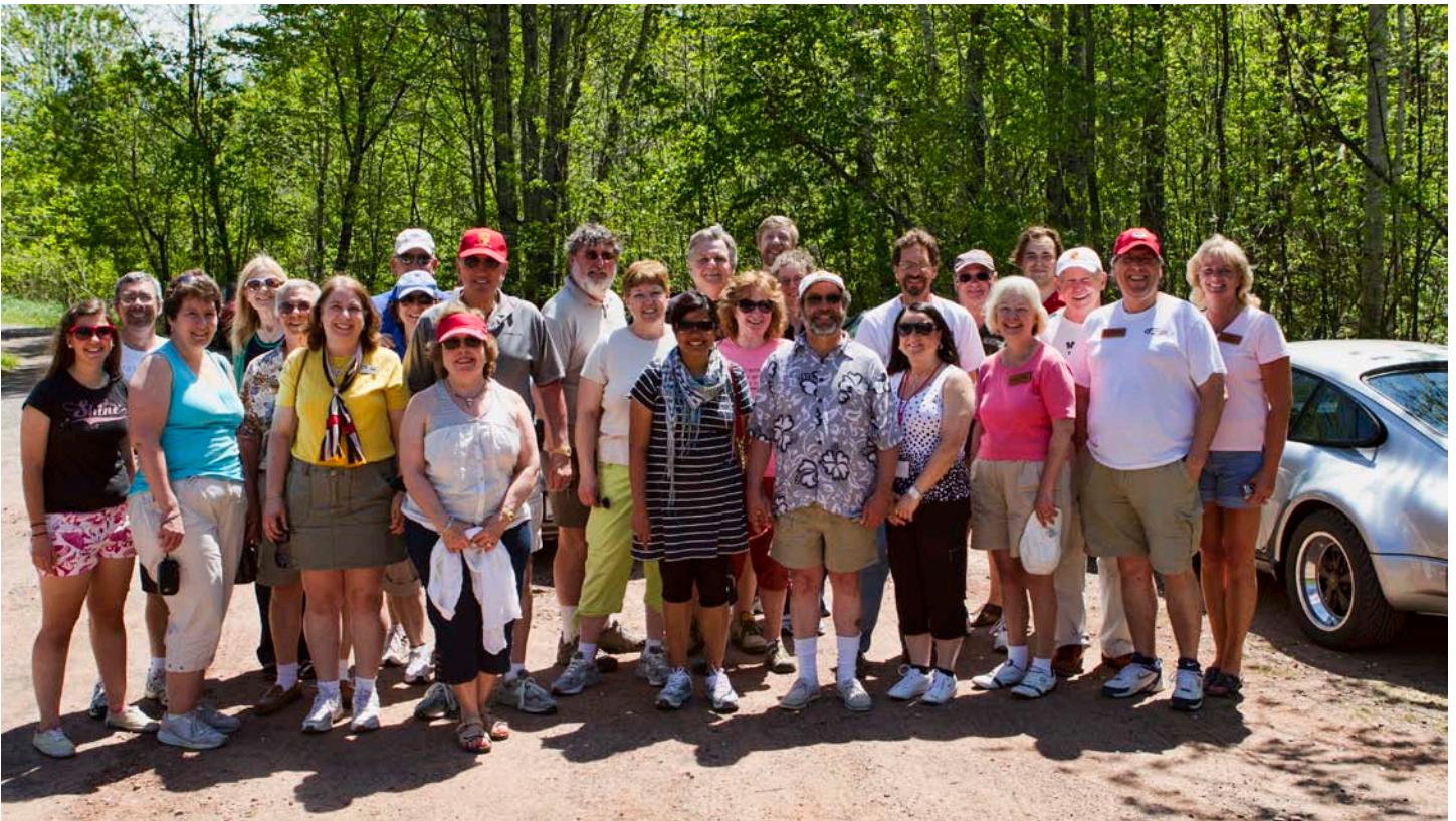
FVR 2011 Waterfalls Tour Group Photo