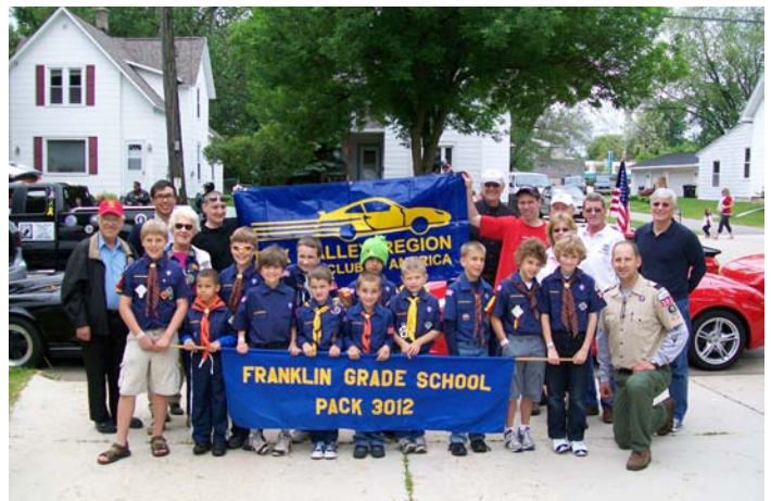
Boys Scouts and FVR for Flag Day parade