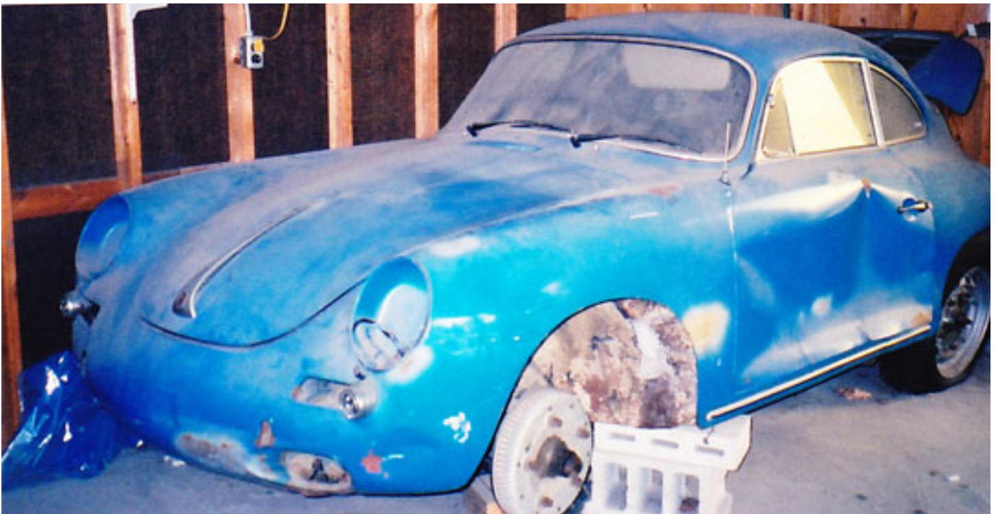
Gordon's natural instinct for Porsche led him to find this 356