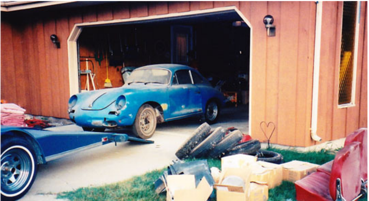
A restoration project gets a new lease on life