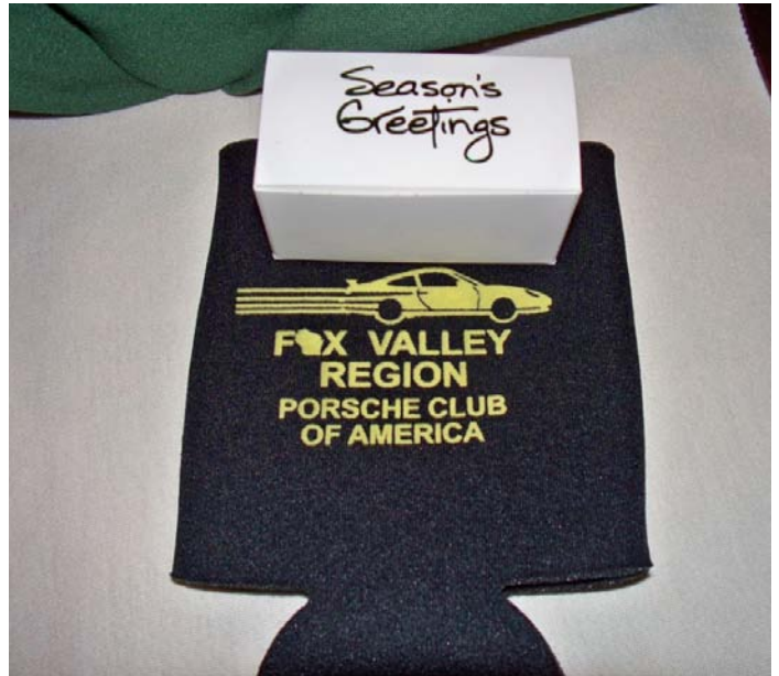
Goodies for the guests were some of details accomplished by FVR volunteers