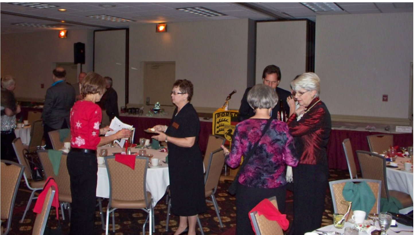
The silent auction and “find someone who” game kept everyone talking and moving