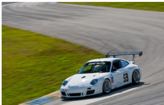
Hurley Haywood recently tested the No. 59 Brumos Porsche GT3 at Homestead-Miami Speedway

The next Rolex Series activity will be the Roar Before the Rolex 24 testing at Daytona International Speedway on Jan. 7-9.