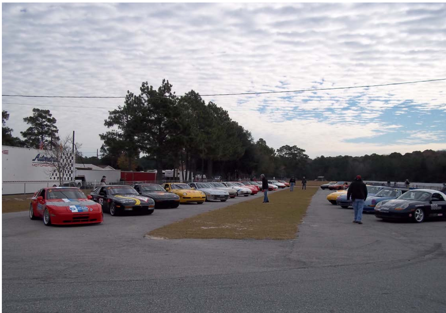
Florida Citrus and Florida Crown Regions at Roebing Road

The first weekend in December the Florida Citrus region and the Florida Crown region host a Porsche club race and DE weekend. Enjoy the pictures from this year's race.