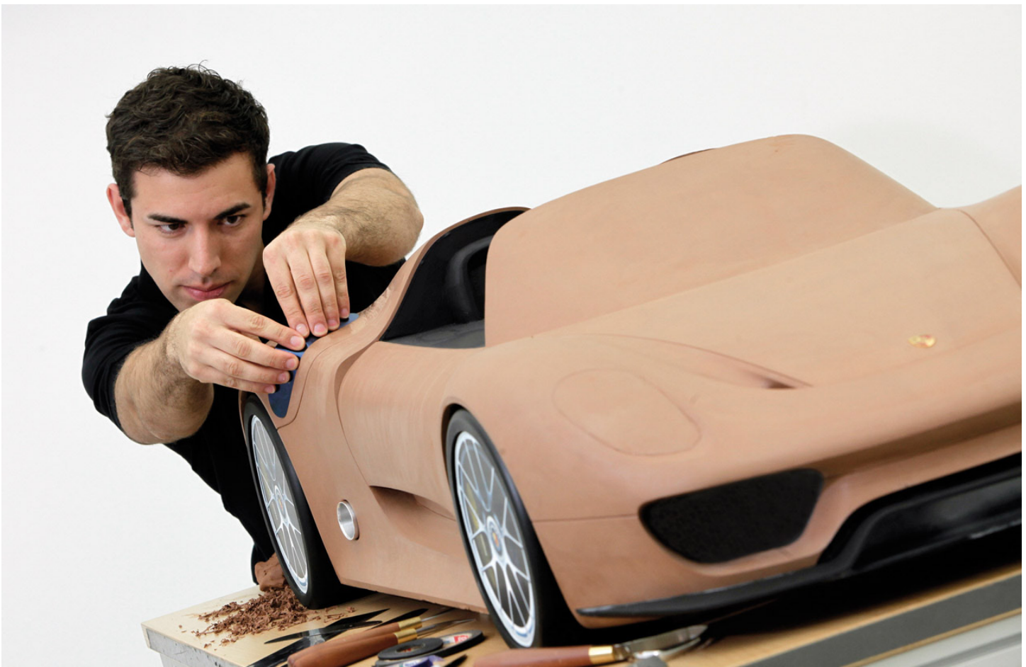
Porsche 918 Spyder clay model - or is it something else under development?

Regardless of what it is, stay tuned for full coverage beginning January 10th