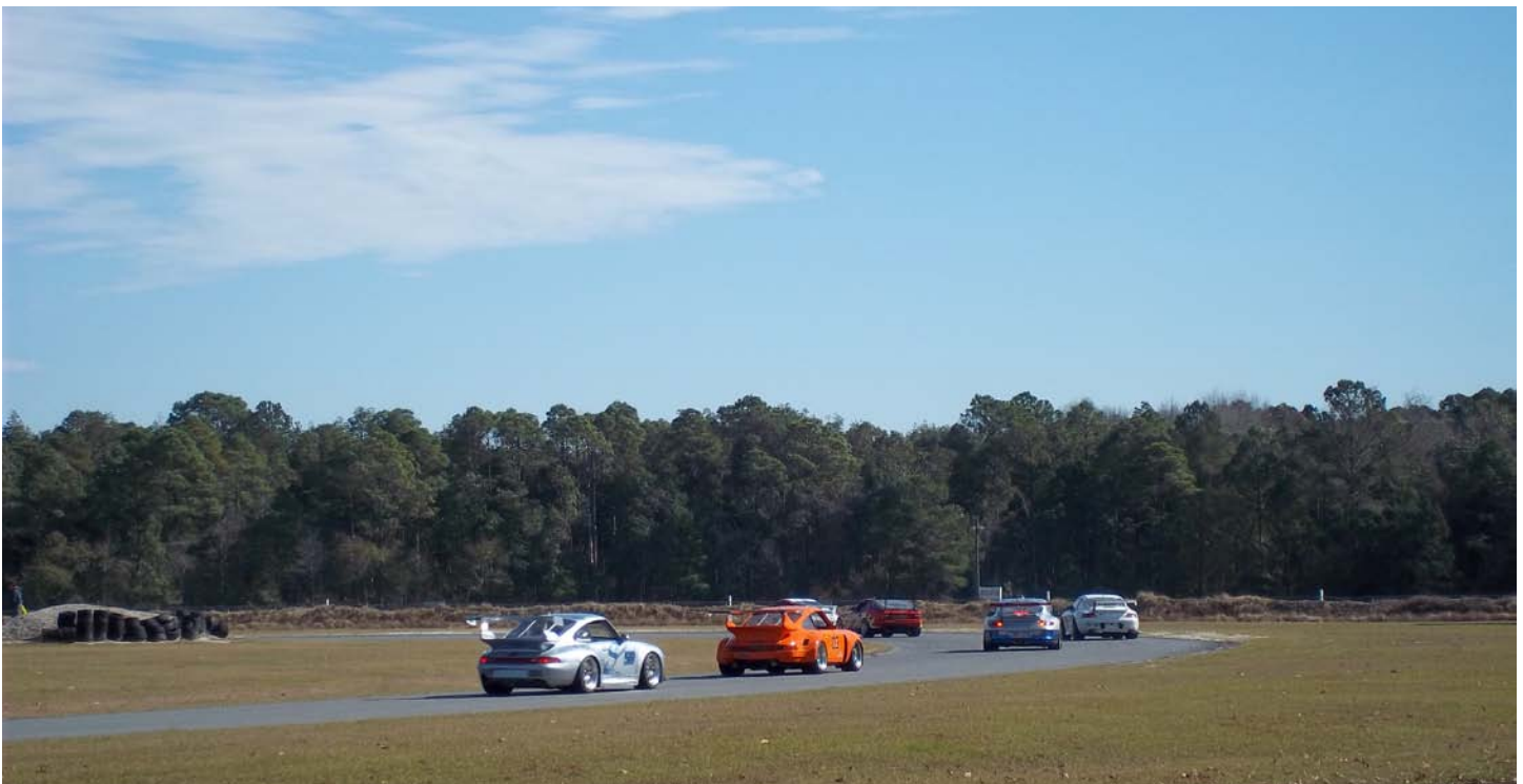
Track time under blue skies in Georgia