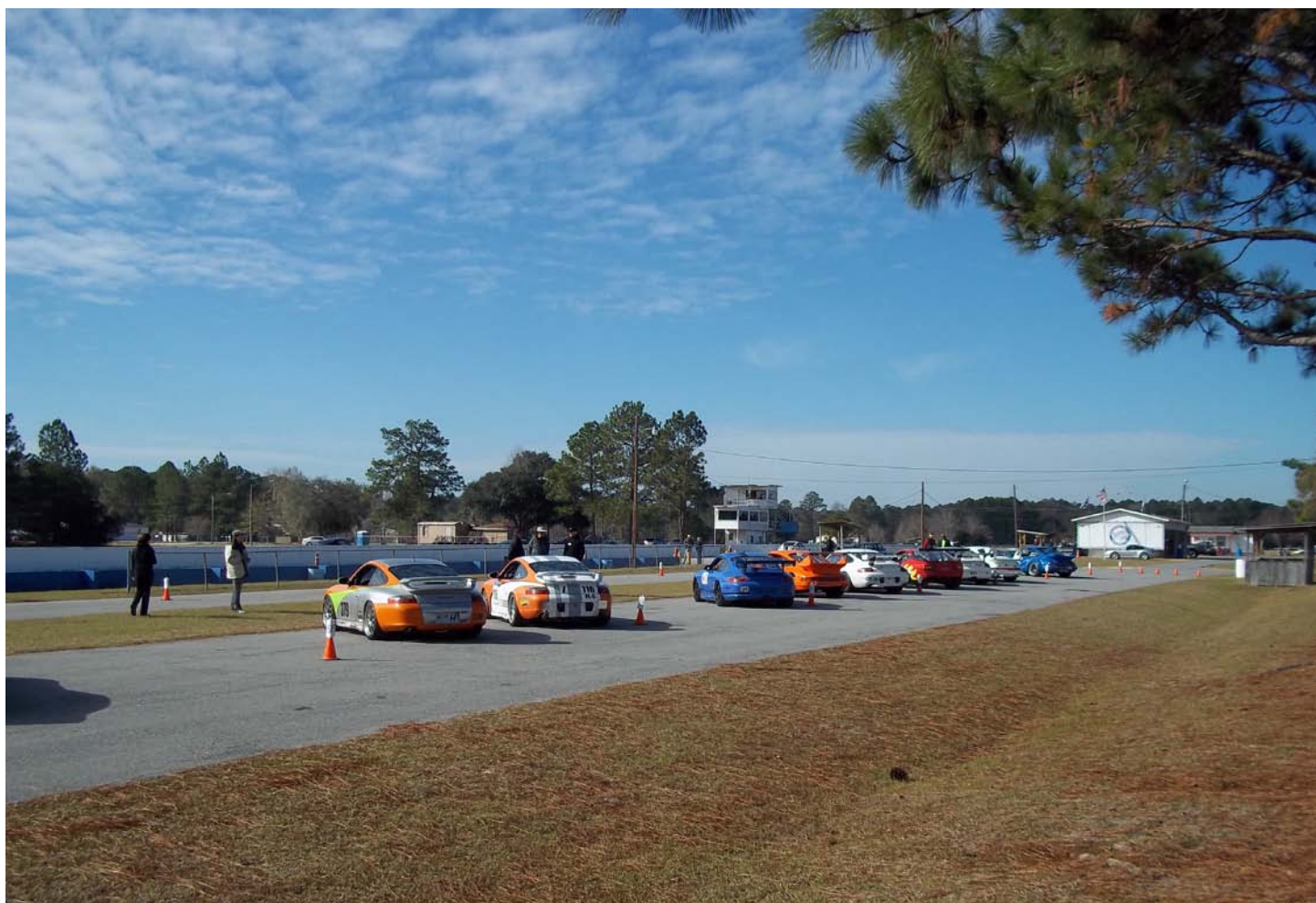
Roebling Road Club Races

YouTube video from 2009 club races: http://www.youtube.com/watch?v=CtbK5xgL5lk