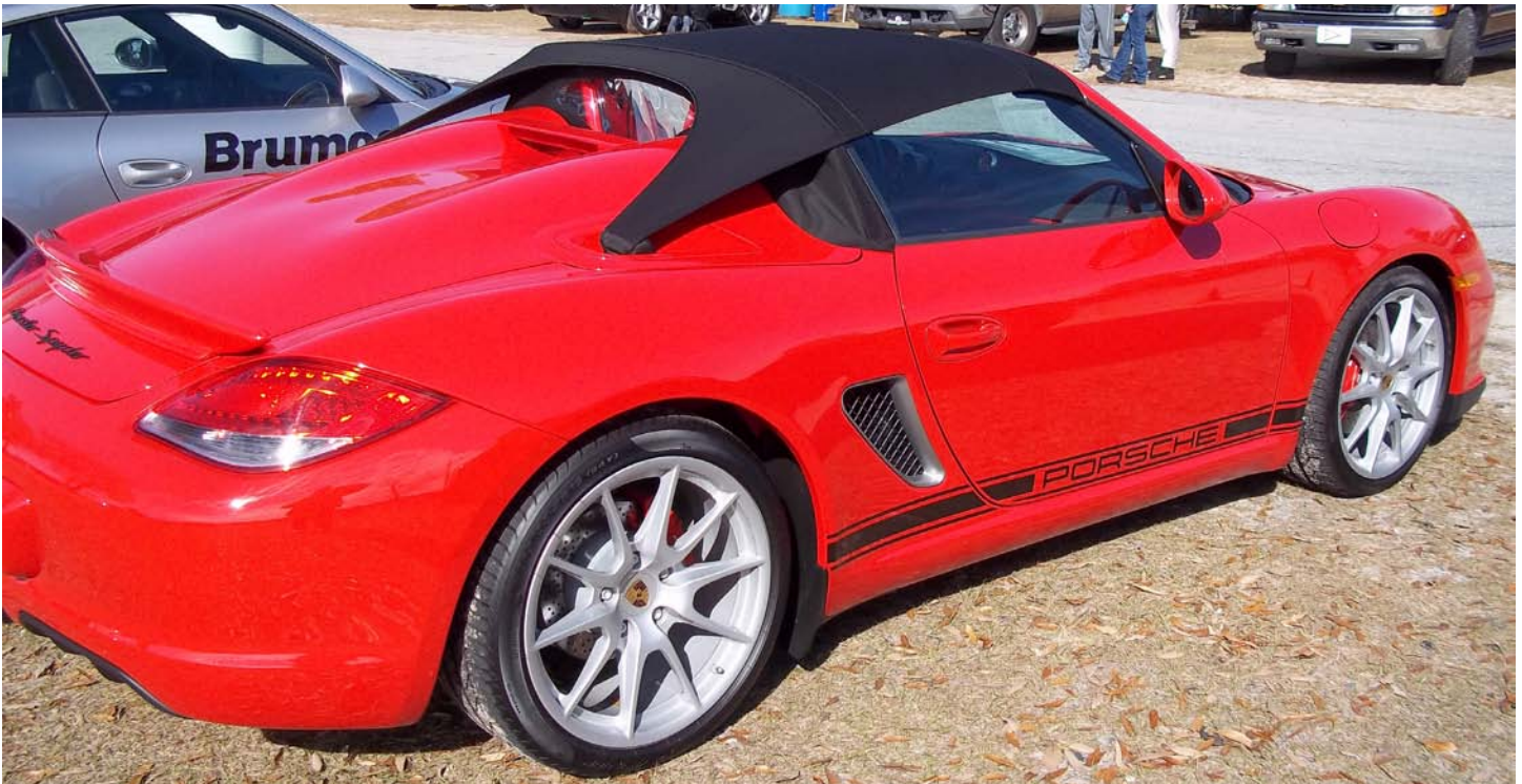
Guards Red Boxster Spyder - now that is a beautiful Porsche!