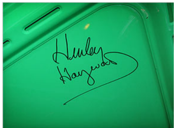
Hurley Haywood's signature - how cool is that?