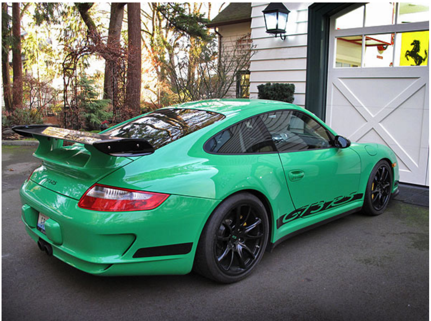
2007 GT3 RS (Griot's Garage Handbook 283 cover car)

The 911 GT3 RS was introduced by Porsche in 2003. The RS (Rennsport, or "Motorsport") is lighter than the standard GT3, owing to a polycarbonate rear window and a carbon fiber hood and wing. The horizontally-opposed 6 cylinder, 3.6 liter engine features overhead cams with 4 valves per cylinder, varioCam valve timing, and titanium connecting