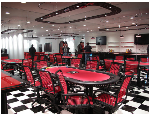
Poker table ready for action in the cave