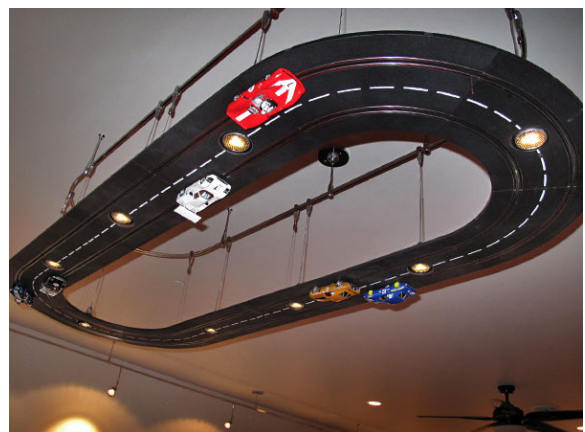
Track Lighting detail