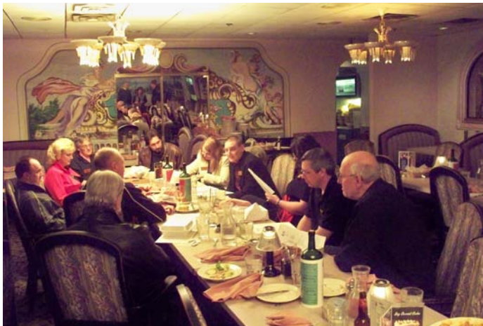
2010 FVR Board seated in Victoria's dining area

recognize the faces of your fellow FVR members and the people who make the FVR function as a club devoted to your interests.