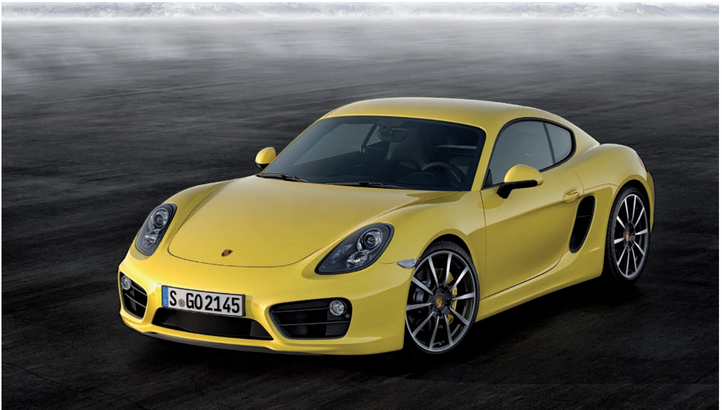
New Cayman S

The 3.4-liter engine of the Cayman S produces 325 hp (239 kW); the best possible acceleration from a standstill to 100 km/h is 4.7 seconds with appropriate features. The Cayman S can reach a top speed of 283 km/h, and its NEDC fuel consumption value lies between 8.0 l/100 km and 8.8 l/100 km, depending on the selected transmission.