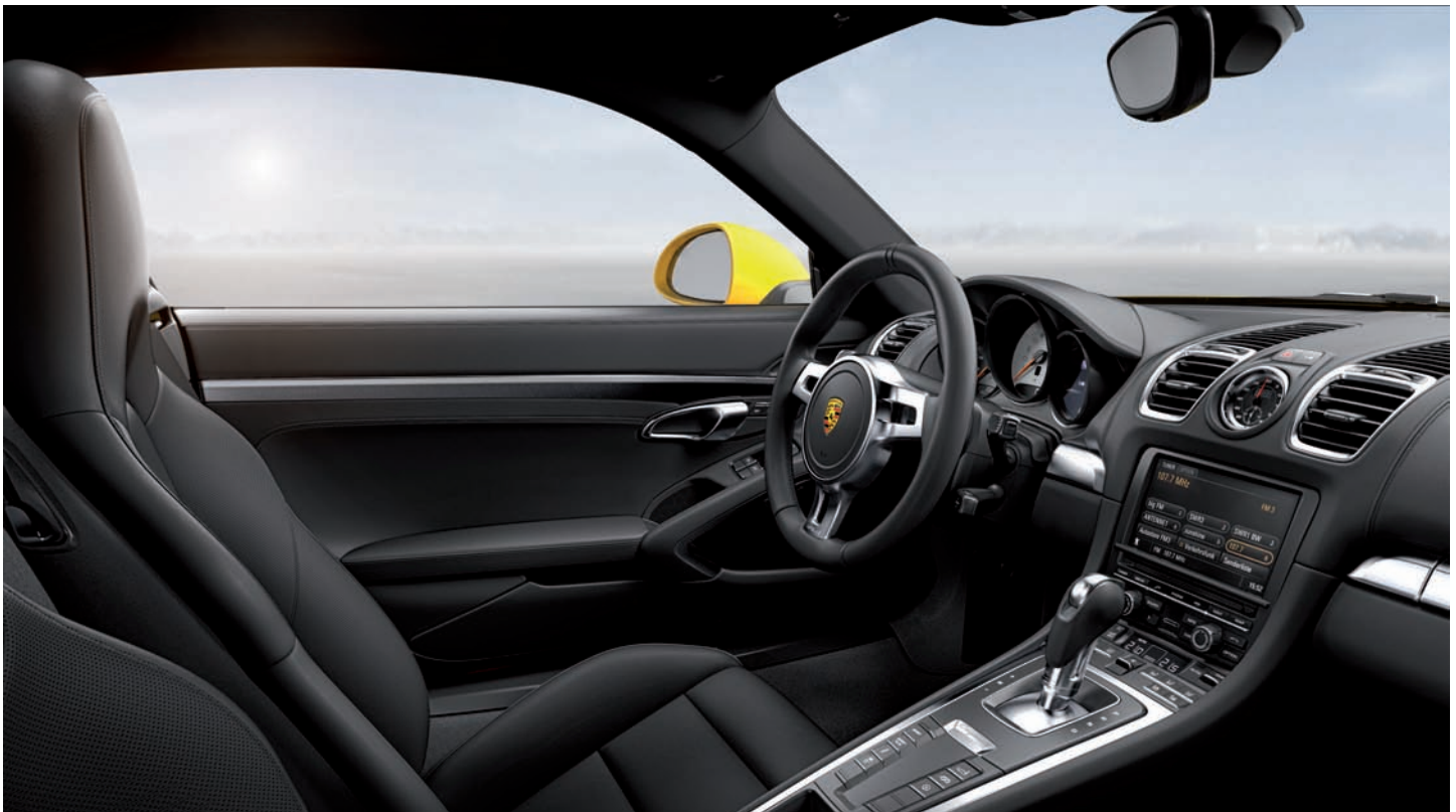
New Cayman S

The market launch of the new Cayman generation in Europe is scheduled for March 2, 2013