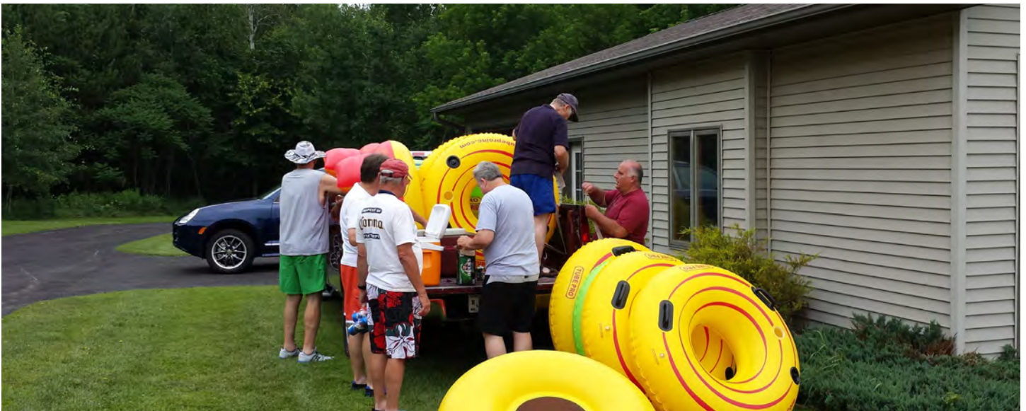
Loading the tubes for the short trek upstream before making some waves