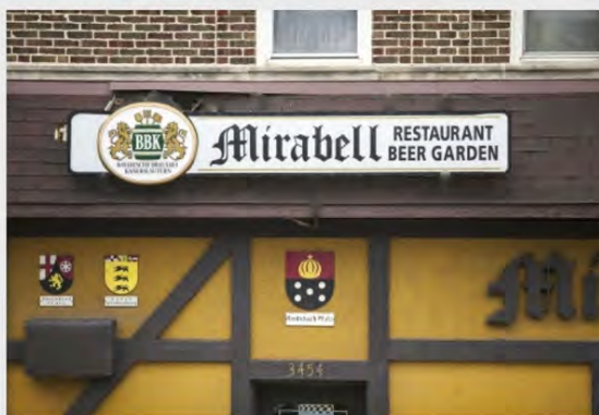
Mirabell is one of the best German restaurants in Chicago.

Chicago's rich German heritage is on display via bratwursts, German beer and more at the city's best spots for German food.