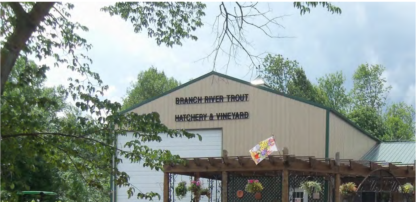
Trout Springs Winery, Greenleaf, Wisconsin