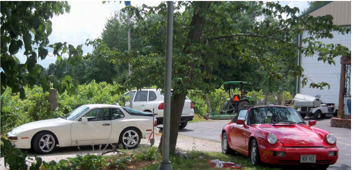
Porsches line the Trout Springs driveway and grounds