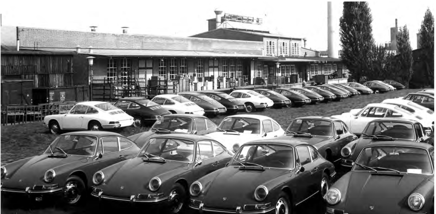
Porsche 911 in front of the Plant 2 at Zuffenhausen, 1965