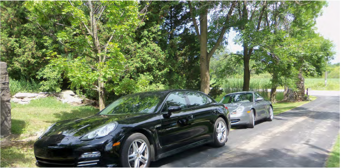
Stunning vehicles on a stunningly beautiful day