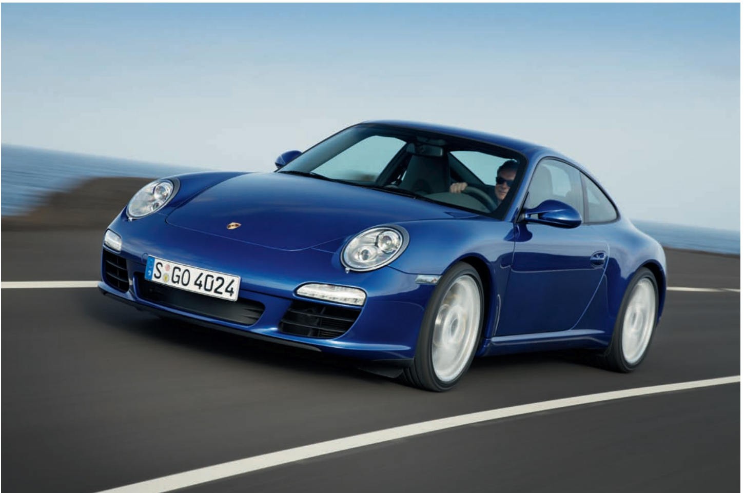
911 Carrera S Coupé