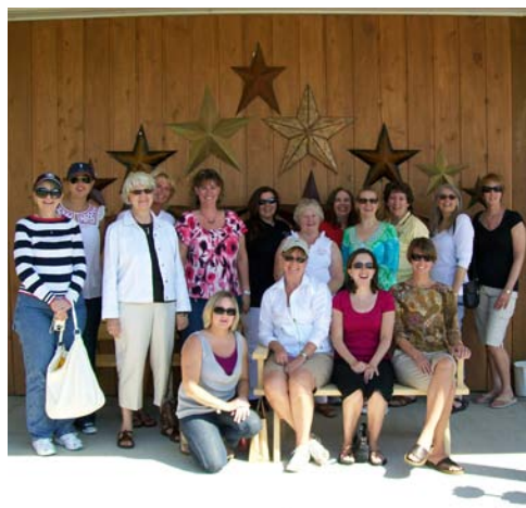
2009 Ladies Tour

RSVP's are needed by Friday, June 17 to jjstrublic@centurytel.net or lprellwitz@att.net