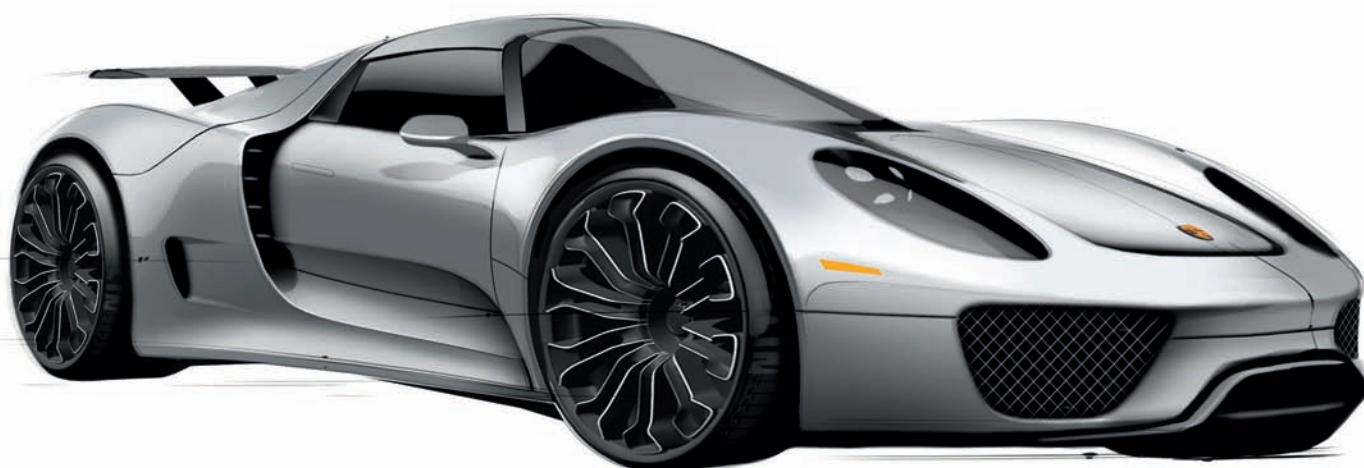
918 Spyder

The 918 Spyder is driven by a unique type of plug-in hybrid system. It comprises a high-revving V8 engine with a displacement exceeding four litres and output of more than 368 kW (500 hp). The mid-engine power unit is based on the racing engine of the successful Porsche RS Spyder, which provided impressive proof of its efficiency with its multiple victories in the Michelin Green X Challenge in the American Le Mans Series, the Le Mans Series and the 24 Hours of Le Mans. Power transmission to the rear wheels is by means of a compact, seven gear Porsche-Doppelkupplungsgetriebe (PDK). This is complemented by two electric motors - one each on the front and rear axle - with a joint mechanical output of at least 160 kW (218 hp). This configuration offers an innovative, variable all-wheel drive with independent control of