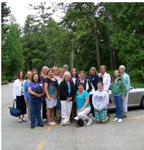
2010 Ladies Tour