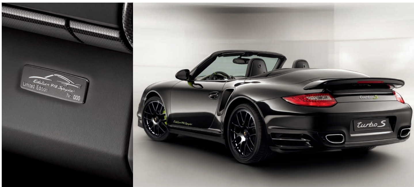
911 Turbo S "Edition 918 Spyder"

The 911 Turbo S "Edition 918 Spyder" is being offered to coincide with the commencement of sales of the 918 Spyder with deliveries starting in June 2011. The Coupé version of the special edition costs 173,241 Euro in Germany and 184,546 Euro as a Cabriolet - including VAT and country-specific equipment items respectively.