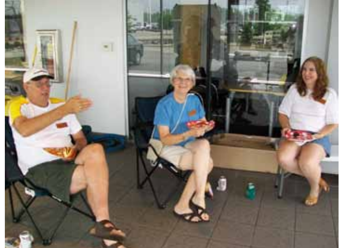
Conversation in the delivery bay during the picnic at Bergstrom Porsche.