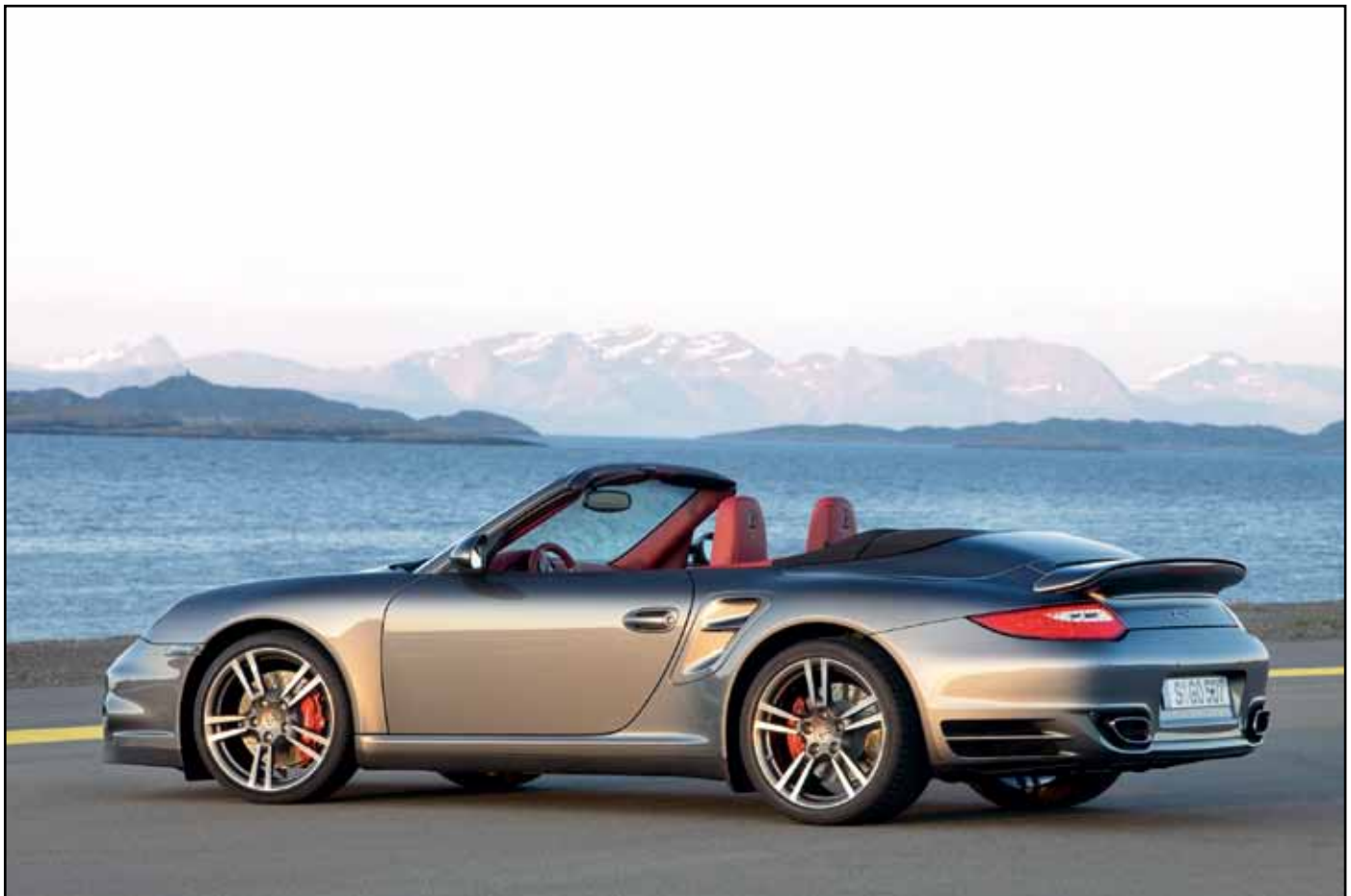
New 911 Turbo Cabriolet.

Models equipped with PDK are also available with a new, optional three-spoke steering wheel with gearshift paddles as an alternative to the standard steering wheel with its proven shift buttons. Fitted firmly on the steering wheel, the right paddle is for shifting up, the left paddle for shifting down.