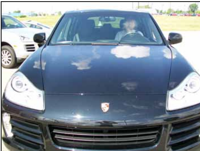
Jamie Prellwitz took time to test drive a 2009 Cayenne.