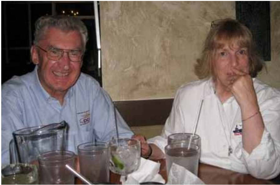
The two of us...in Charlotte, I believe, for the PCA Winter Meeting.