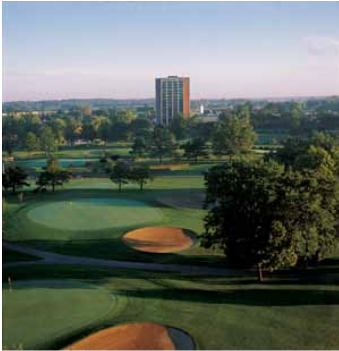
St. Charles, Illinois invites you to the 55th Porsche Parade in St. Charles at the Pheasant Run Resort