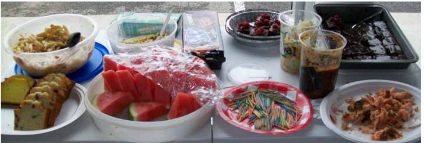
Great potluck food, as always!