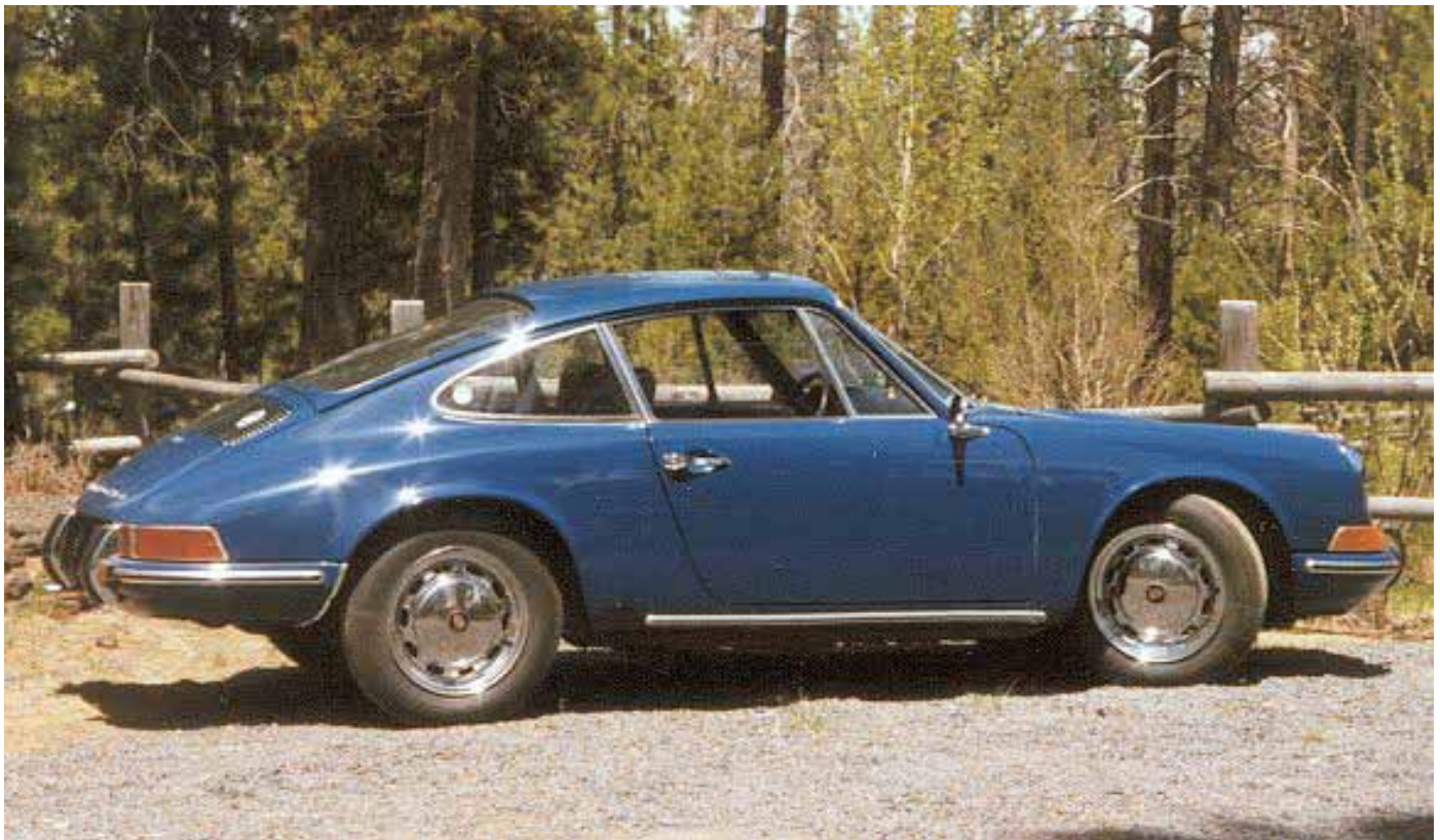
This photo is of our 912...the car that started the whole thing.

We joined the Porsche Club of America, Milwaukee Region, and that was the beginning of our long-term relationship with the club. It was, however, a relationship that ended for a few years when we moved to Boulder Junction to pursue a quieter way of life. The Porsche, named Folly, went with us but we soon realized that there were no Porsche events taking place in the Northwoods so dropped our membership. If we had not done this we would now have been members for forth years!