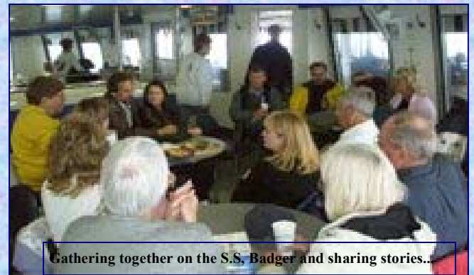
Gathering together on the S.S. Badger and sharing stories...