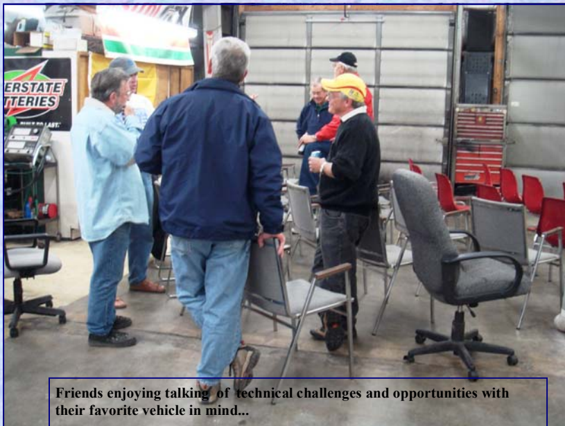
Friends enjoying talking of technical challenges and opportunities with their favorite vehicle in mind...