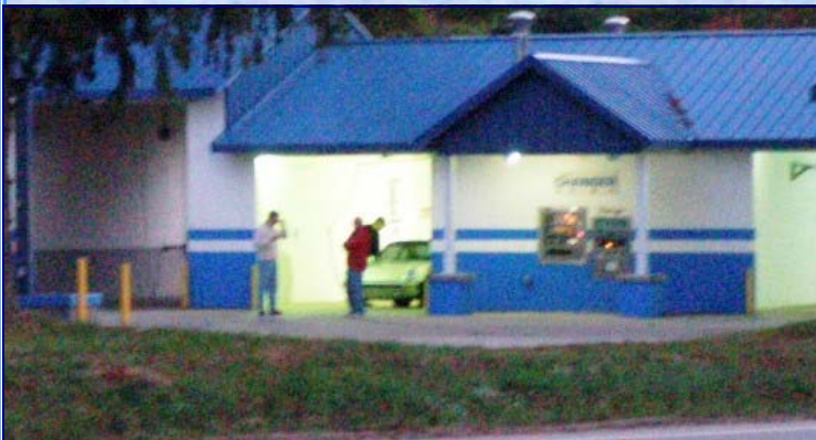
Early on Saturday morning, some drivers were getting their vehicle ready for the "PORSCHE TOUR CONCOURS".