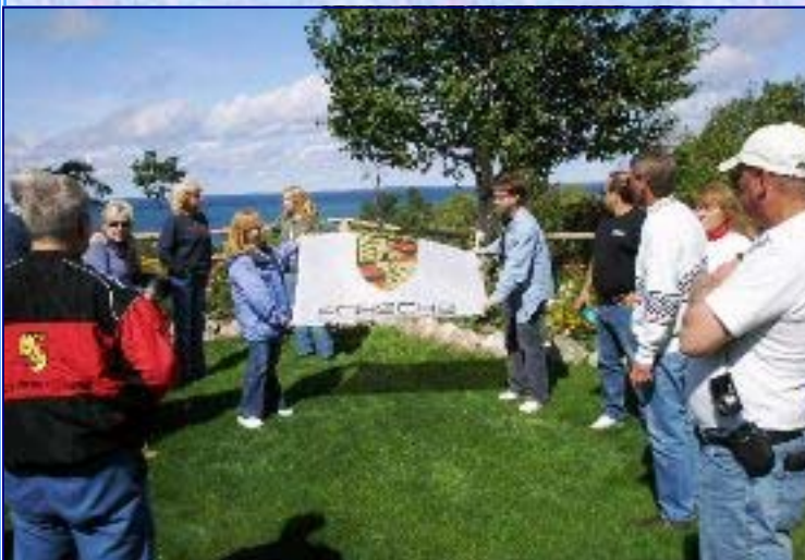
Showing our proud colors the LEGS INN restaurant... admiring majestic lake Michigan on a beautiful sunny day...