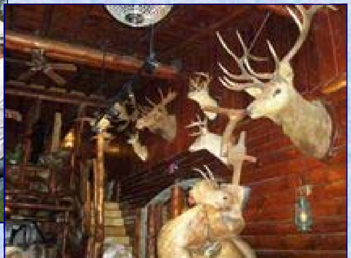
The wall at the Legs Inn ... a very interesting collection of trophies...