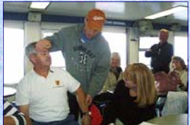
Receiving a pressure point massage to relieve back pain... with lots of envious folks standing around...