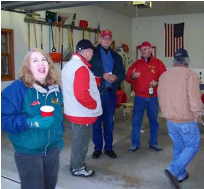
Hanging out in the garage.