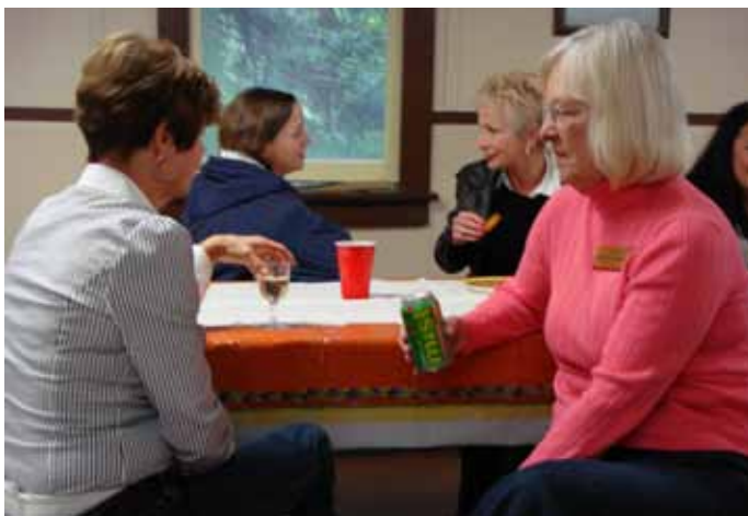
Ladies engaged in pre-dinner socializing.