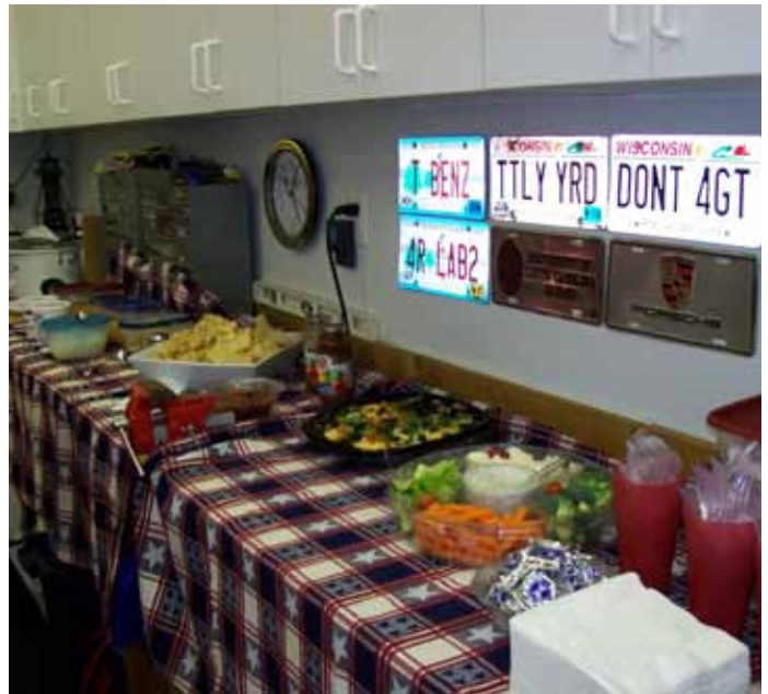
Lot's of yummy food!