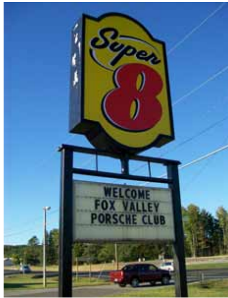
Super 8 welcome sign.

A short drive from there took us to our hotel where we were warmly greeted with a "Welcome Fox Valley Region Porsche Club" sign on the marquis of the Super 8. They had also roped off a special parking area for us in their lot. Several of us had brought munchies and beverages along, and it was about 6:00 PM, so an impromptu tailgate party was begun in the parking area. We were having absolutely spectacular weather it was still warm, so it was a perfect evening