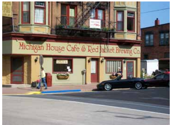
Michigan House restaurant.