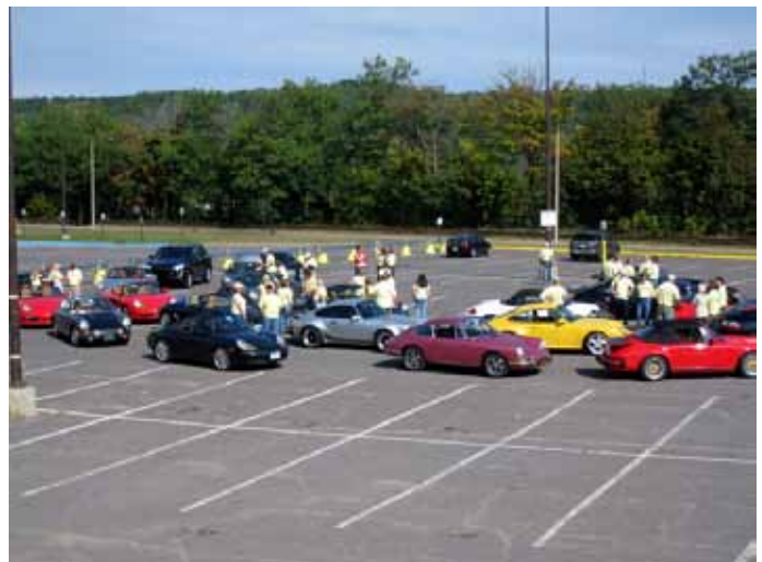
Meeting in Houghton.