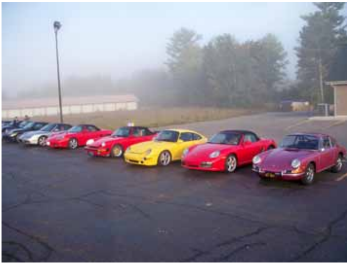
A foggy start to the day.