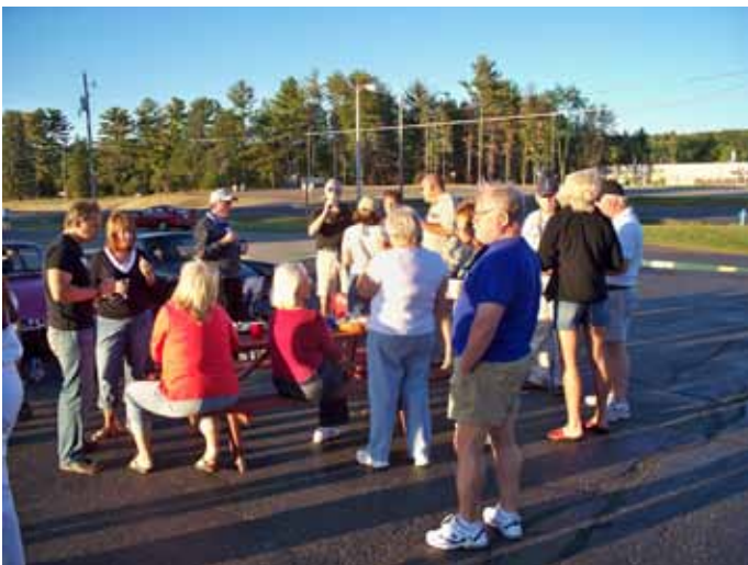
Tailgating in the Super 8 parking lot, Iron Mountain.