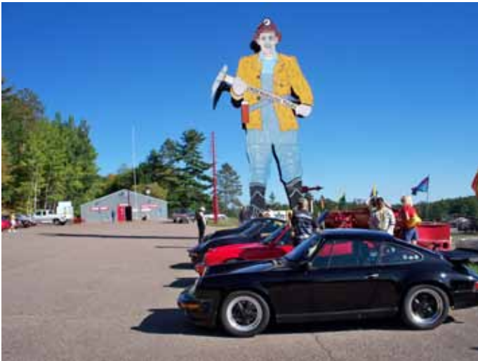
At the iron mine.