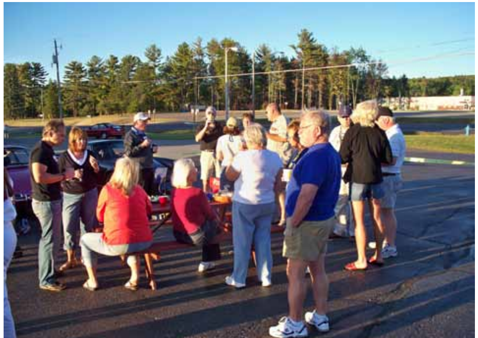
Tailgating in the Super 8 parking lot, Iron Mountain.