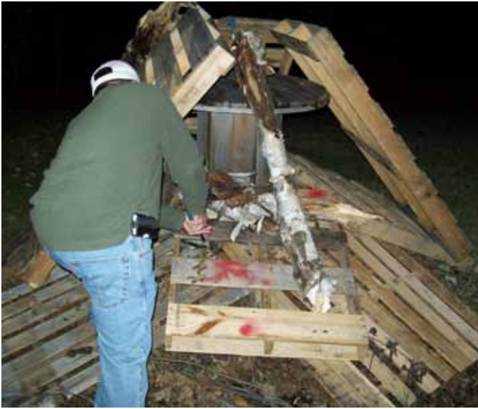
Come on baby, light my fire!