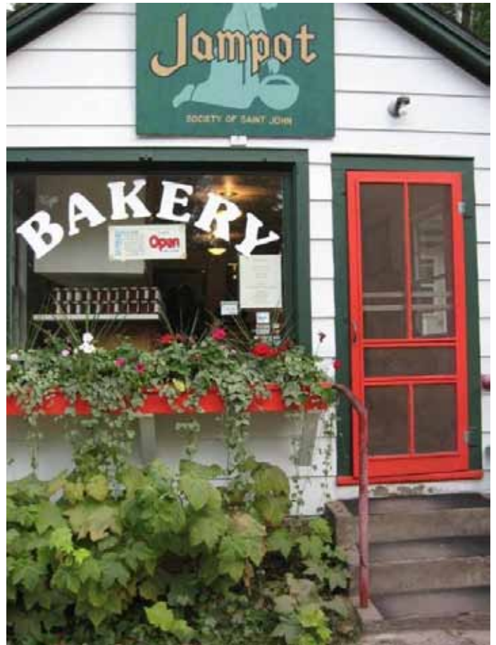
Candy/home made jelly store near Jacob's Falls