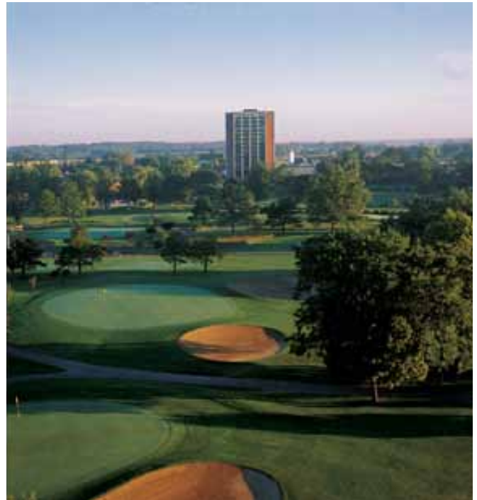
St. Charles, Illinois invites you to the 55th Porsche Parade in St. Charles at the Pheasant Run Resort. July 3rd – July 8th, 2010