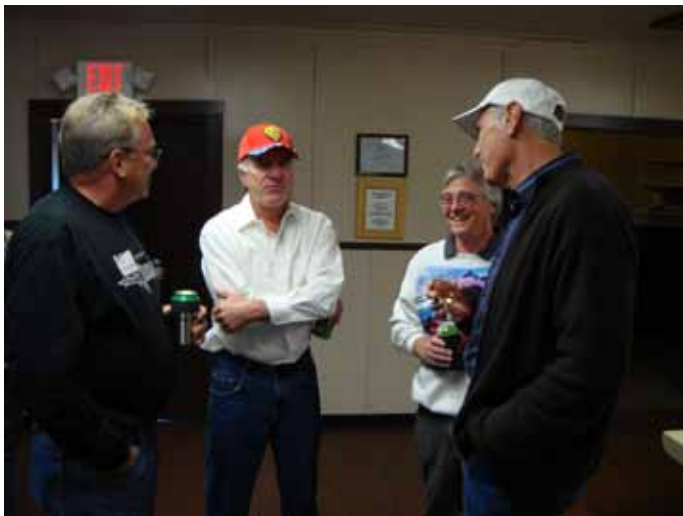
Guys sharing the big stories.