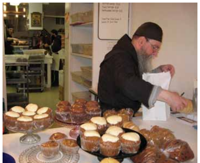
Inside the Jampot...