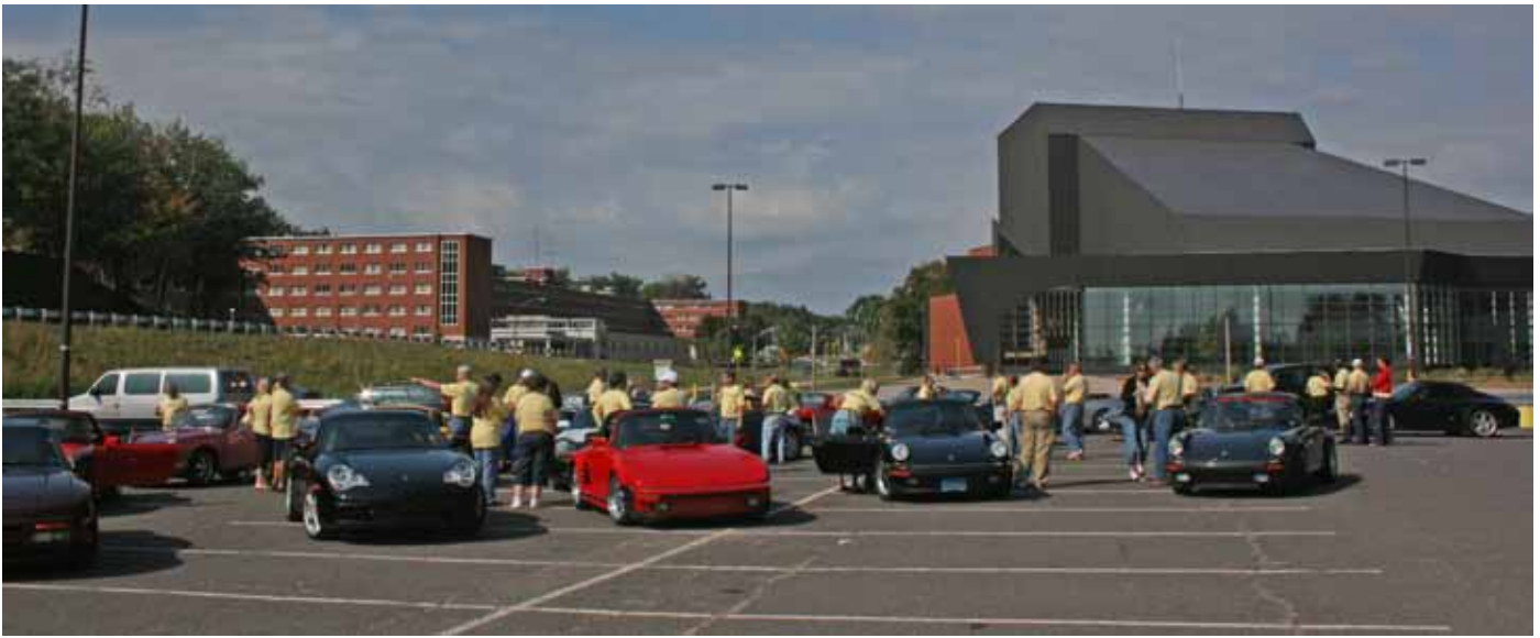
23 Porsches in a parking lot in Houghton MI