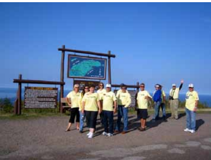
At the tip of the Keweenaw Peninsula.