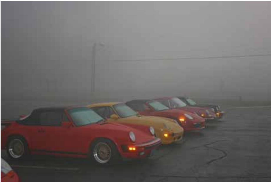
Porsches in the fog early Saturday morning of the tour.