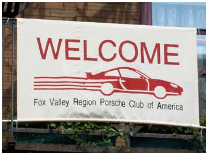
Sign on the Michigan House restaurant