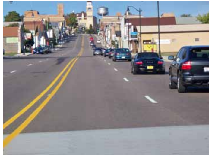
Touring through Crystal Falls, MI.