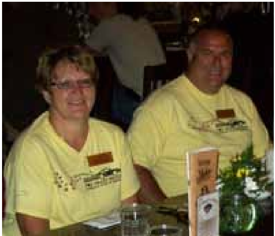
At Michigan House Cafe & Brew Pub, Calumet Michigan September 19, 2009 during the FVR PCA Fall Tour.