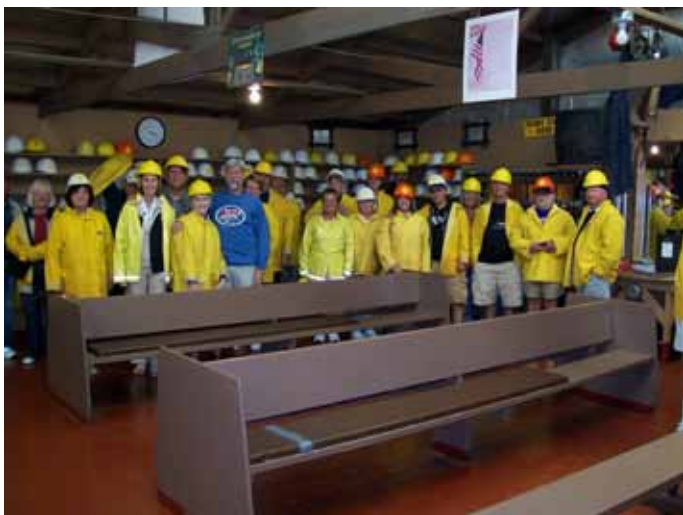
Getting ready for the tour down the iron mine.