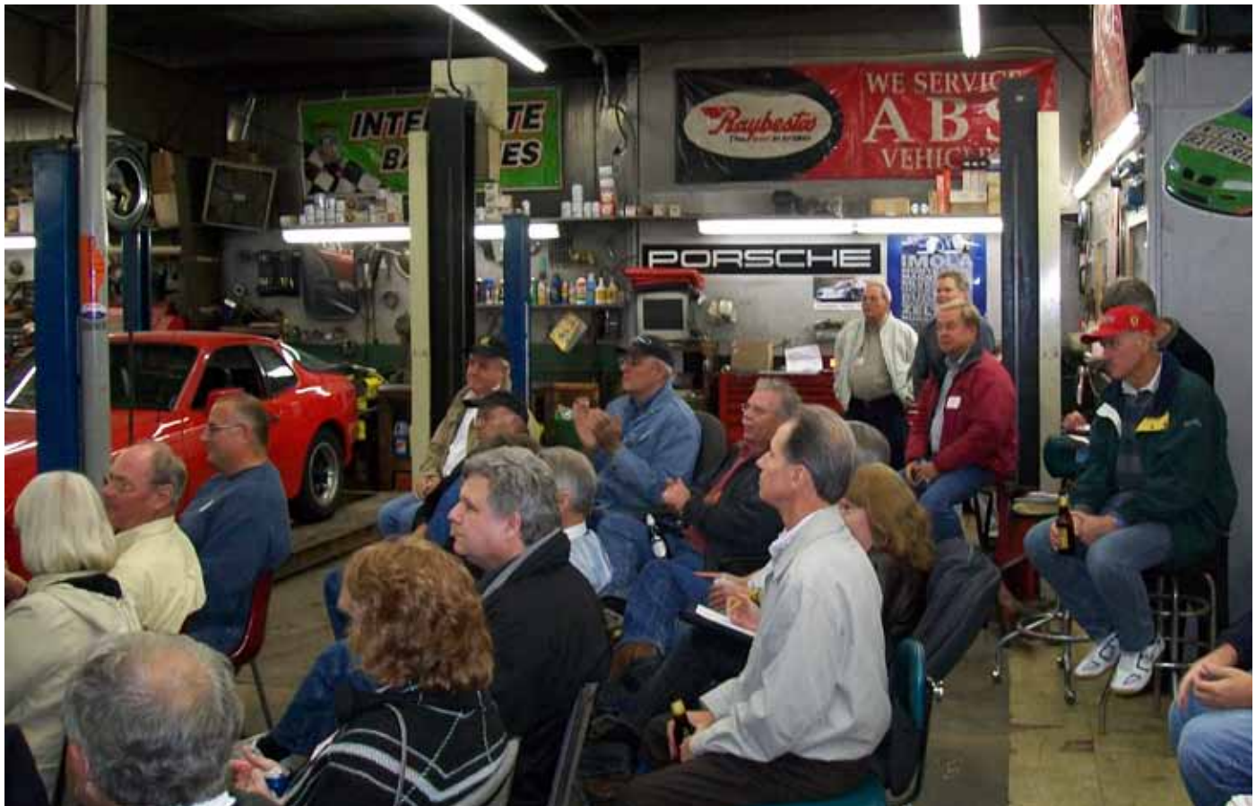
An attentive audience.

I won't go into detail about all the upcoming events, because there is a ton of them for the upcoming year, rather watch your email for unfolding schedules.