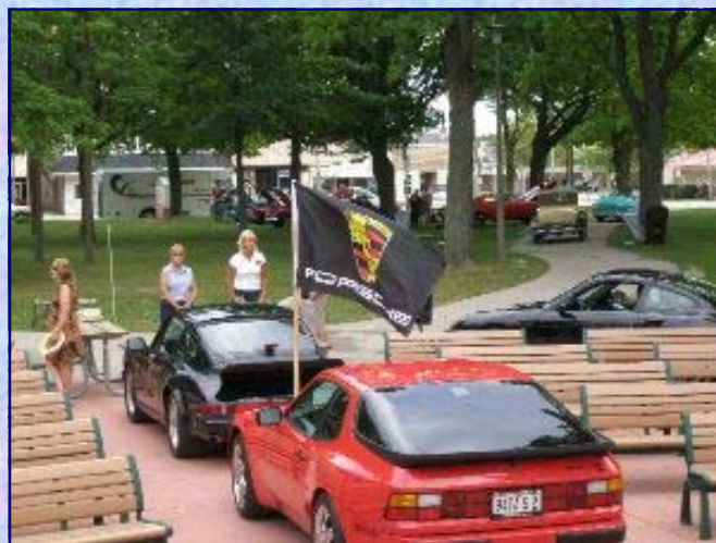
These four (4) Photos: Courtesy Jamie and Laura Prellwitz