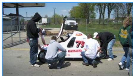
Team getting car ready