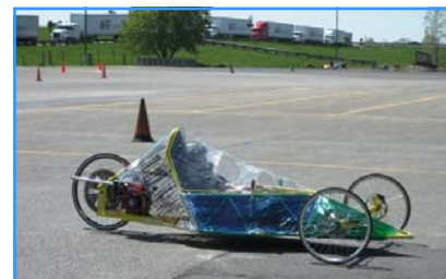
Challenged for best mileage