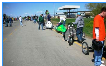
Participants lining up for the Challenge