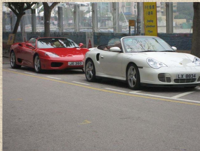
The Porsche 993 and his Italian cousin, the Ferrari 360

During my last trip in China, I was invited to ride around Hong Kong in both a 993 PORSCHE and a FERRARI 360 Spider.