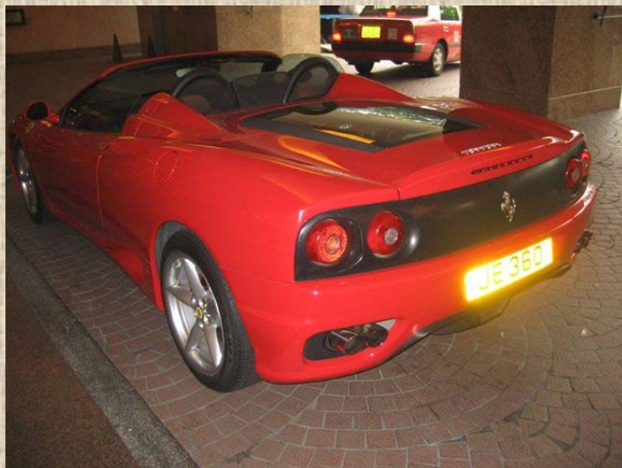
The Ferrari parked at the hotel before the ride to Stanley Market