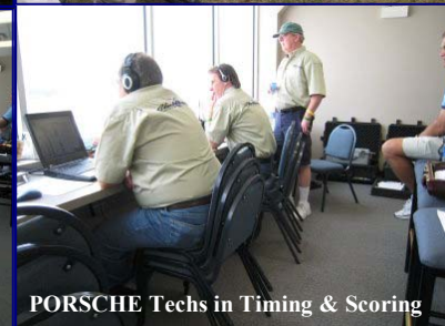
PORSCHE Techs in Timing & Scoring