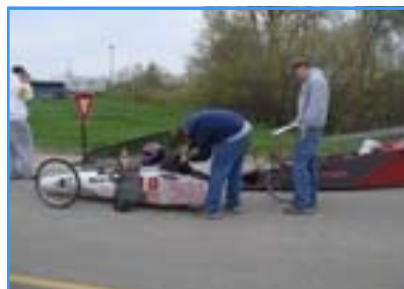
Challenged for highest mileage