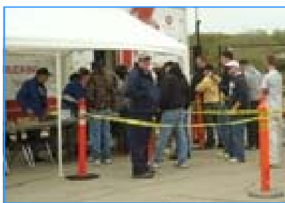
Registering to the challenge