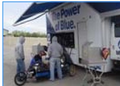
Miller Electric... the Power of blue...