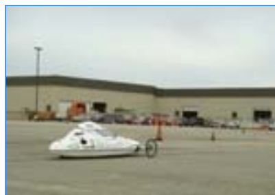
Another participant ...