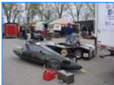
Getting the car ready