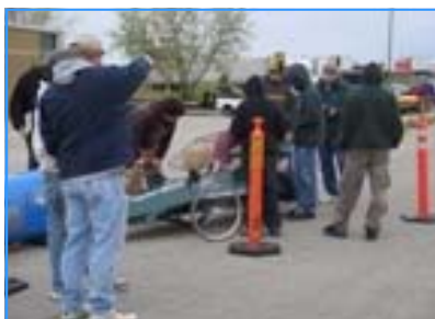
Volunteers make this day a success