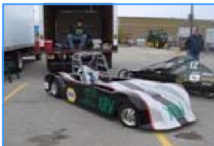
Pretty sophisticated, hey?