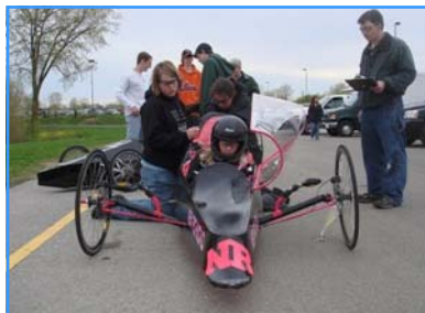
Participants lining up for the Challenge

This year again, the High Mileage Challenge was a success, in large part from the volunteer work from several folks. All of the participating students were very excited to show their edge and compete in attempting to get the maximum mileage out of their vehicles.