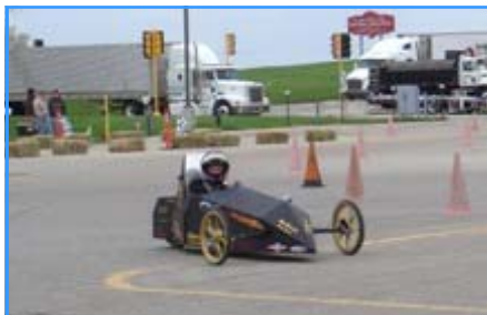
Round and round they go...