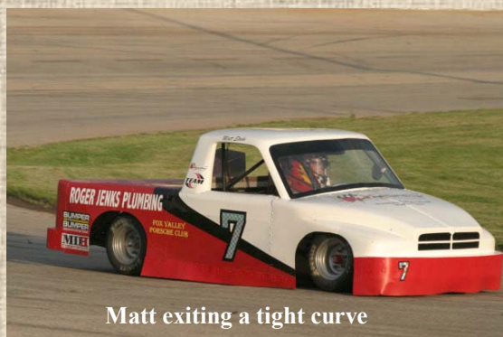
Matt exiting a tight curve

Today I am very sore but very frustrated. BUT AS THEY SAY "THAT'S RACING". I hope to have the "RACE AGAINST DRUGS" truck put back together in a couple of weeks and get back out there. I know it wont look that good for the parades and or events now but most of the time kids like to hear about the crashes m Thanks again for all your support.