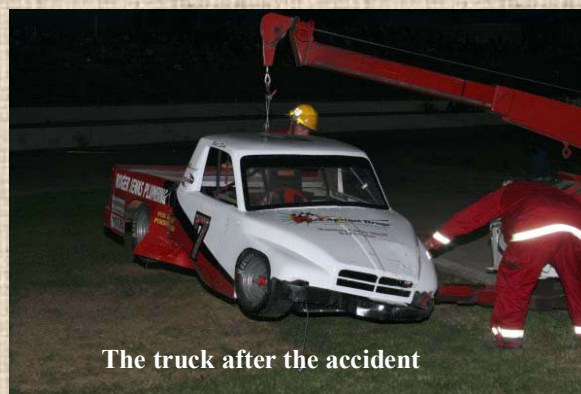
The truck after the accident

PS: I have not been able to take pictures of it yet but when I do I'll send you some. This email is more for information just in case our PCA club member's hear about the accident.