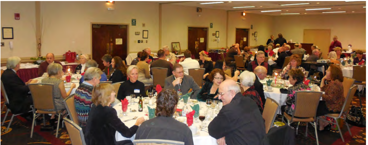
Group photo at dinner