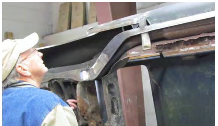
Attendees got a close look at the underside of the 911.