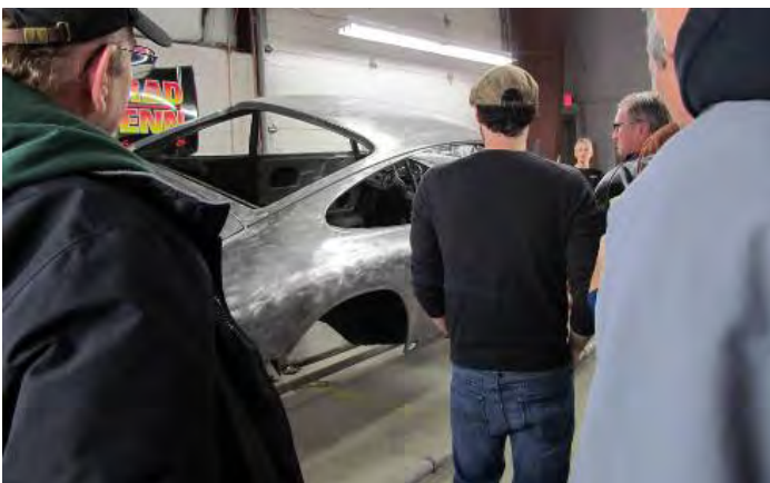
The 1966 911 rests on a “rotisserie,” which rotates the car for easy access during restoration work.