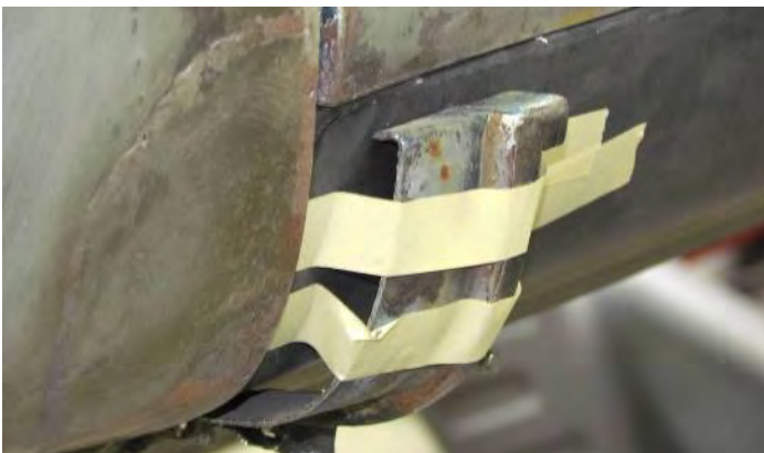
Masking tape is not a permanent solution.