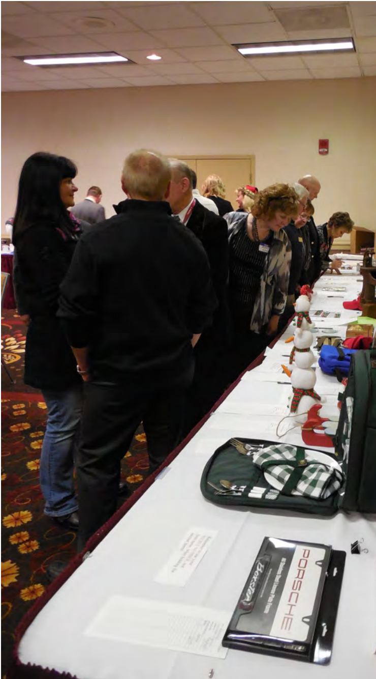
Guests were viewing hte any great items available for bidding suring the silent auction