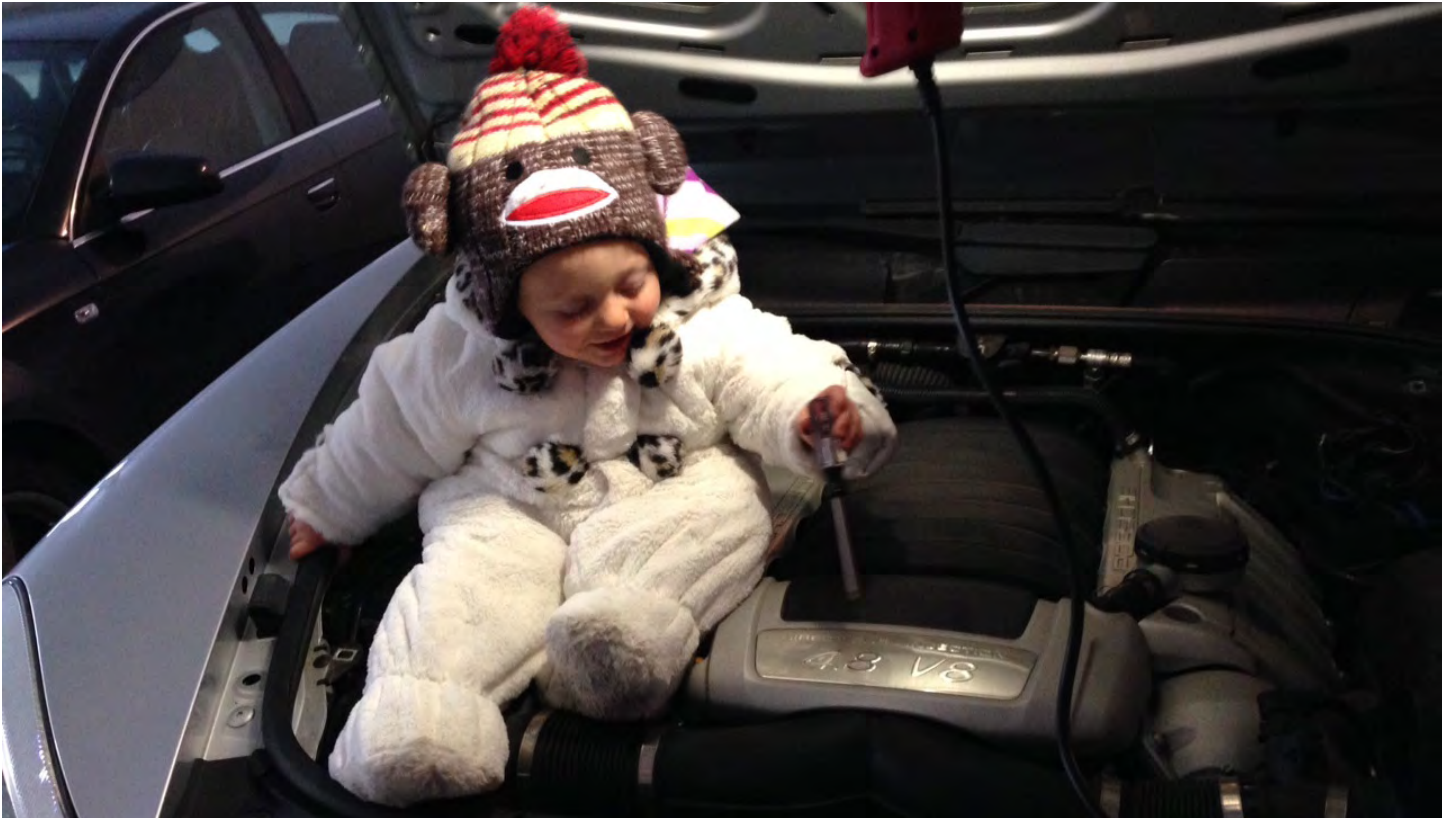
Teaching them young - changing the air filters.