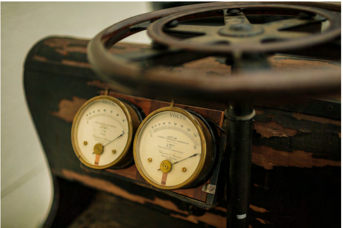
The overall range of the vehicle could span up to 80 kilometres.