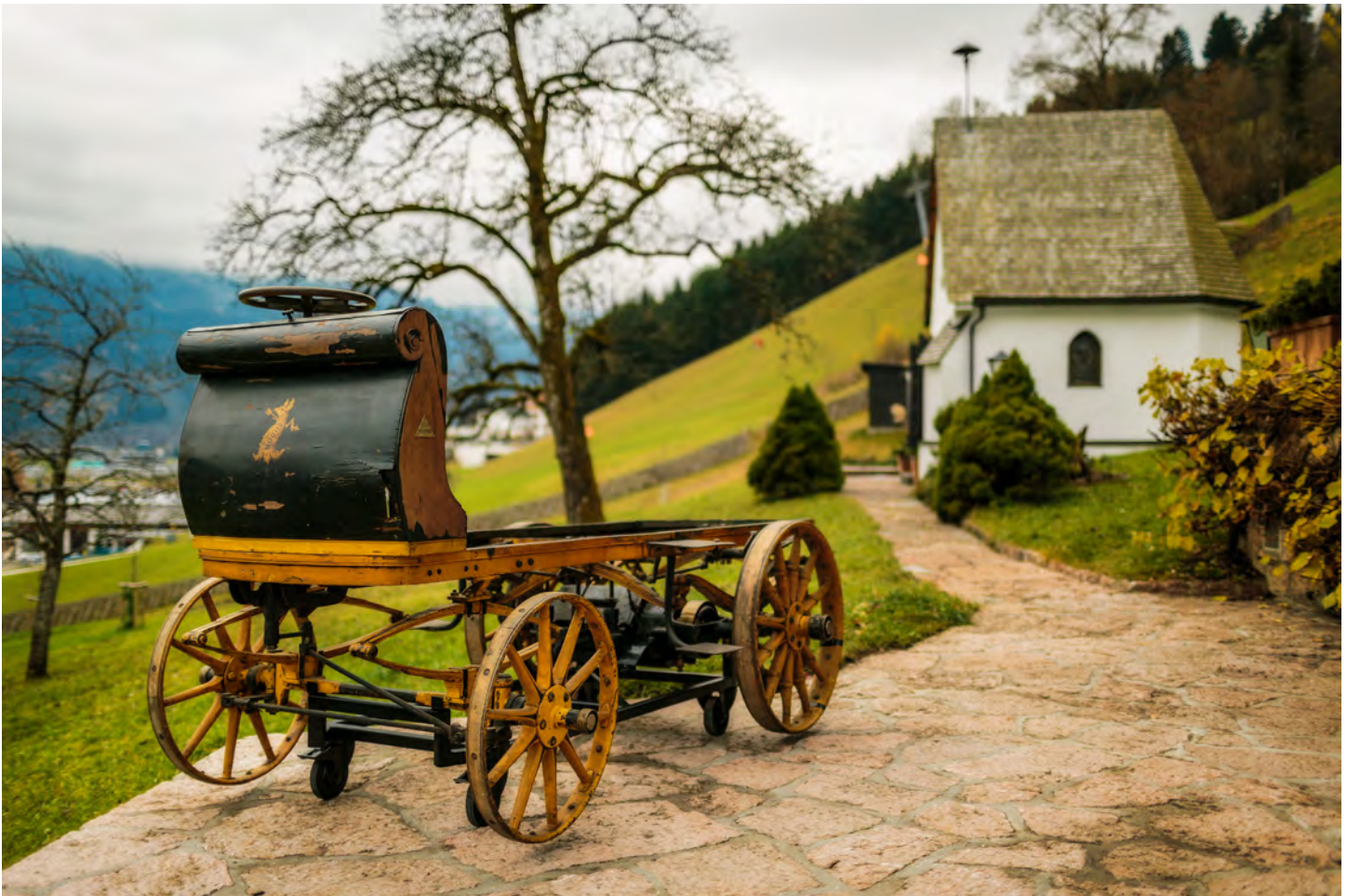
World premiere on the fifth anniversary of the Porsche Museum: the return of the "P1"

Since the construction of the first sportscar to bear the Porsche name - the Type 356 from 1948 - Dr. Ing. h.c. F. Porsche AG has been regarded as the world's leading sportscar manufacturer. Yet the company's history dates back to a much earlier period: In 1898, Ferdinand Porsche presented the "Egger-Lohner electric vehicle, C.2 Phaeton model" (known as the "P1" for short) - the world's first Porsche design. After 116 years, the original and unrestored vehicle has been recovered and is set to enrich the Porsche Museum's collection as a technical and historical worldwide sensation.