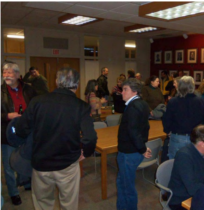
A one hour social time in the Emeritus Room preceded the movie showing. Approximately two dozen FVR-PCA members were in attendance.

Watch trailer at: http://www.imdb.com/video/user/vi744466713/?ref=tt_ov_vi