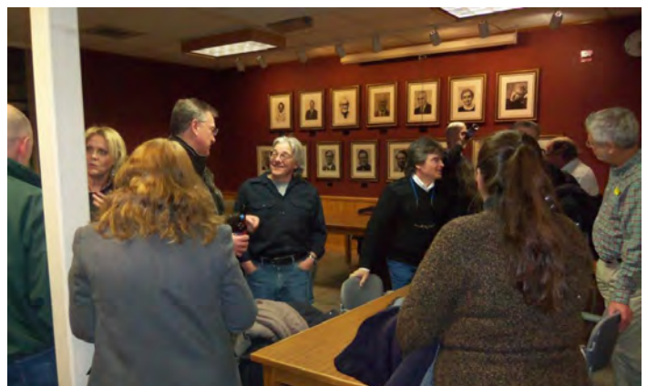
Social time prior to the movie